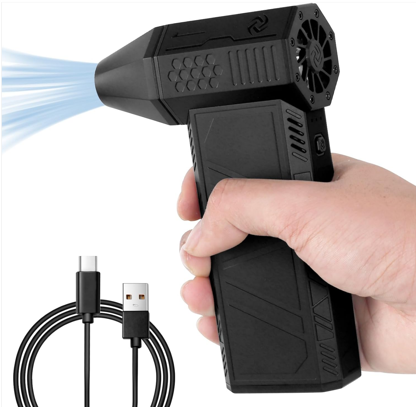
Image: The Tcwhniev Mini Jet Blower shown alongside its USB Type-C charging cable, illustrating the charging interface.