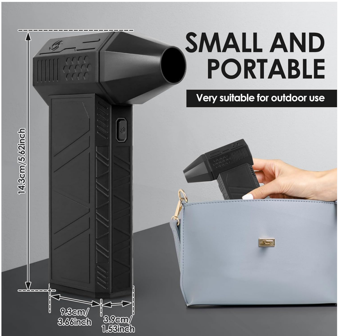
Image: A diagram illustrating the compact dimensions of the Townniew Mini Jet Blower, showing its length (14.3cm/5.62inch), width (9.3cm/3.66inch), and thickness (3.9cm/1.53inch), emphasizing its portability.