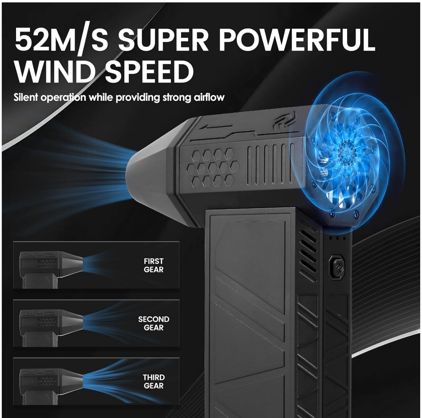
Image: Illustration of the Towhniev Mini Jet Blower's three wind speed settings: First Gear, Second Gear, and Third Gear, showing increasing airflow intensity.