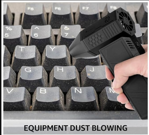
Image: The Tcwhniev Mini Jet Blower being used for multiple scenarios, including camera dust blowing, combustion-supporting for grilling, blow-drying pets, and equipment dust blowing for keyboards.