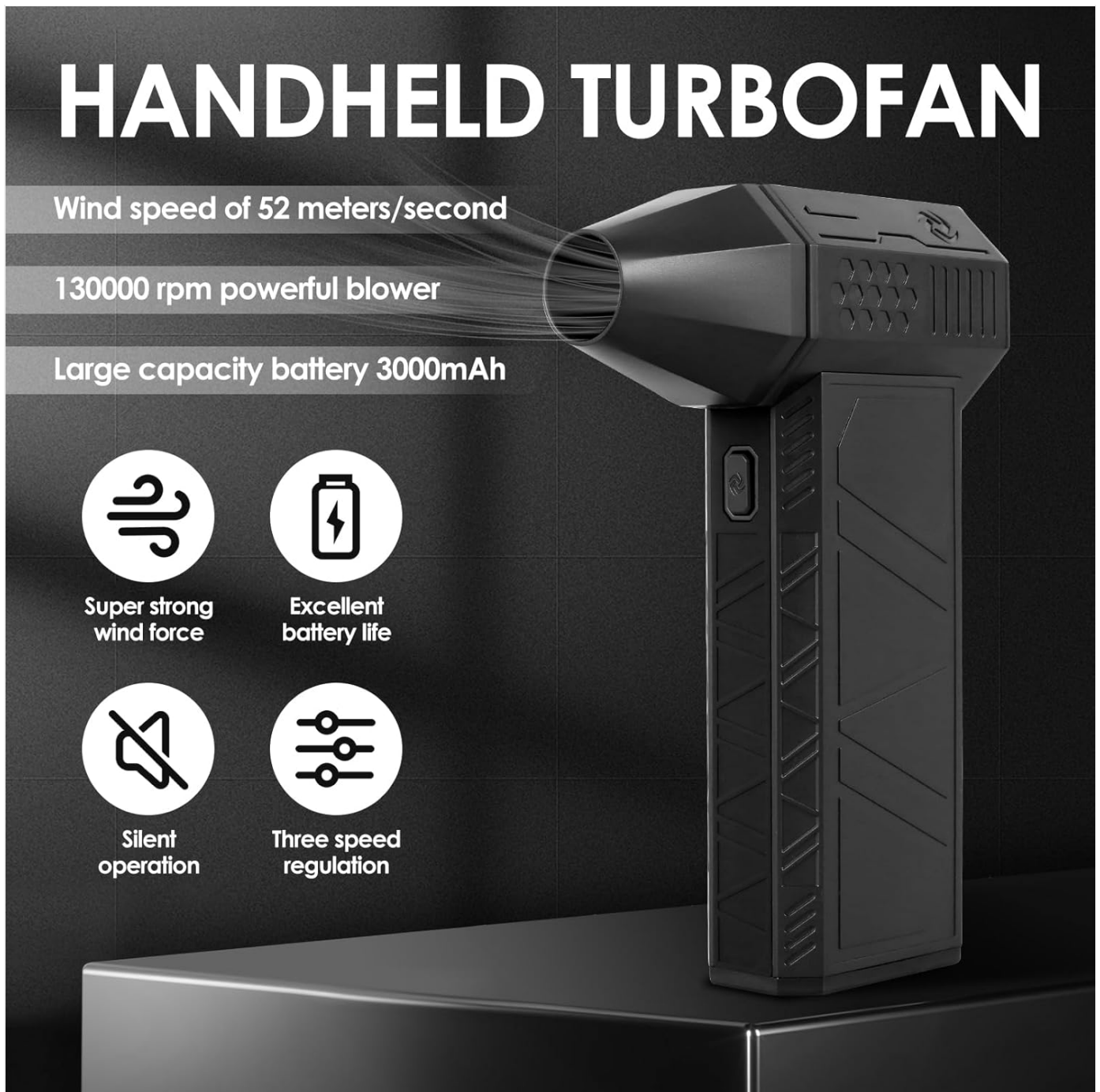
Image: The Tcwhniev Mini Jet Blower highlighting its key features: 52 meters/second wind speed, 130,000 RPM powerful blower, 3000mAh large capacity battery, super strong wind force, excellent battery life, silent operation, and three-speed regulation.