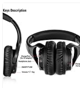
Image: Close-up view of a ZANCHIE headphone earpad, highlighting its soft material.