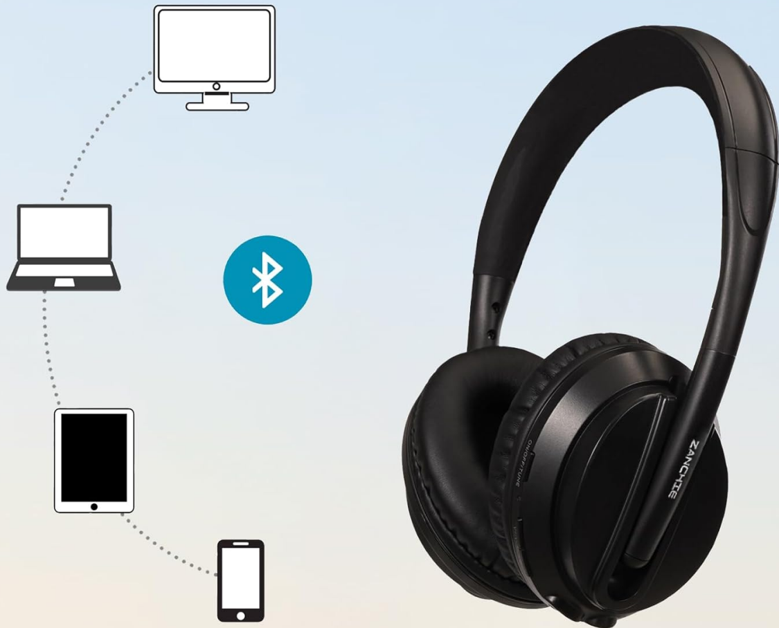
Image: ZANCHIE headphones demonstrating Bluetooth connectivity with various devices such as laptops, tablets, and smartphones.

Can pair the headphones with other Bluetooth devices