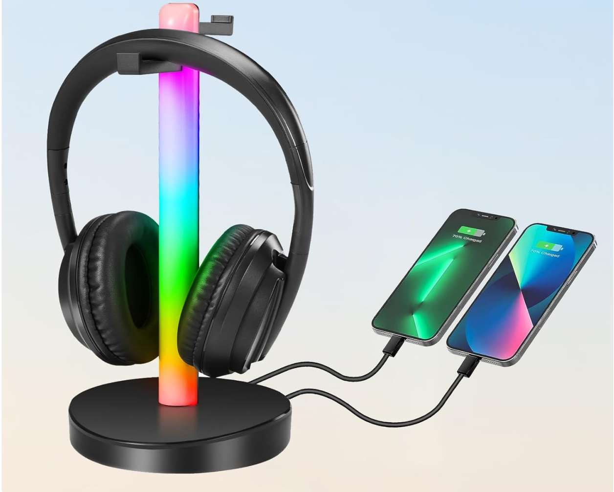
Image: The ZANCHIE transmitter stand demonstrating its capability to charge two smartphones simultaneously.

You can charge your smartphones or headphones from the USB ports of the base