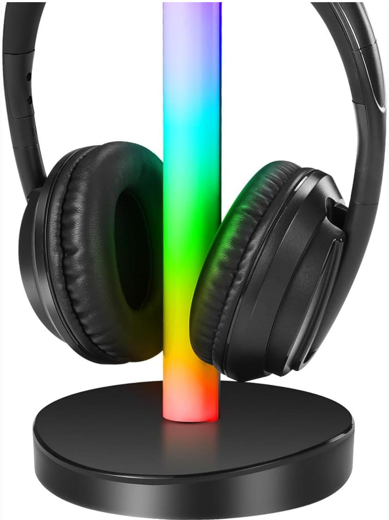
Image: ZANCHIE YH720 Wireless Headphones resting on the RGB illuminated transmitter stand.