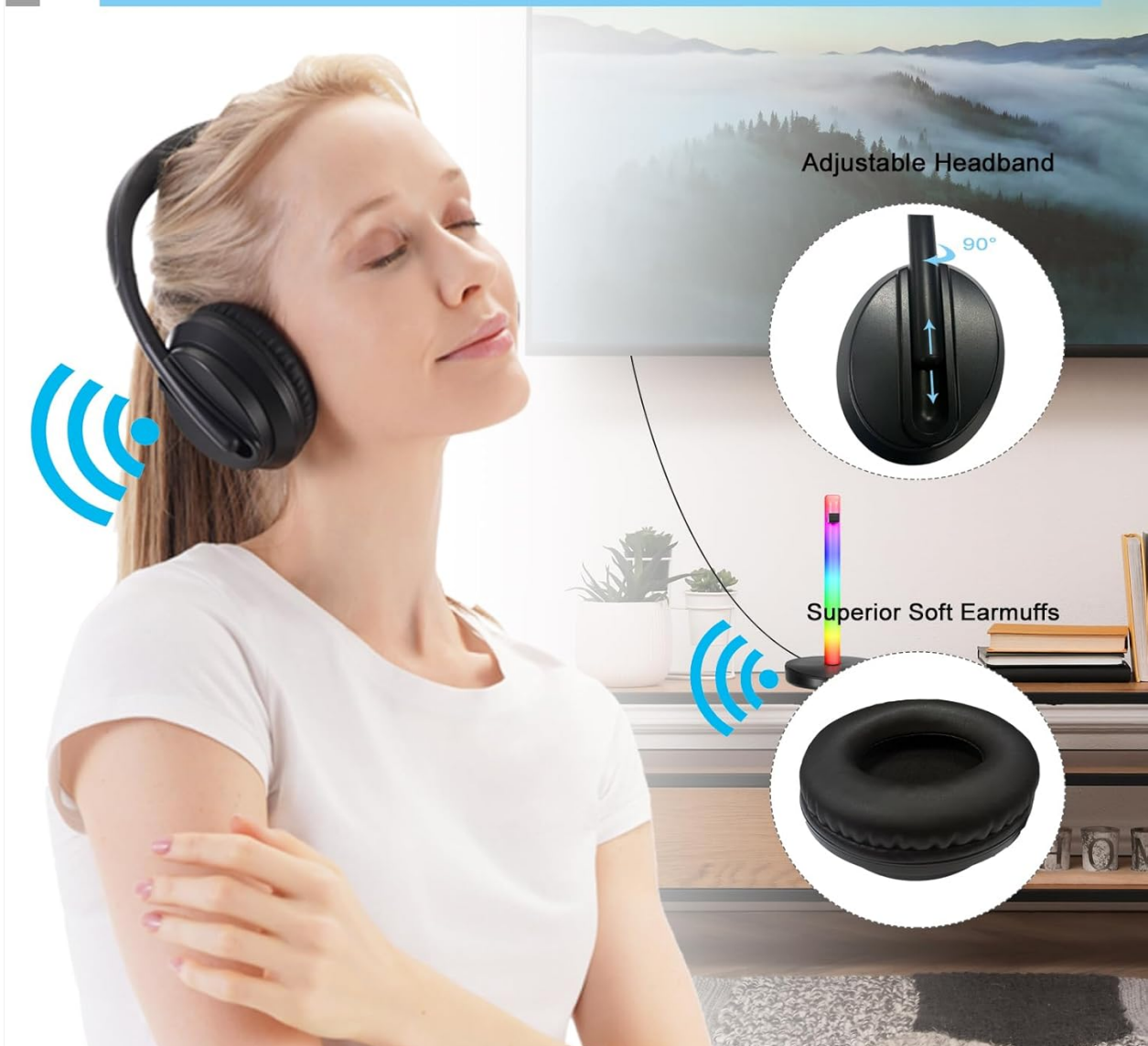
Image: ZANCHIE YH720 Wireless Headphones showing adjustable headband and soft earmuffs.