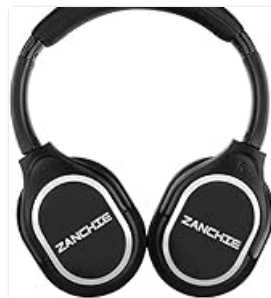
Image: Illustration of multiple ZANCHIE headphones simultaneously receiving audio from one transmitter.