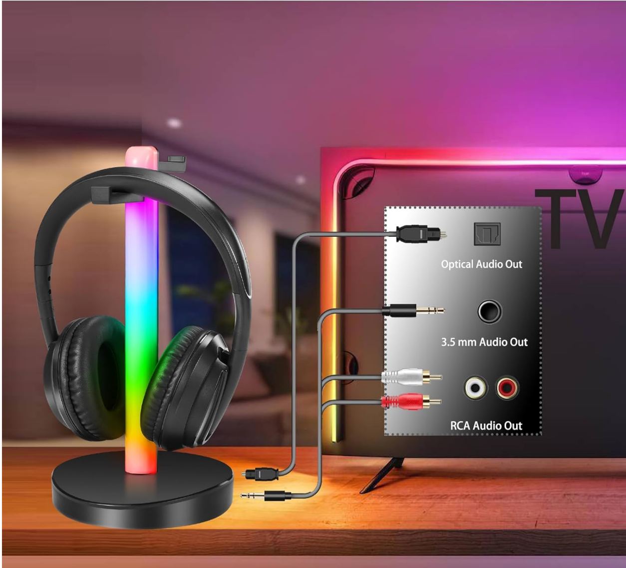
Image: Connection diagram illustrating how to connect the ZANCHIE transmitter to a TV using optical, 3.5mm, or RCA audio cables.

Mostly compatible with 99% of TVs on the market