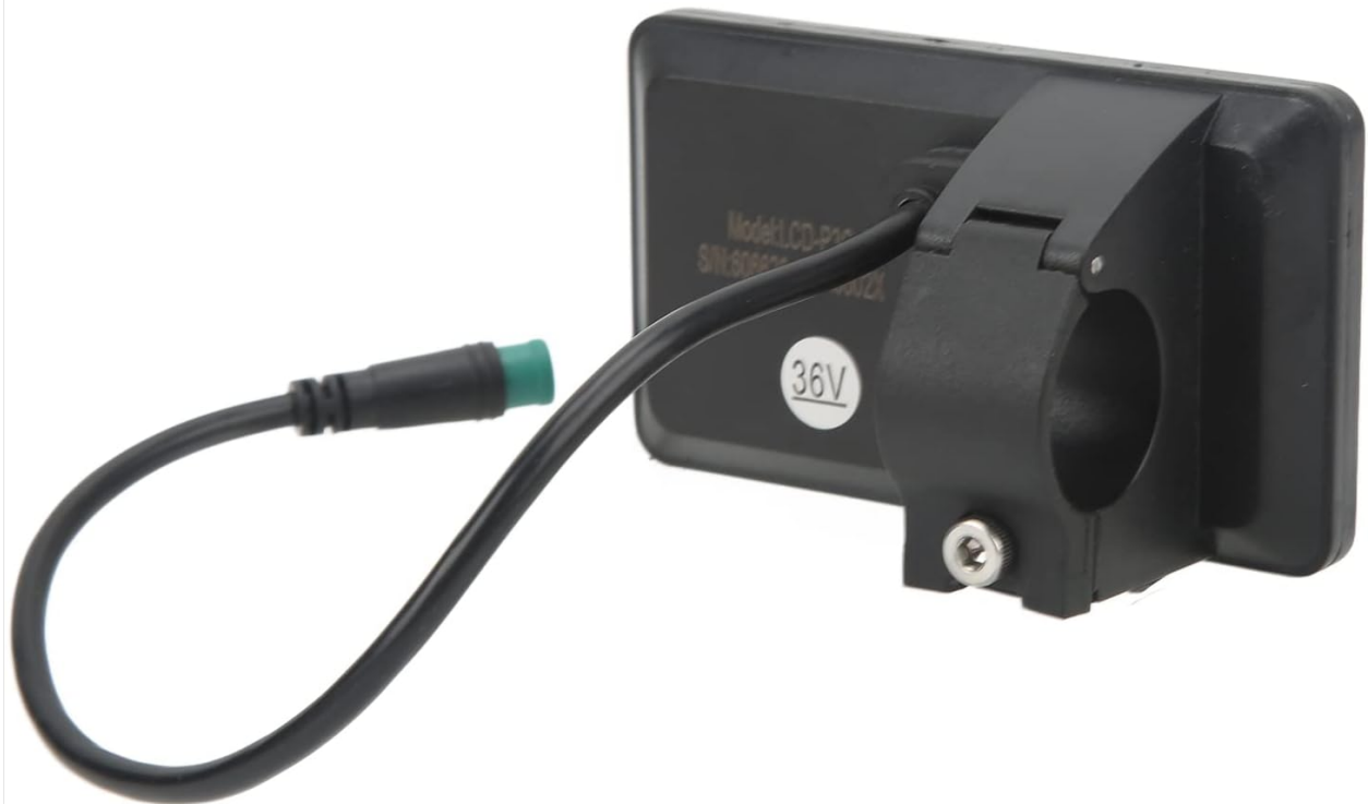
Image illustrating the product's diameter specification.

(Manual Measurement, Slight Error May Exist)