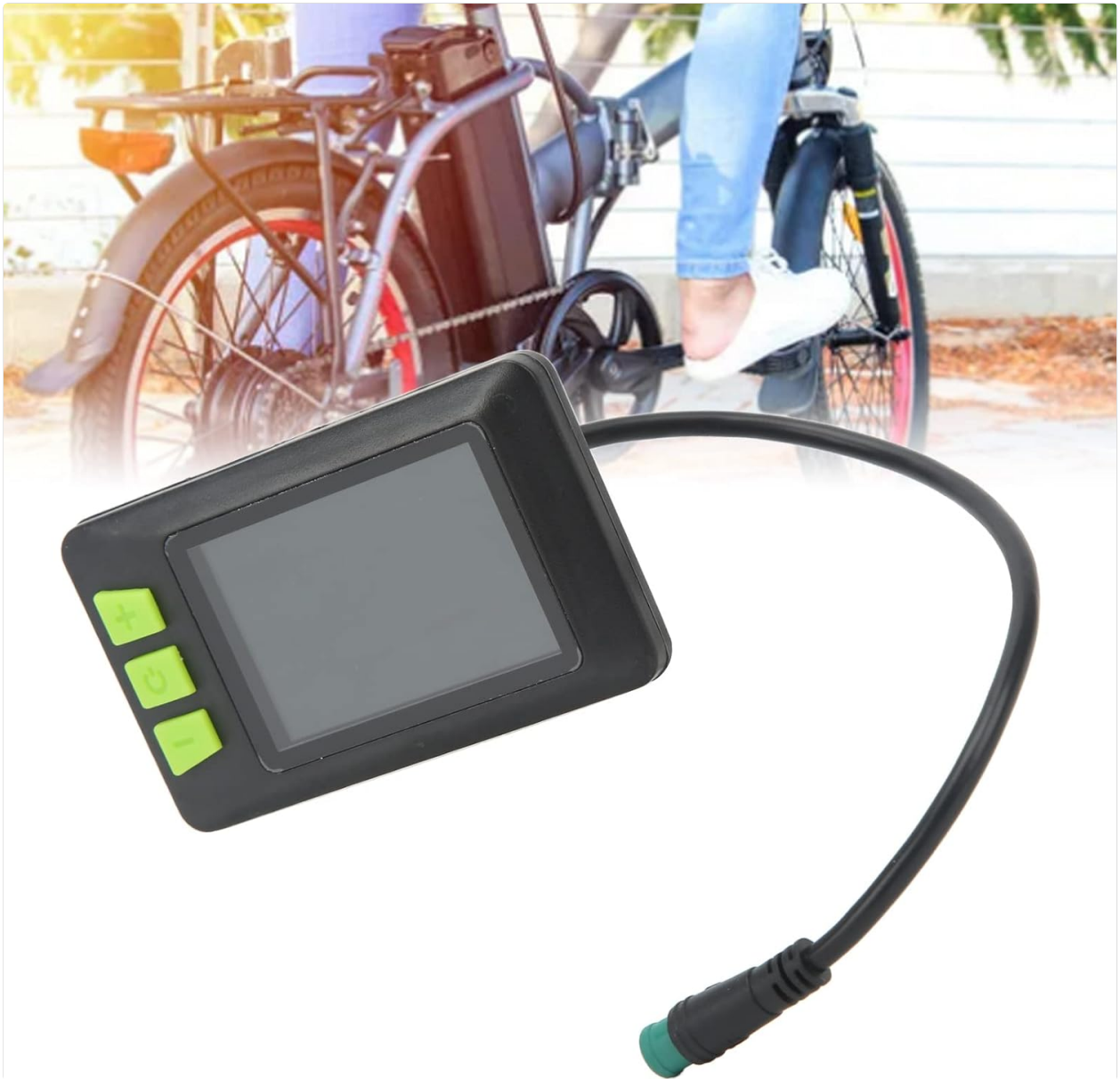
The Topyond LCD Display installed on an ebike, demonstrating its placement and integration.