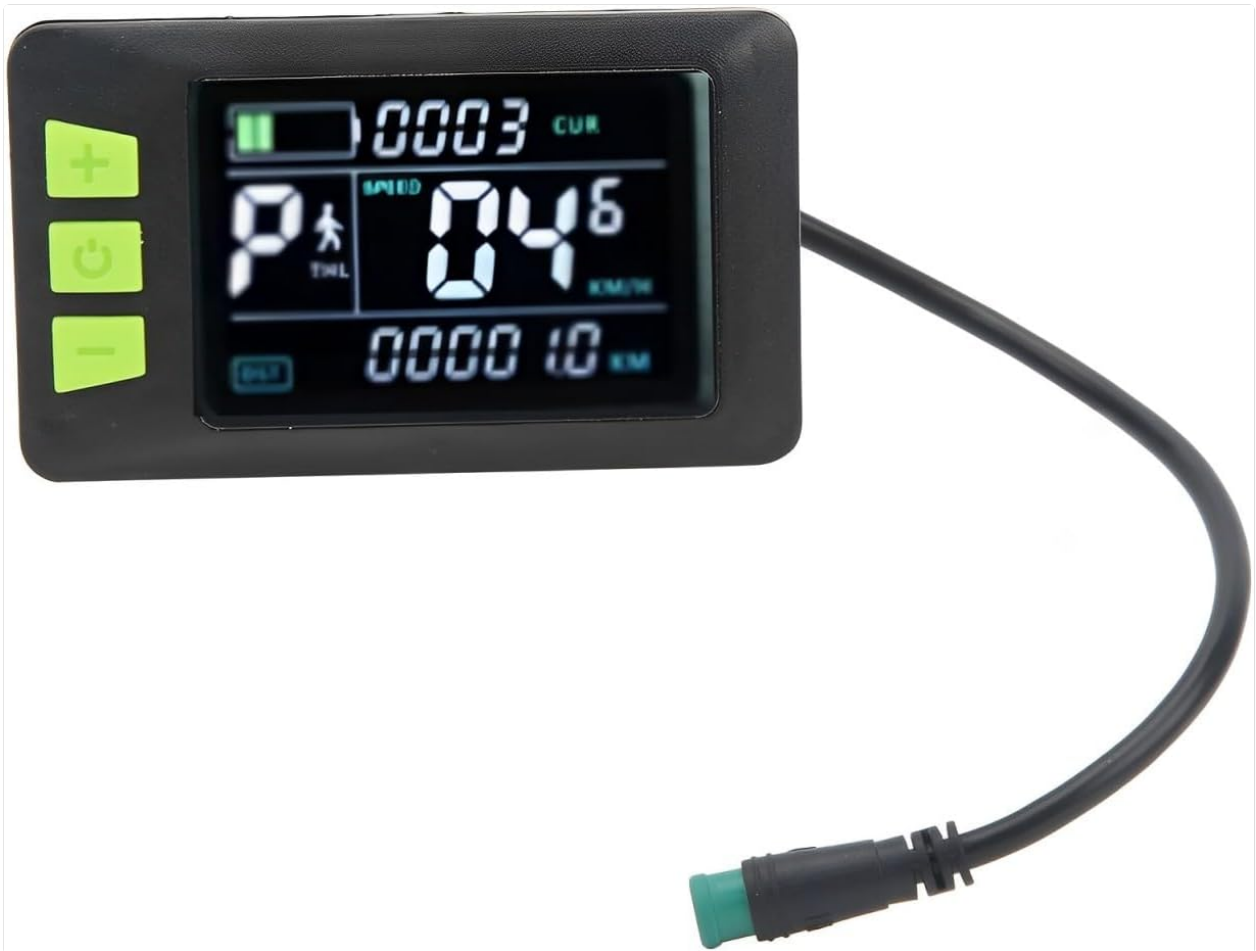
Front view of the Topyond Ebike LCD Display, showcasing its digital screen and control buttons.

The Topyond Ebike LCD Display features a clear screen and intuitive button layout for easy operation. Below are images illustrating the display from various angles, highlighting its design and key features.