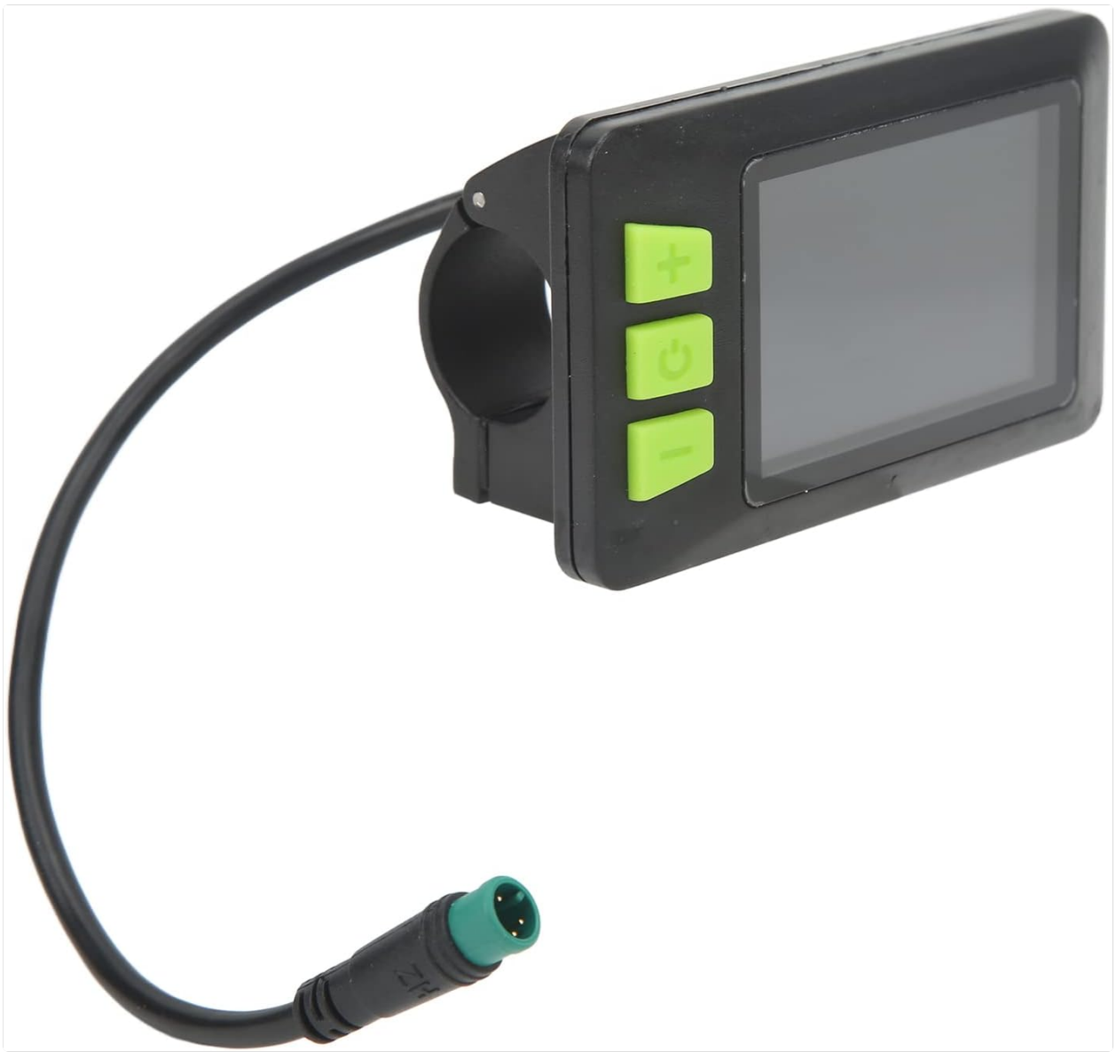
Angled view of the display, providing a perspective of its compact form factor.