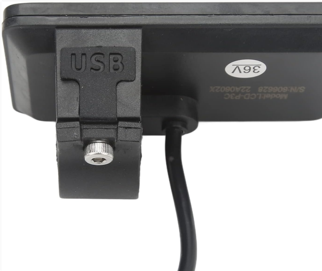
Close-up of the USB port, which may be used for charging or data transfer depending on the model's functionality.