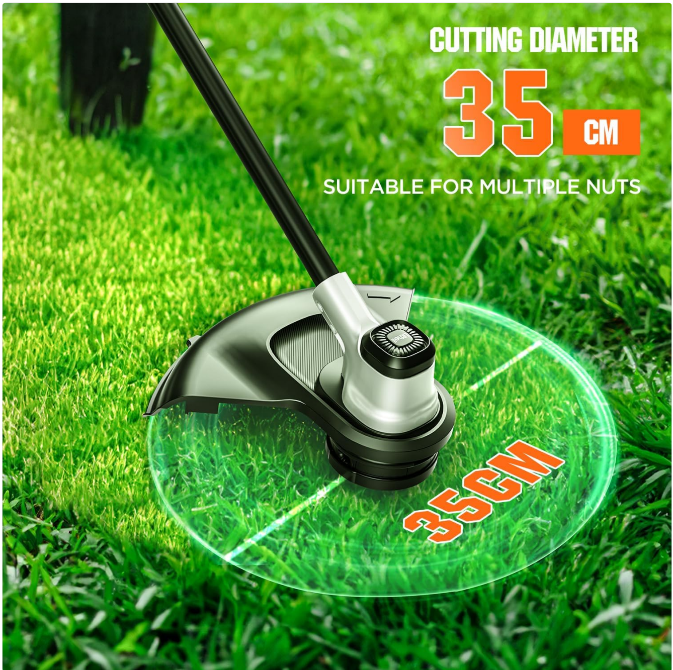
Figure 4.3: The cutting head illustrating the 35 cm cutting diameter for efficient operation.