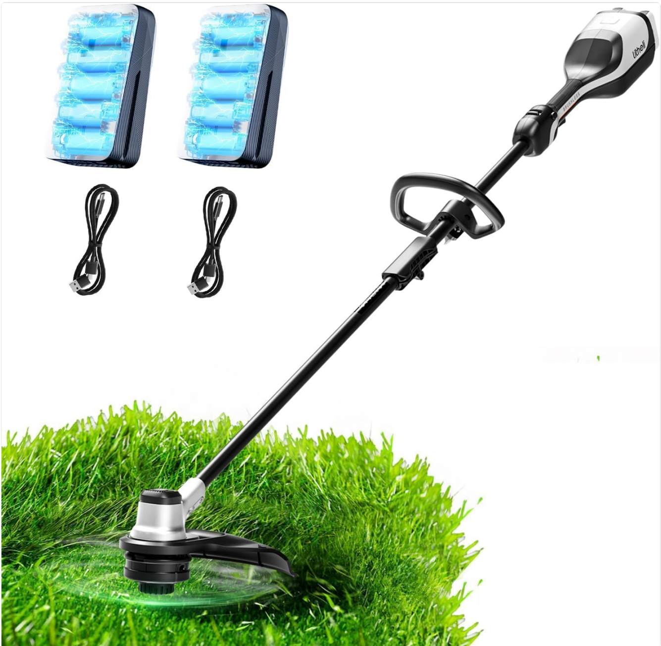
Figure 2.1: The Litheli Cordless Brush Cutter, including the main unit, two 20V 2.0Ah batteries, and charging cables.