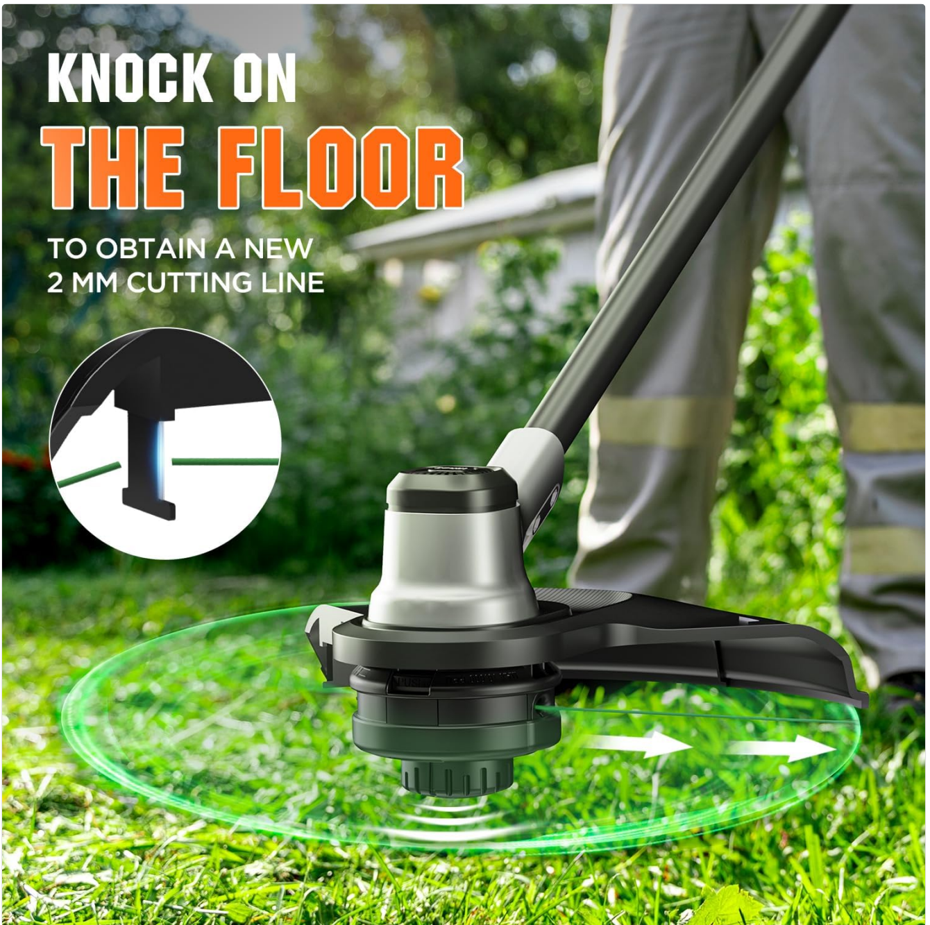
Figure 4.2: Visual guide on using the bump feed system to obtain a new 2 mm cutting line by tapping the trimmer head on the ground.