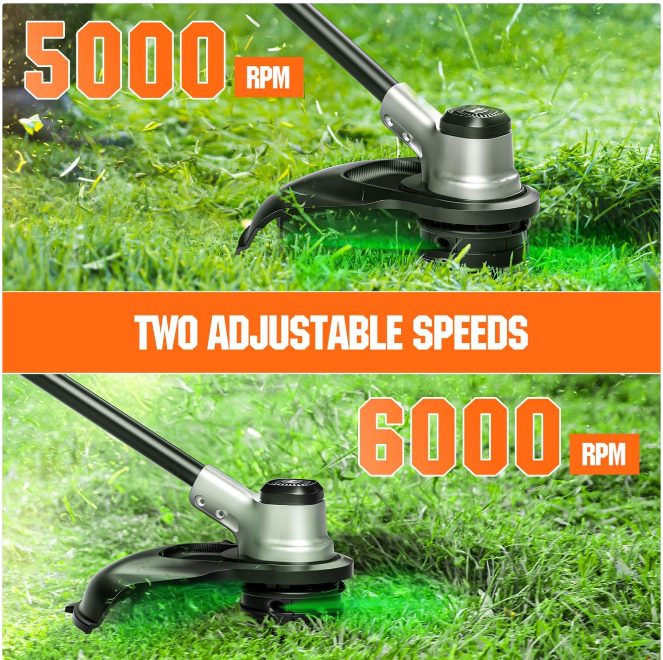
Figure 4.1: Illustration of the two adjustable speed settings, 5000 RPM and 6000 RPM, available on the brush cutter.

The tool offers two adjustable speeds: 5000 RPM and 6000 RPM. Use the speed selector switch on the handle to choose the appropriate speed for the task. Lower speeds are suitable for lighter trimming, while higher speeds are for denser vegetation.