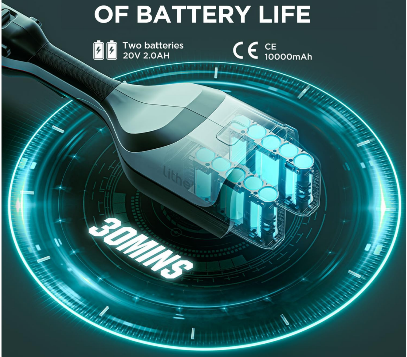
Figure 7.1: The battery system, indicating approximately 30 minutes of continuous operation with two 20V 2.0Ah batteries.