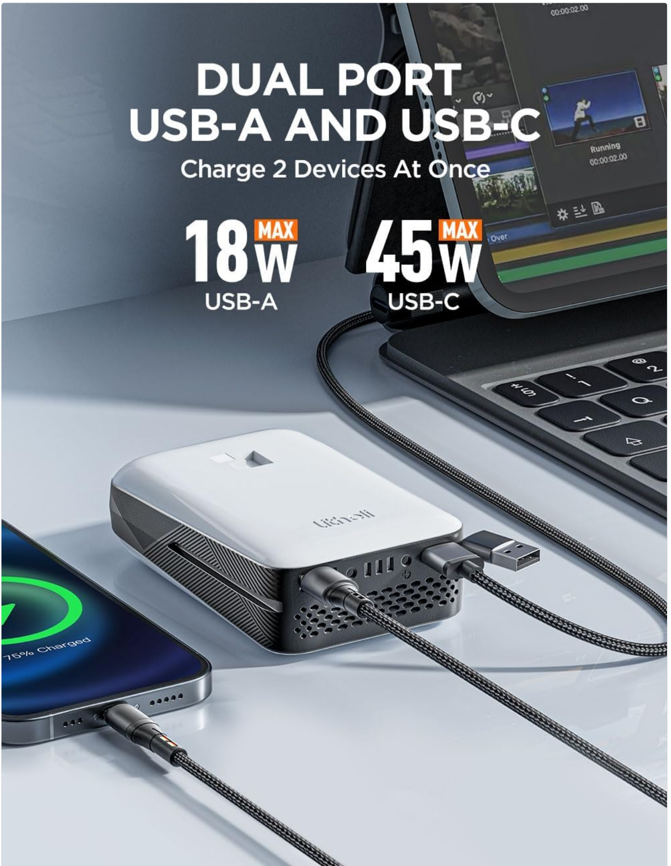
Figure 7.2: The Litheli battery's additional functionality as a power bank, featuring dual USB-A (18W max) and USB-C (45W max) ports for charging other electronic devices.