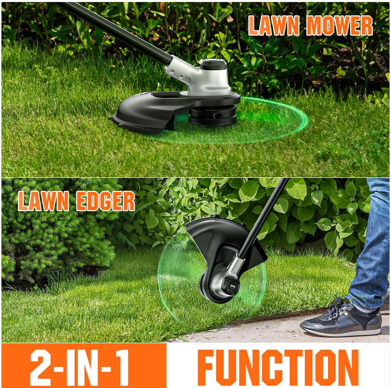
Figure 3.1: The 2-in-1 function of the brush cutter, demonstrating its use as a lawn mower (trimmer) and a lawn edger.