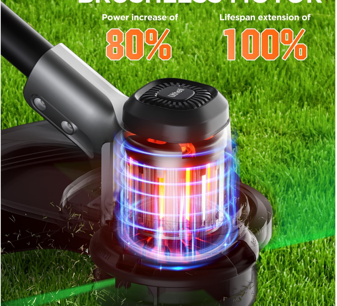
Figure 5.1: The brushless motor, highlighting its internal components, which contributes to the tool's durability and efficiency.