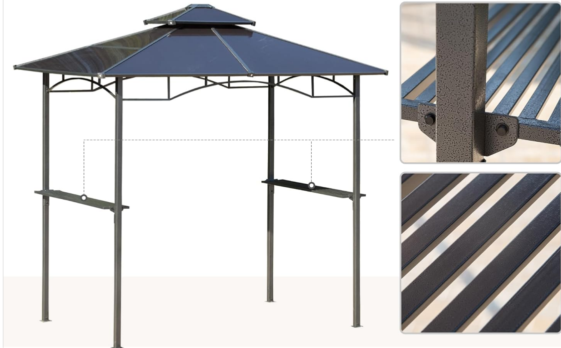
Image 4.2: The shelter features two practical side shelves for storage.