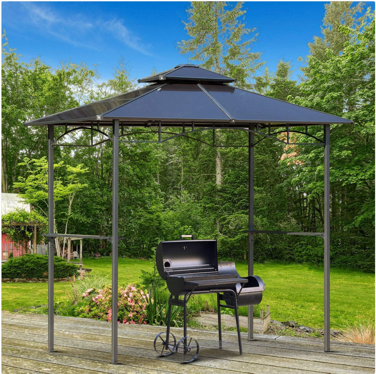
Image 1.1: The Outsunny Barbecue Shelter providing shade for a grill in a garden.