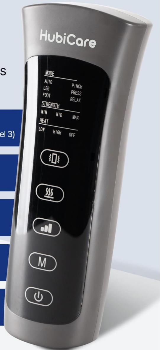
Figure 5.1: The intuitive control panel allows for easy customization of your massage experience.