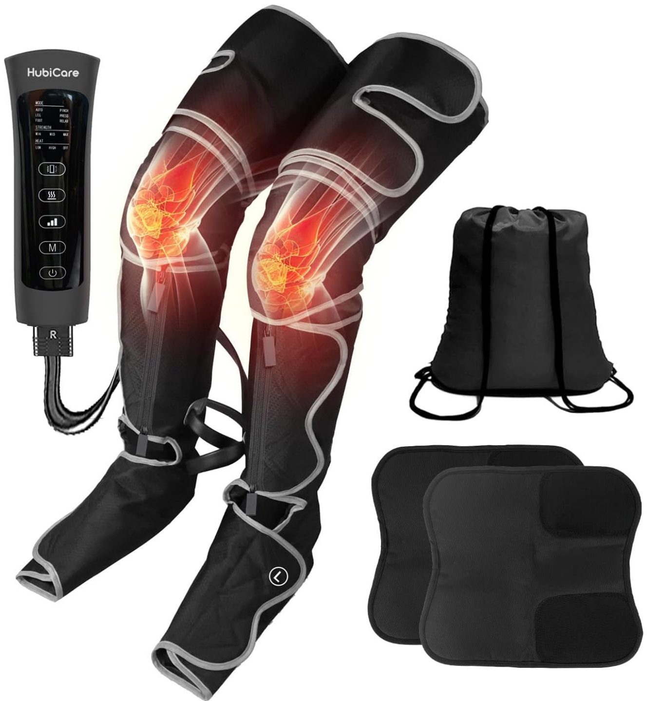
Figure 3.1: All components included in the HubiCare Leg Massager package.