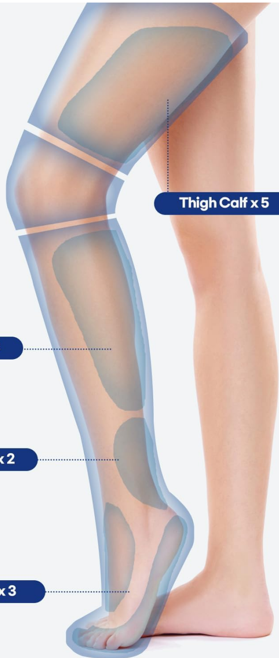
Figure 2.1: Illustration of the 13 airbag distribution for comprehensive leg massage.