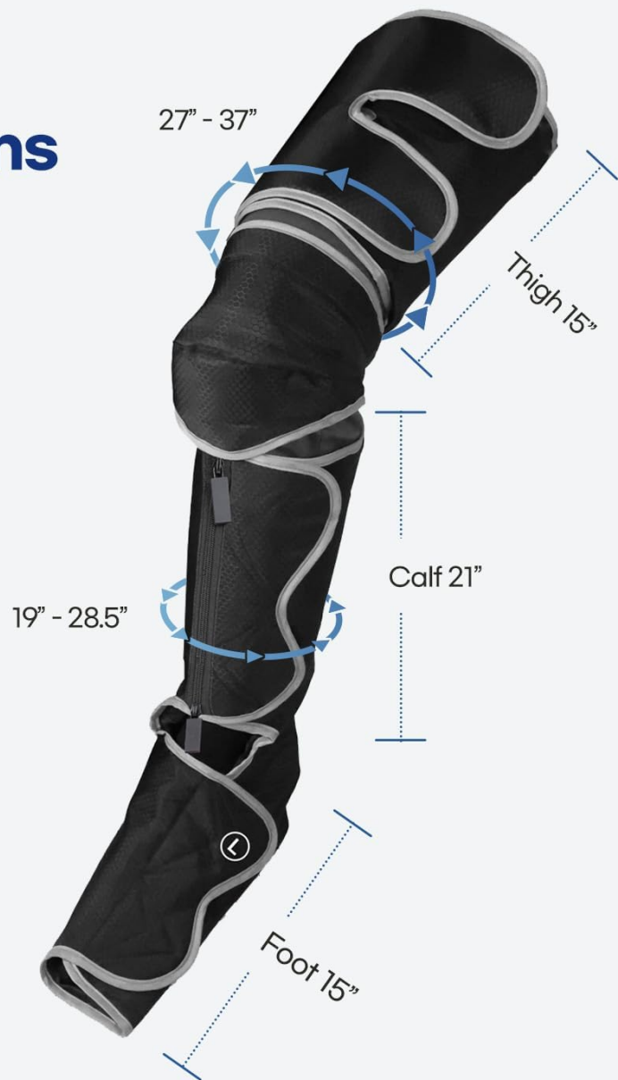
Figure 4.2: The massager fits most leg sizes and can be extended for larger dimensions.

Video 4.1: A demonstration on how to properly wear the HubiCare leg massager, including securing the Velcro straps and connecting the controller.