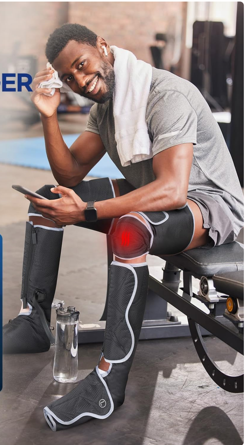
Figure 4.1: Proper way to wear the HubiCare Leg Massager for full coverage.