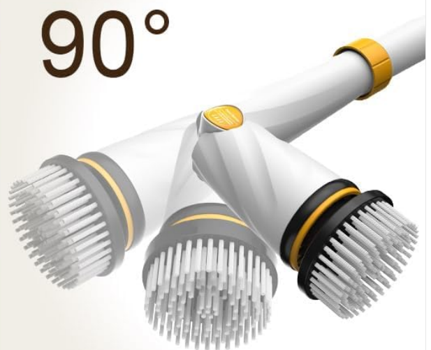
Image: A user cleaning a tiled wall with the Qimedo Electric Spin Scrubber, demonstrating the adjustable extended handle. Insets show the handle at various lengths (69cm/42.7in, 108cm/42.9in, 126cm/49.6in) and the brush head articulating up to 90 degrees for flexible cleaning angles.