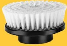
Big Flat Brush for flat floors