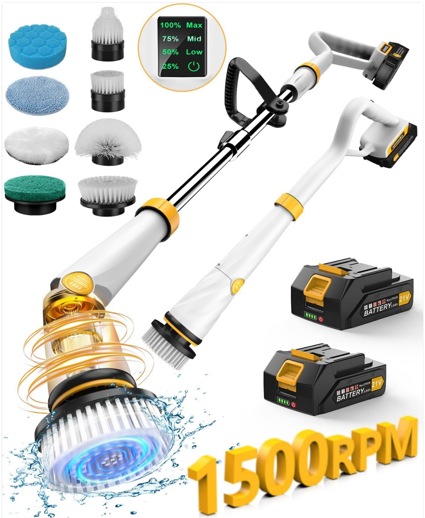
Image: The Qimedo Electric Spin Scrubber Q2 Pro, showcasing its main unit, extension handle, two batteries, and a variety of included brush heads. The display shows power modes and battery level, and the brush head is depicted in action with water splashing.