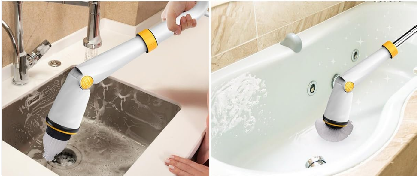
Image: The Qimedo Electric Spin Scrubber's brush head is shown submerged in water, demonstrating its IPX7 waterproof capability. Additional images show the scrubber being used to clean a sink and a bathtub, emphasizing its suitability for wet environments.