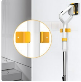
Image: A close-up view of the Qimedo Electric Spin Scrubber handle, showing a yellow wall-mounted hook designed for convenient storage. The hook is positioned to hold the scrubber upright against a wall.

The included hook can be mounted in a corner or on a wall for convenient storage of the scrubber. The brush head bag provides a tidy way to store the various brush attachments.