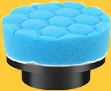
Sponge Brush for glass cleansing, waxing