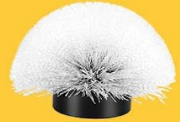
Dome Brush for corners and crevices