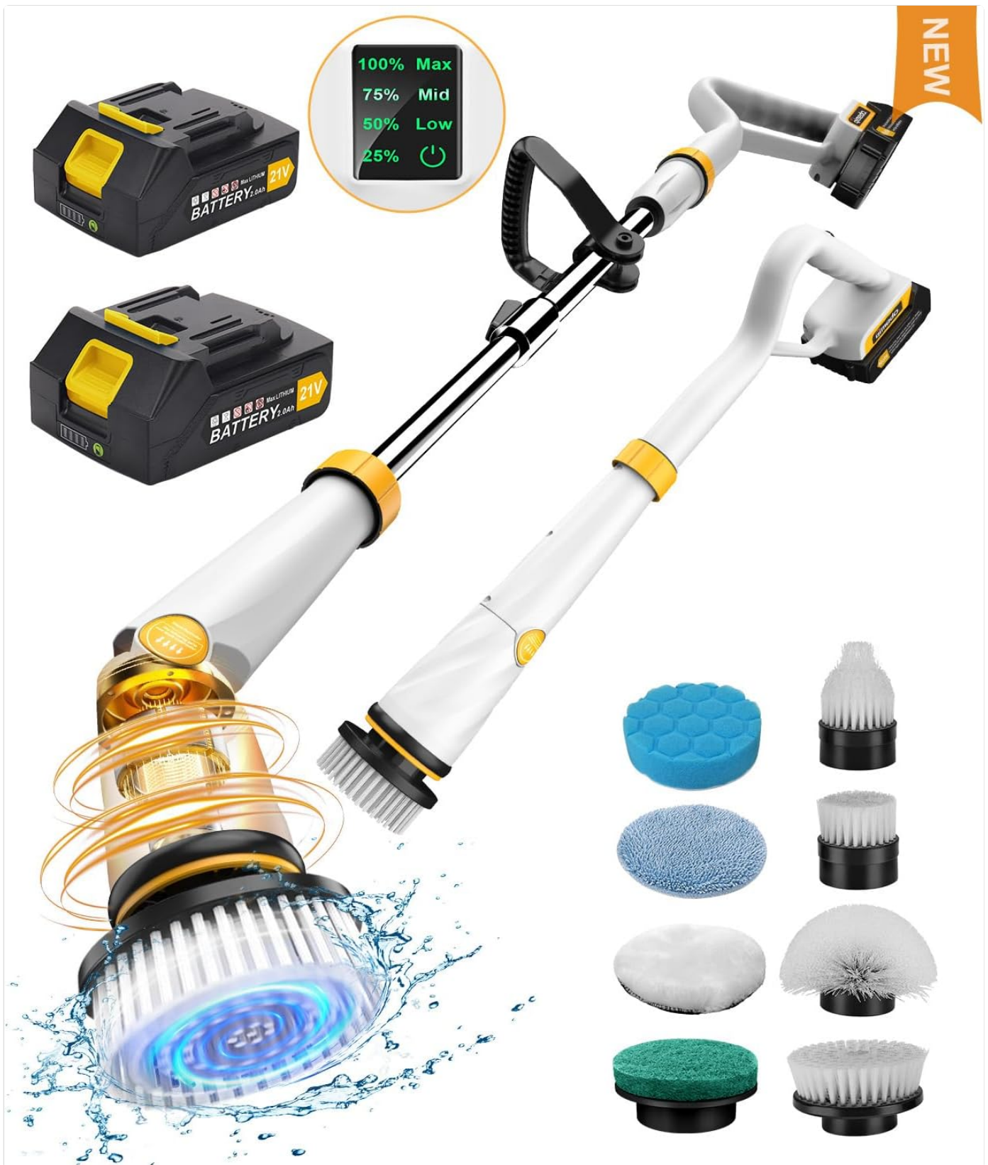
Image: An overhead view of the Qimedo Electric Spin Scrubber Q2 Pro, disassembled into its main components, alongside all the included brush heads and two batteries, illustrating the complete package contents.