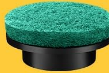
Scouring Brush for oily areas