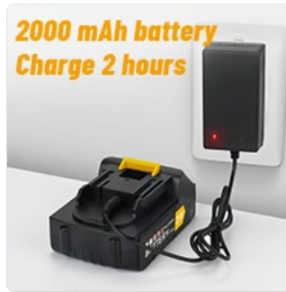
Image: A close-up of the 21V battery connected to its charger, which is plugged into a wall outlet. A red indicator light on the charger signifies that charging is in progress. Text indicates '2000 mAh battery' and 'Charge 2 hours'.