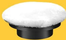
Wool-like Brush for car polishing