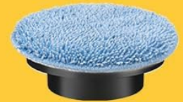
Big Cloth Brush for floor cleansing