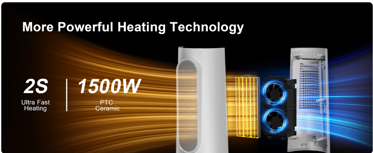
Image: Internal view of the CLEVAST Smart Space Heater showing 1500W PTC ceramic heating elements.