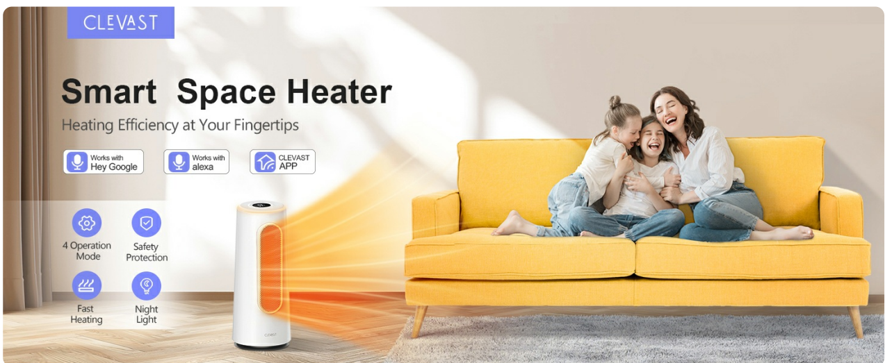
Image: A user interacting with the CLEAVAST Smart Space Heater using voice commands.