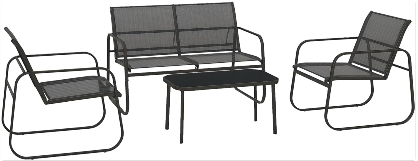
Image: The complete Outsunny 4-piece garden furniture set, including a two-seater sofa, two single chairs, and a coffee table.