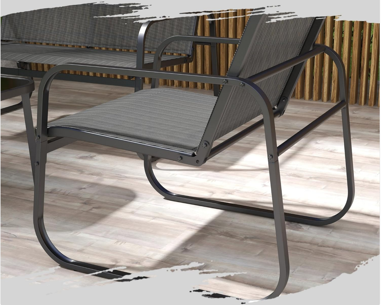
Image: A close-up view of the stable steel frame construction of the furniture, highlighting its durability.

Für den langfristigen Einsatz im Freien konzipiert