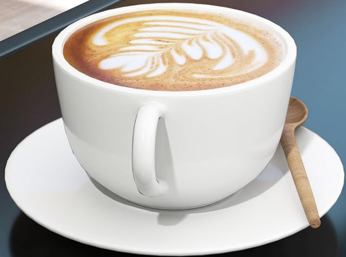
Image: A close-up of the coffee table's tempered glass top, showing a cup of coffee and highlighting its easy-to-clean surface.