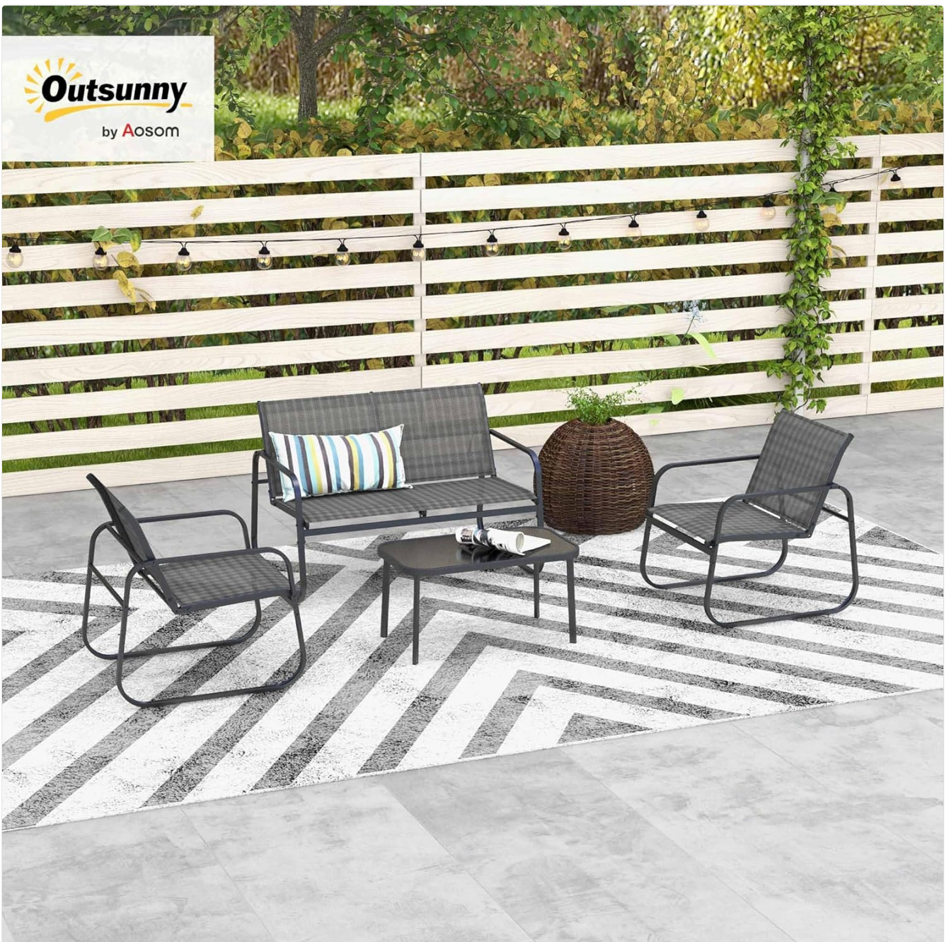
Image: The furniture set placed on a patio rug in a garden setting, demonstrating its aesthetic appeal in an outdoor environment.