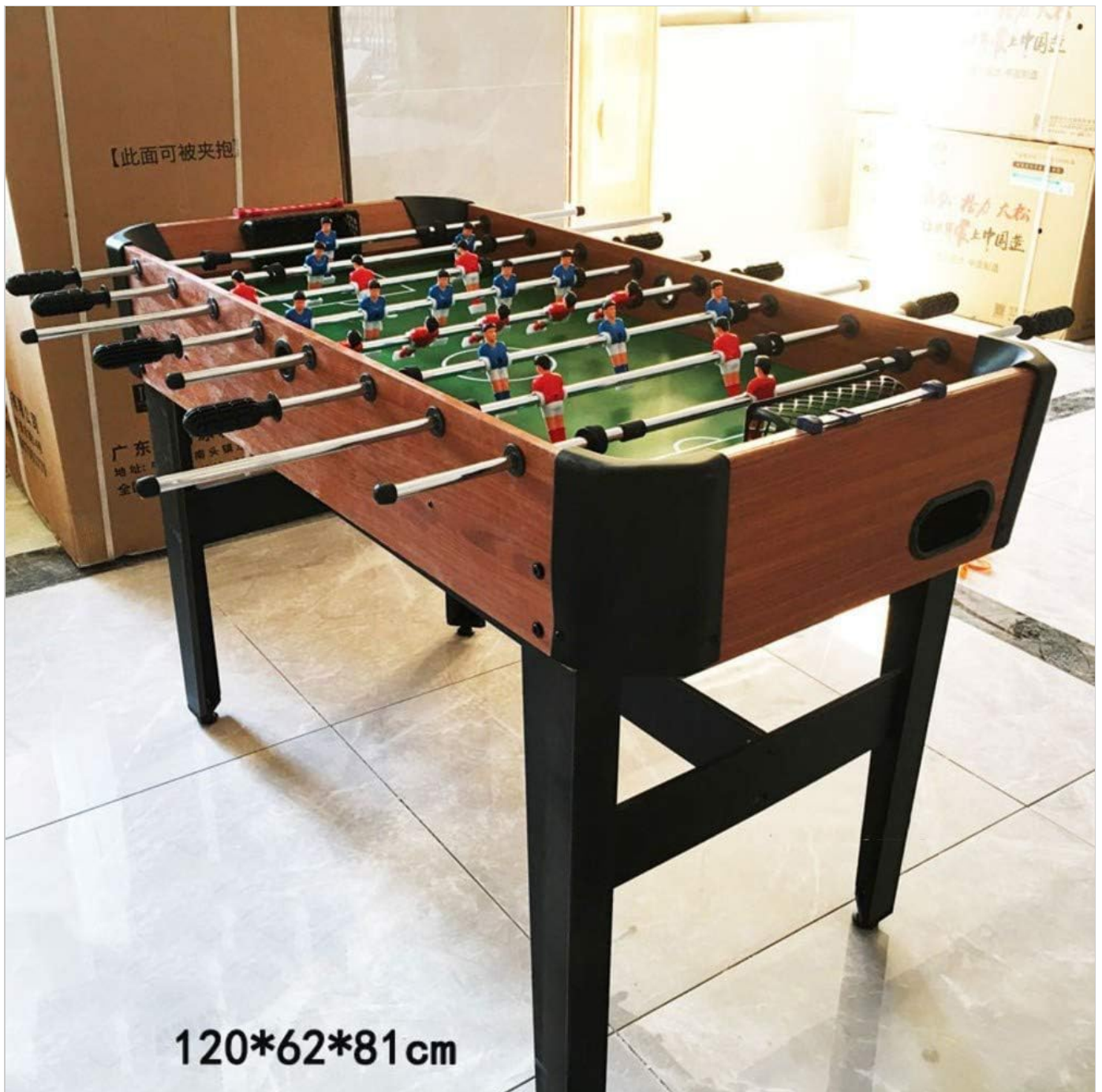
Image 2: A view of the foosball table, illustrating its overall structure and components before assembly.