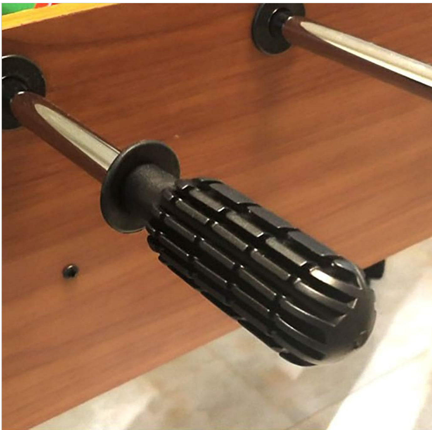
Image 4: Close-up of a foosball rod handle, showing its textured grip for player control.