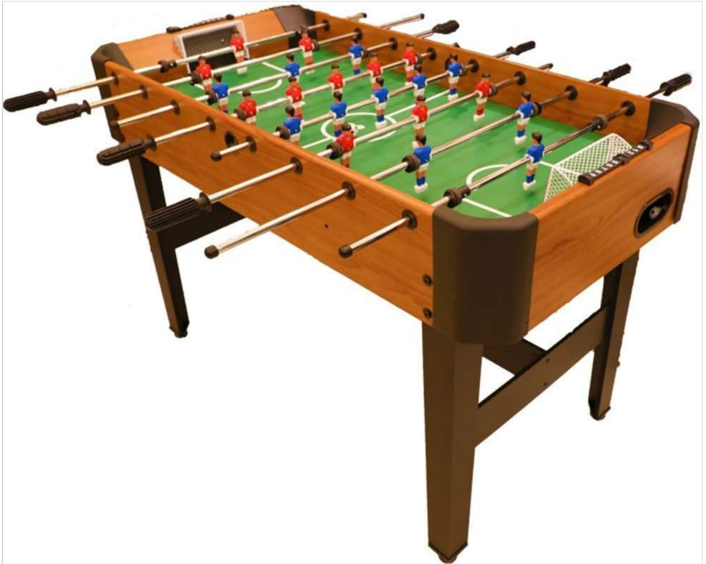
Image 1: Fully assembled foosball table, showing the playing surface, players, rods, and legs.