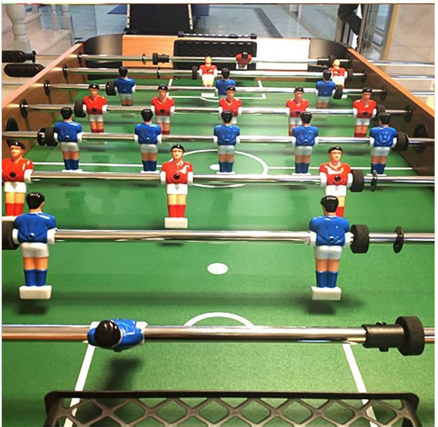
Image 3: Detailed view of the foosball players on the green playing surface, illustrating player arrangement and ball position.