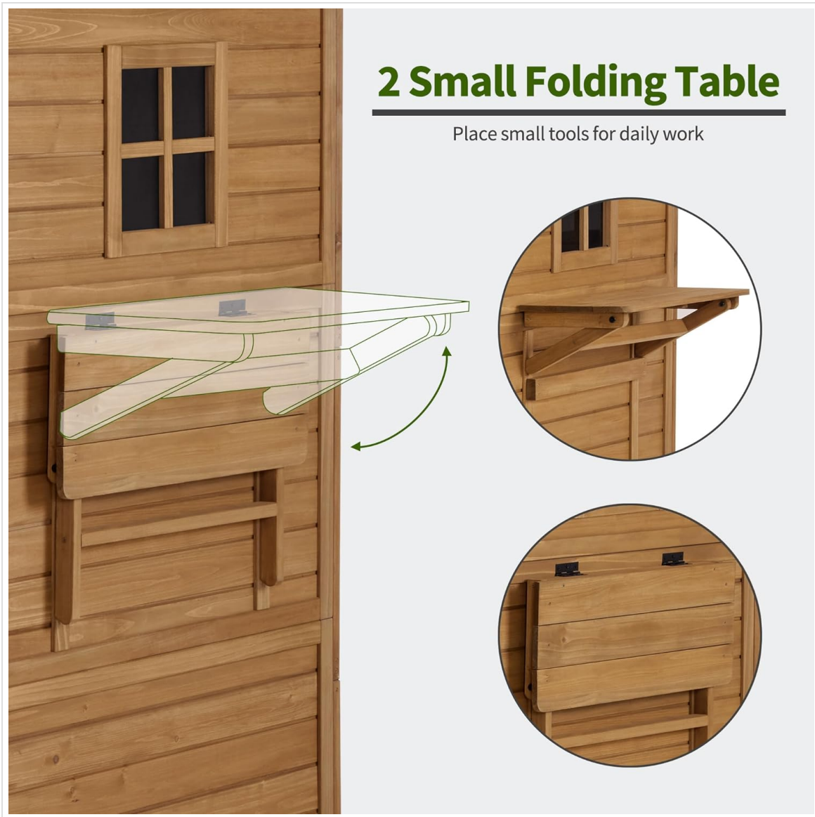
Figure 4: Two Small Folding Tables

This image illustrates the functionality of the two small folding tables, showing how they can be deployed for use and folded away when not needed.