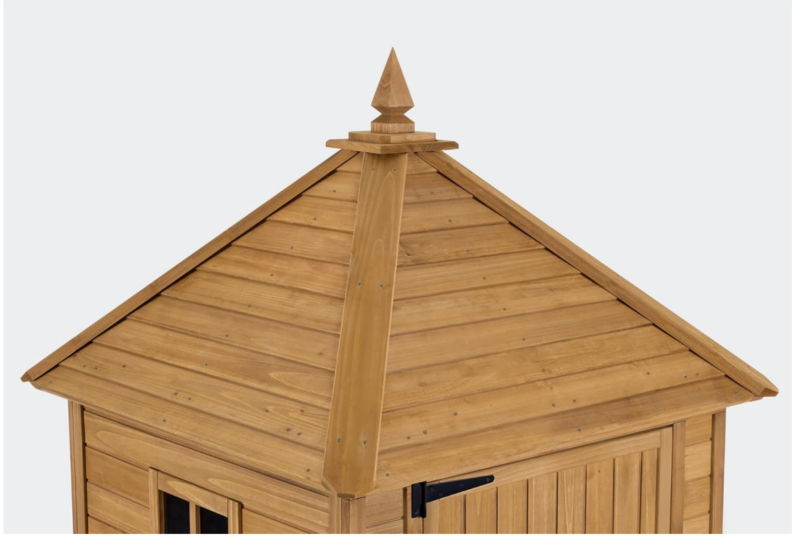
Figure 5: Pyramid Hip Roof

This image highlights the pyramid hip roof, designed to shed water and snow effectively, offering protection against the elements.