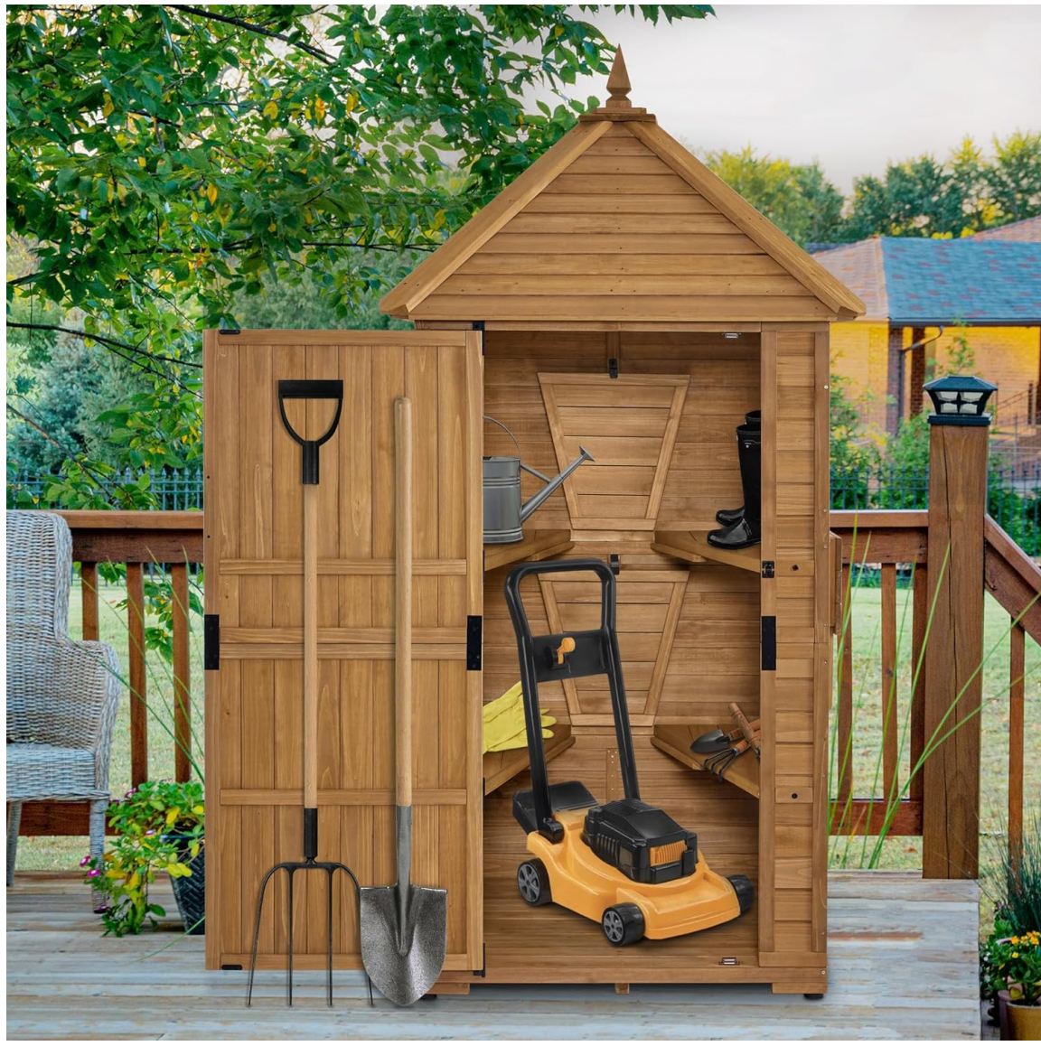
Figure 6: Cabinet in Use

This image provides an example of the cabinet's capacity, showing various garden tools and equipment stored efficiently within its compartments.