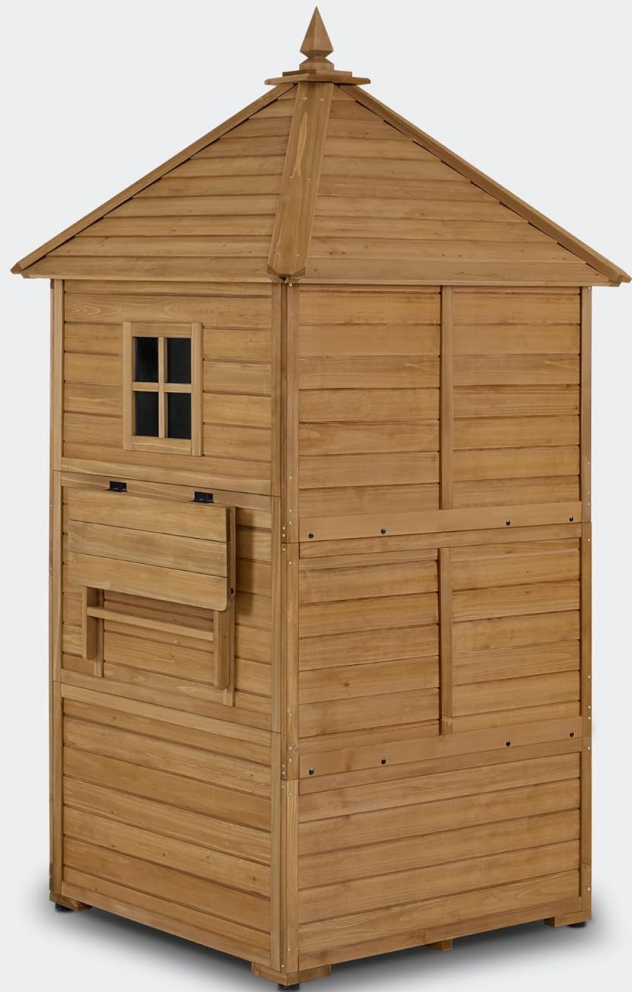
Figure 7: Solid Fir Wood Detail

This image provides a close-up of the solid fir wood, emphasizing its quality and polished finish, which benefits from proper maintenance.