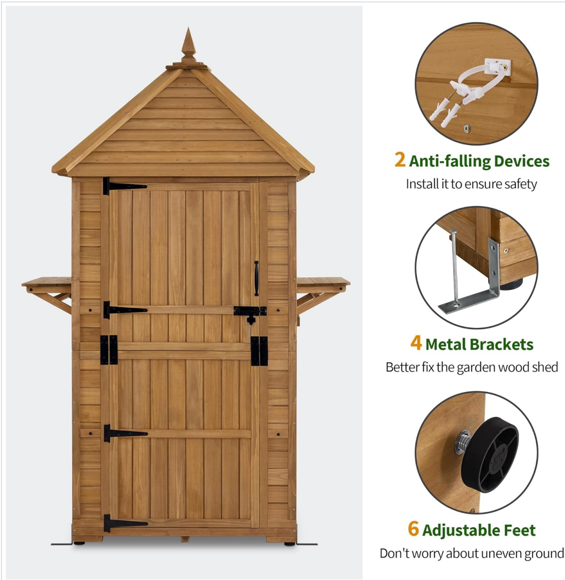
Figure 2: Stability Components (Anti-falling Devices, Metal Brackets, Adjustable Feet)

This image details the anti-falling devices, metal brackets, and adjustable feet, which are crucial for the cabinet's stability and safety. Ensure these are correctly installed as per the assembly guide.