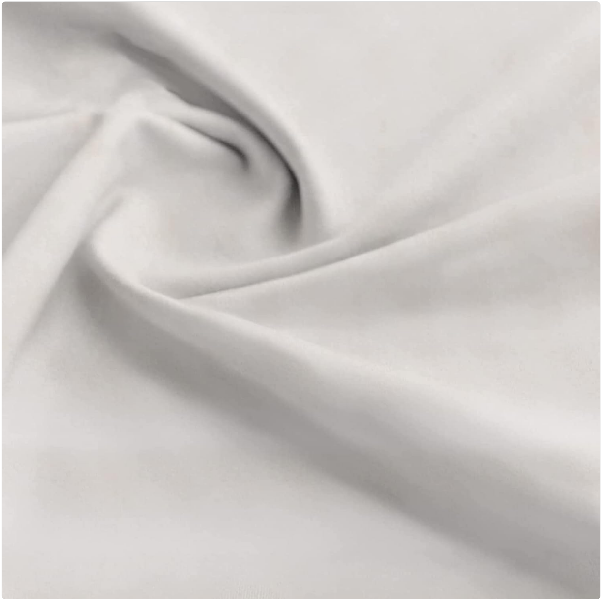
Figure 7.1: A close-up view of the velvet fabric, illustrating its soft texture. This material requires gentle cleaning.