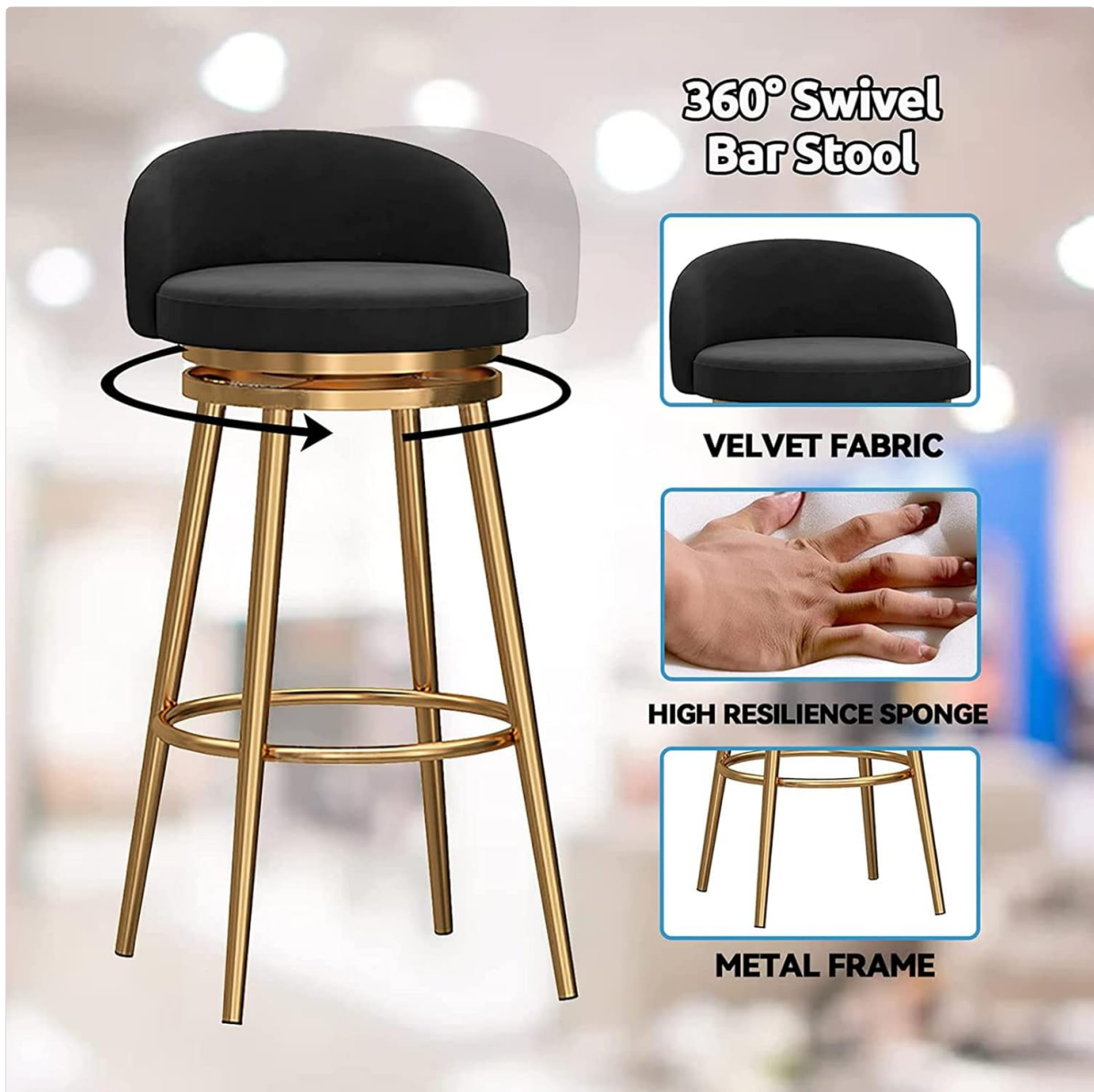
Figure 2.2: Illustration highlighting key features: 360-degree swivel capability, soft velvet fabric, high-resilience sponge cushioning, and a sturdy metal frame.