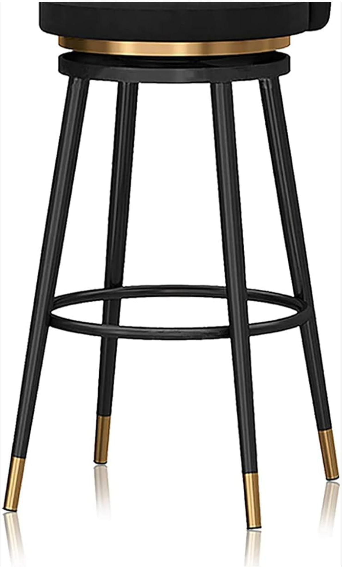
Figure 2.1: The ZJXDPBF Velvet Swivel Bar Stool in black, showcasing its design with a curved backrest, cushioned seat, and metal legs with a footrest ring.