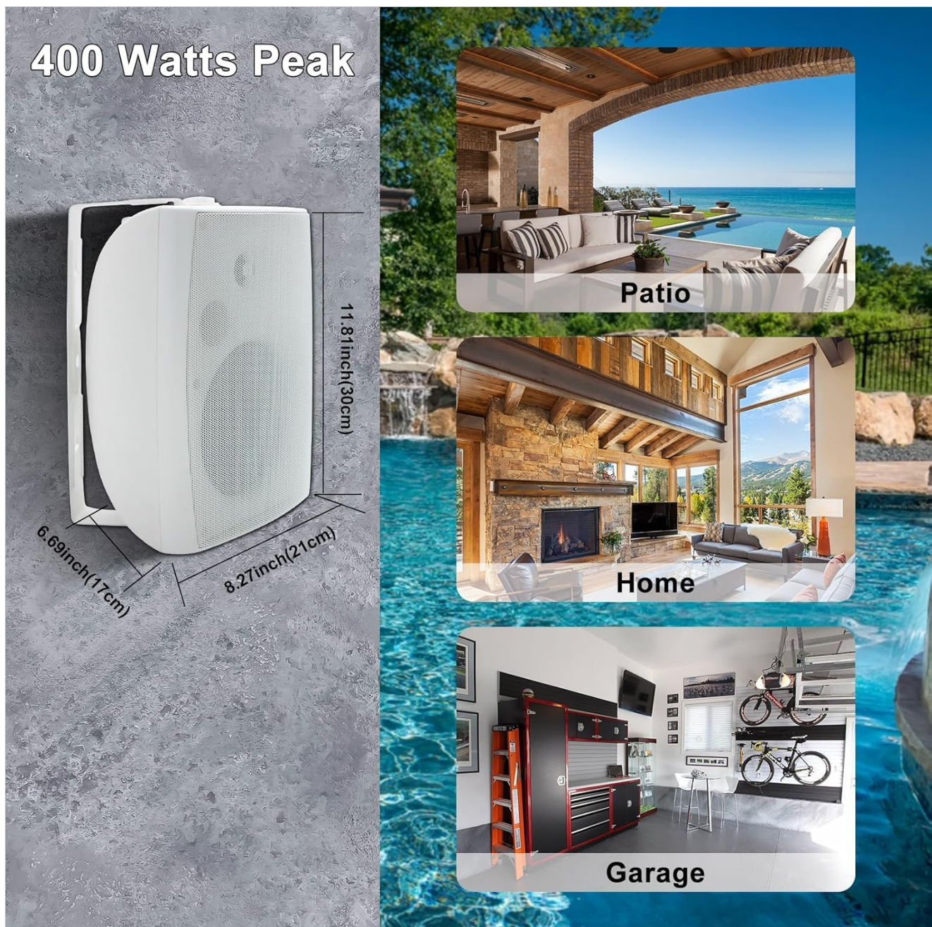
Image 3.2: Speaker dimensions and suggested installation locations.