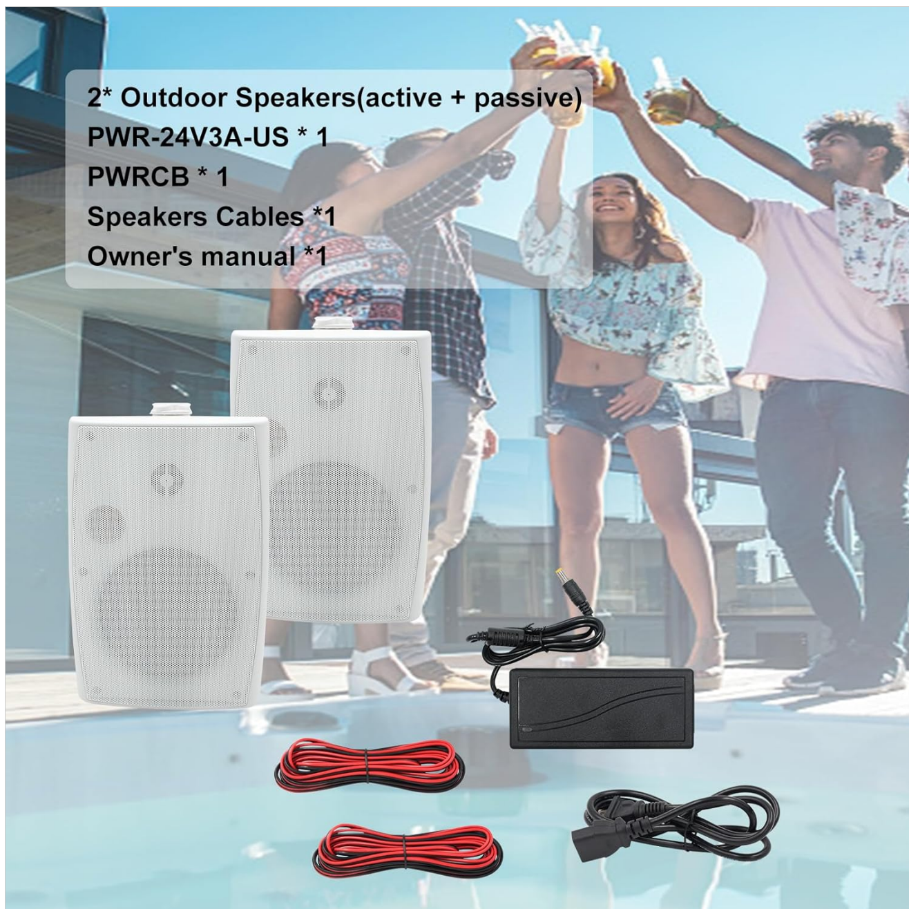
Image 2.1: Package contents including two speakers, power adapter, speaker cable, and owner's manual.