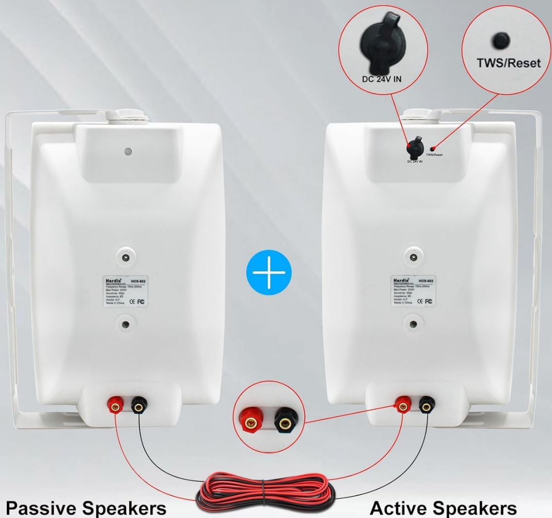
Image 3.3: Wiring diagram for connecting active and passive speakers and power.

Connect the speakers together to double the sound power