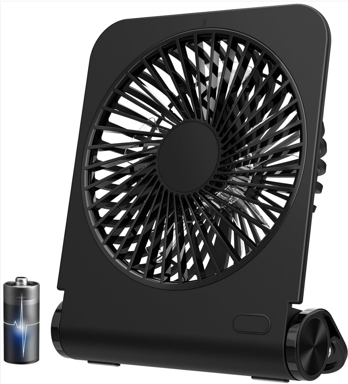
Figure 1: EasyAcc N602 Small Desk Fan