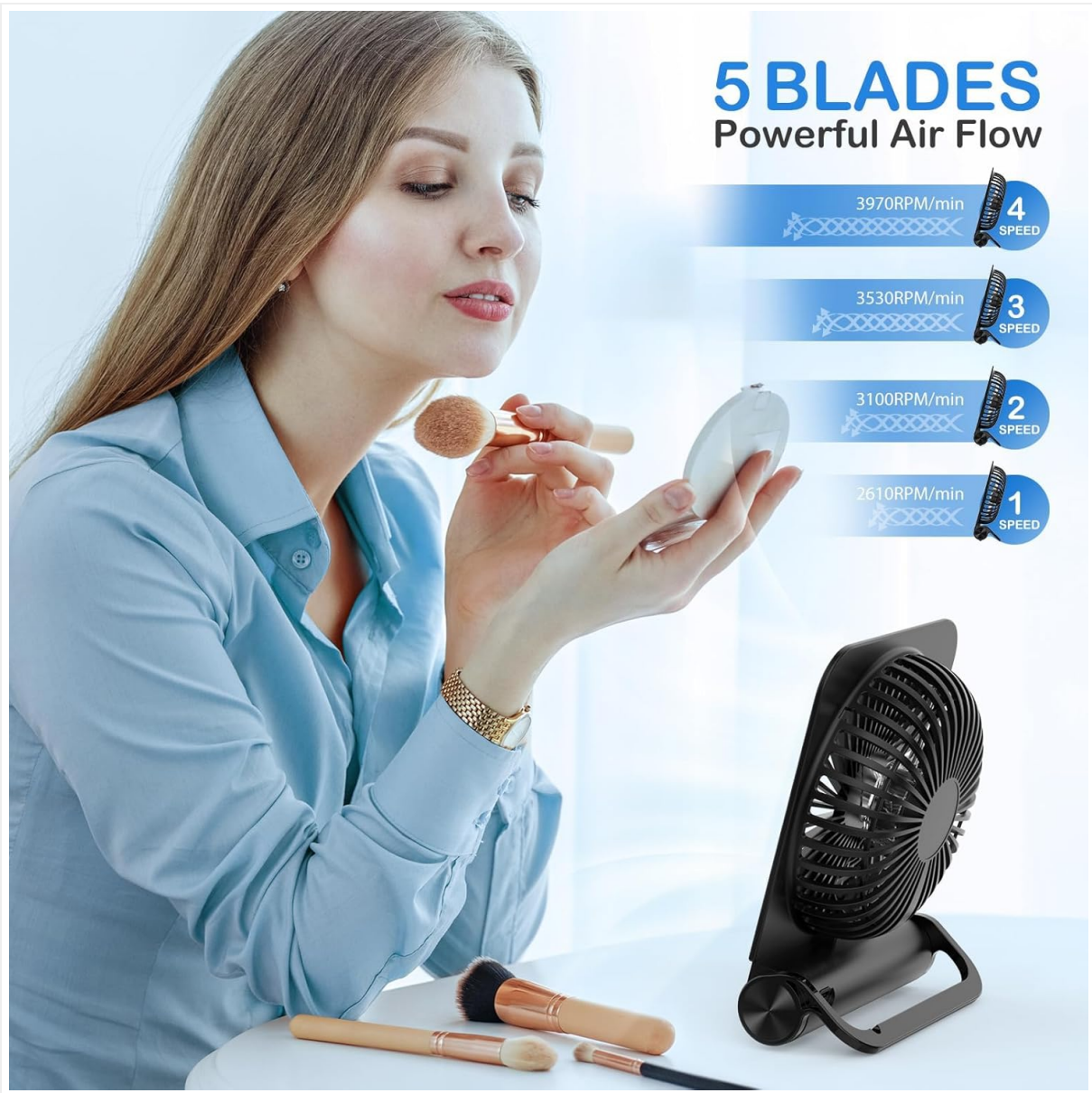
Figure 4: Fan Blades and Speed Indicators