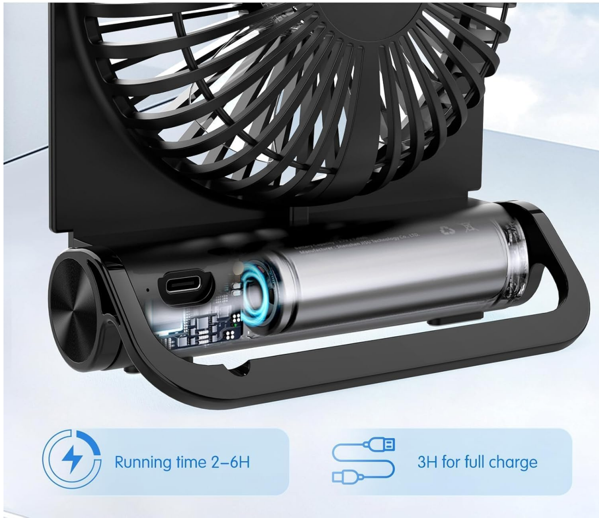
Figure 2: USB-C Charging Port and Battery Life Indication