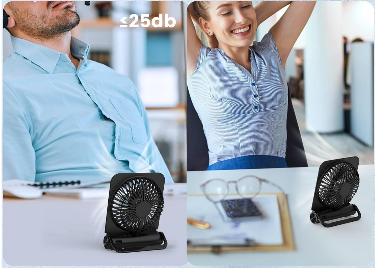
Figure 5: Quiet Operation of the EasyAcc N602 Fan at 25dB