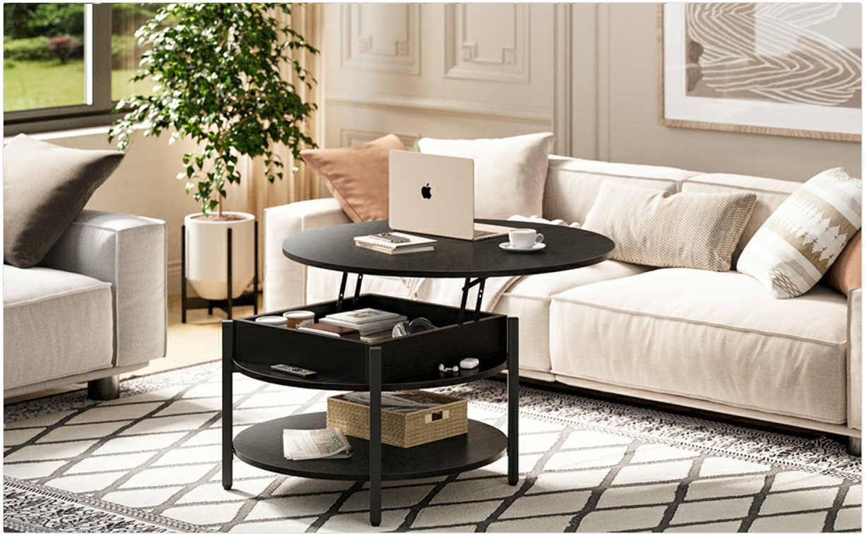
Figure 3: Storage Features (Double Layer, Hidden Space, Open Shelf)