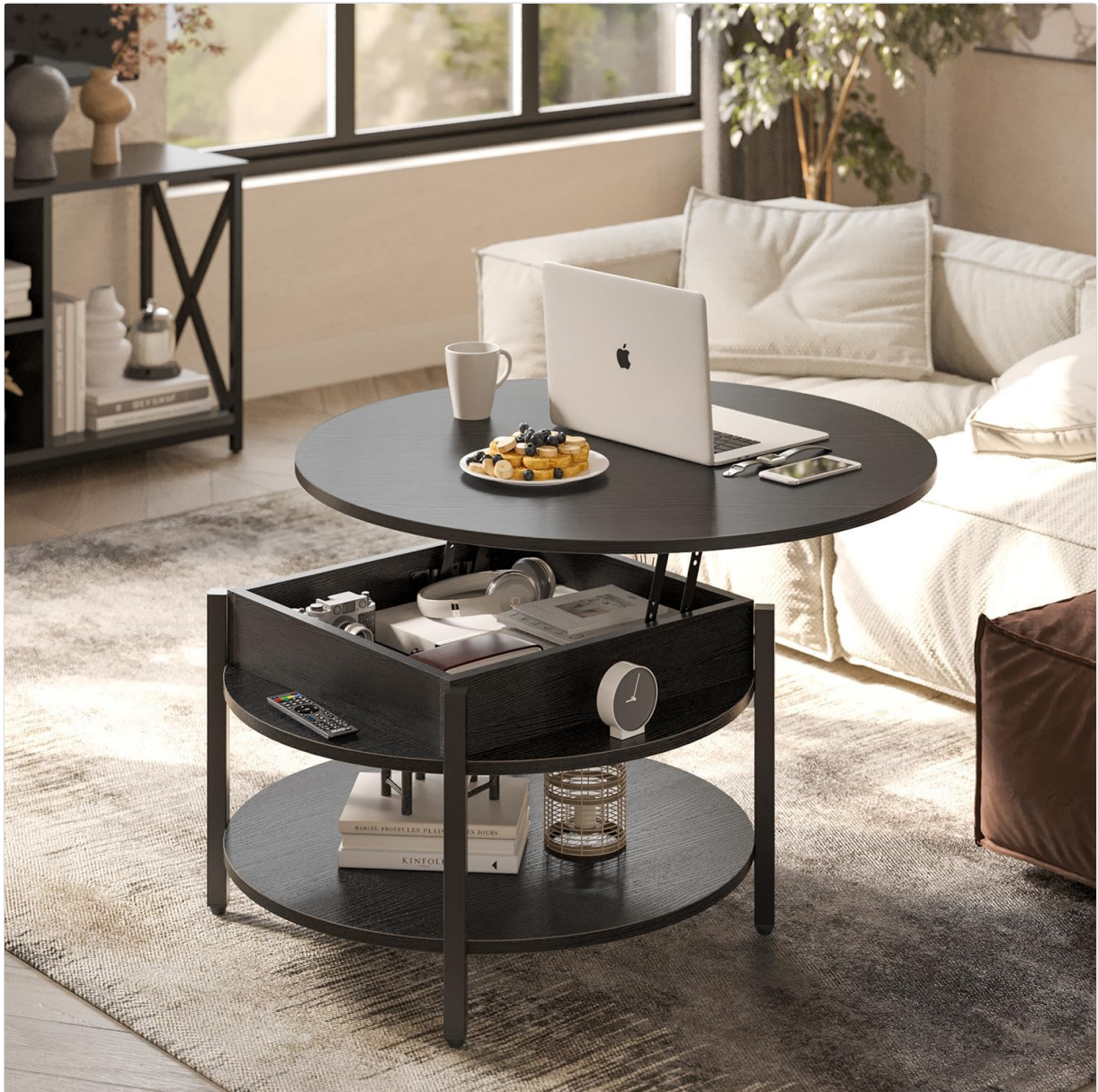
Figure 2: Lift-Top in Raised Position

push the tabletop down until it rests in its original position. Ensure hands are clear of the mechanism during operation.