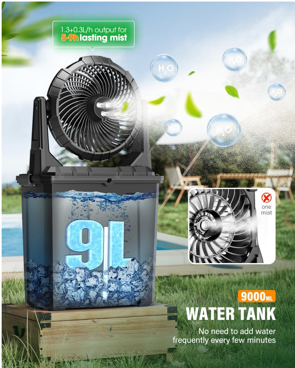
Figure 1: Assembled Ausic 9L Bucket Portable Misting Fan. Shows the fan unit mounted on top of the large black water bucket.