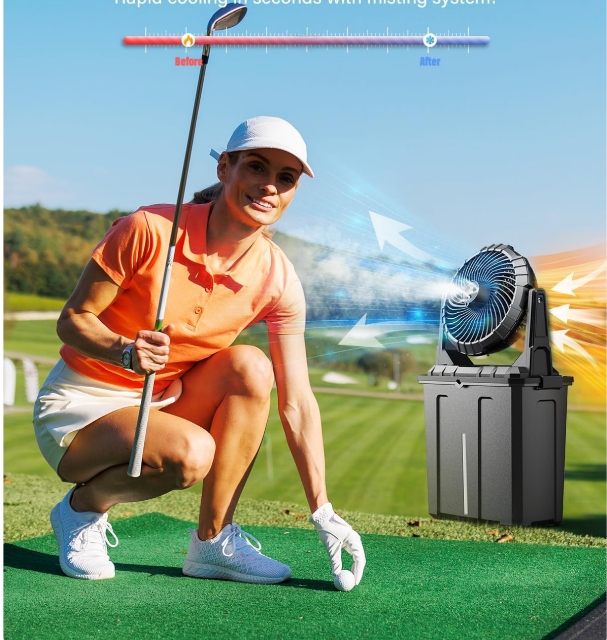
Figure 3: The Ausic Misting Fan actively producing a fine mist, illustrating its cooling capability.

An Portable Air Cooler Rapid cooling in seconds with misting system!