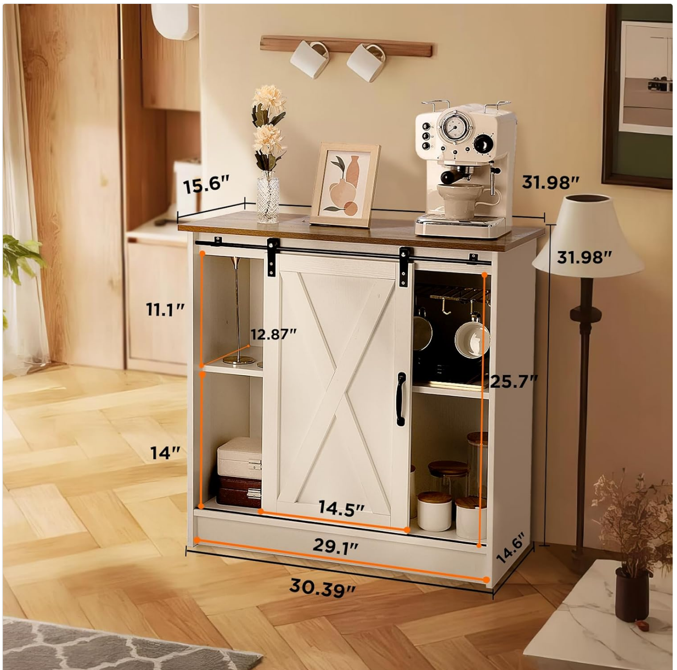
Figure 3.2: Detailed dimensions of the cabinet, illustrating the ample storage space available.