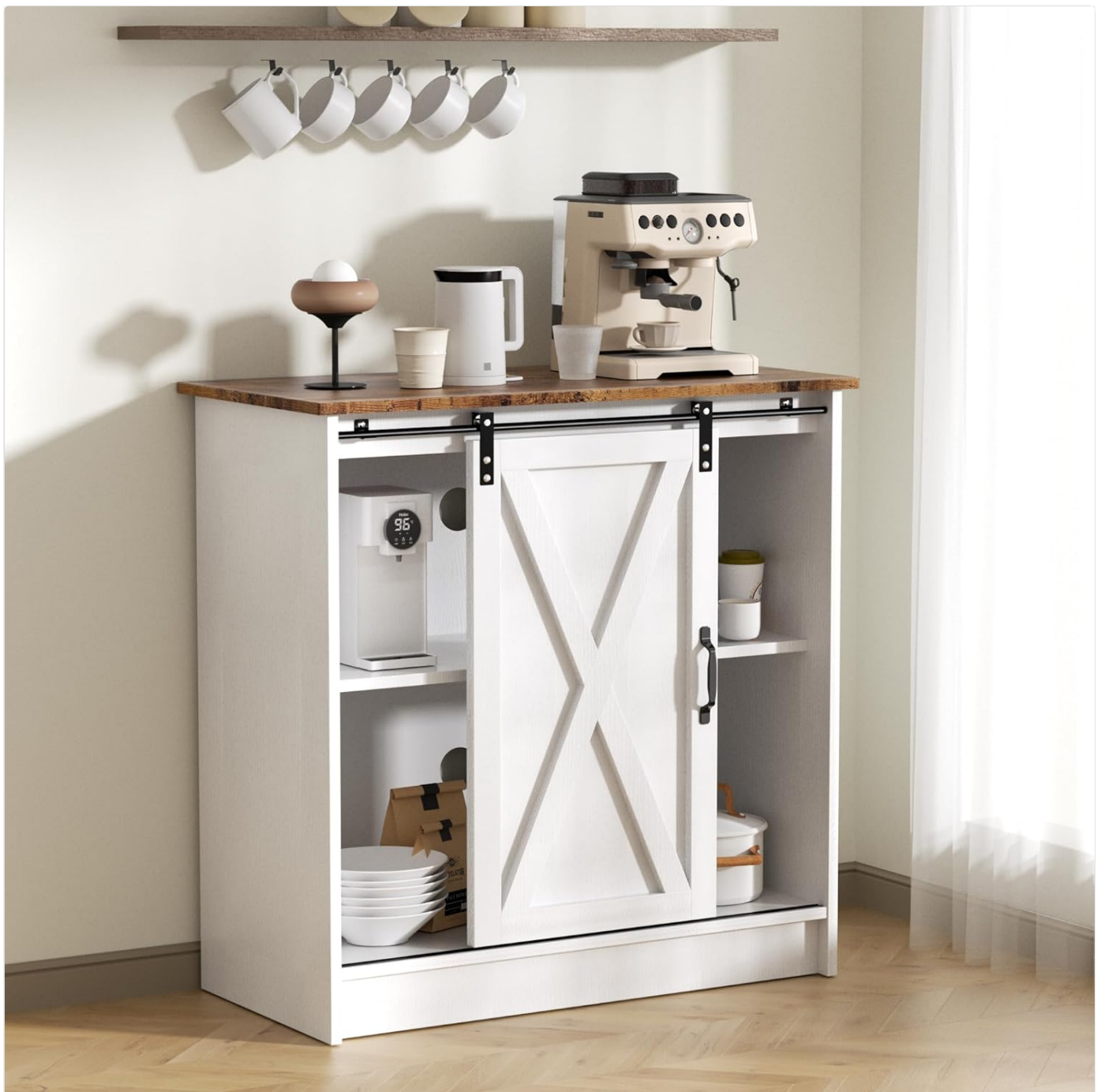
Figure 1.1: The COSYSUPER White Coffee Bar Cabinet, showcasing its farmhouse design and functional storage.