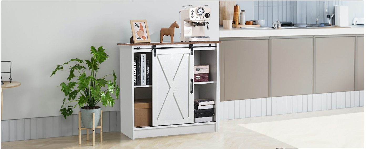
Figure 3.1: Demonstration of the smooth sliding barn door mechanism, allowing easy access to stored items.

The cabinet features a smooth-gliding barn door that allows you to conceal or reveal different sections of the storage area. Simply grasp the metal handle and slide the door horizontally along the top rail to access the desired compartment. This design allows for a semi-open storage area, providing flexibility in display and concealment.