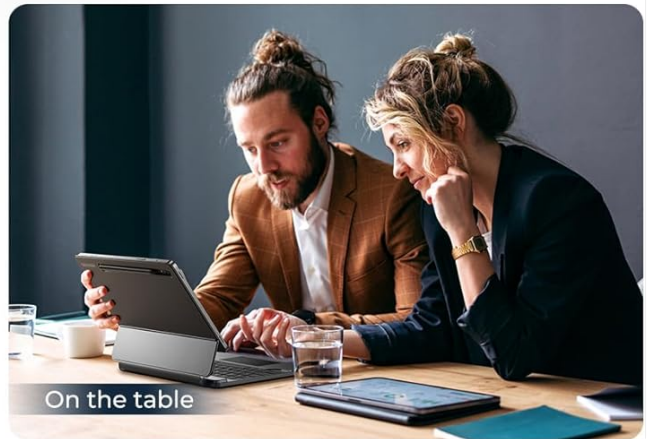
On the table

Image: The keyboard case with a tablet attached, demonstrating the magnetic floating cantilever stand at a 125-degree angle, suitable for lap or table use.