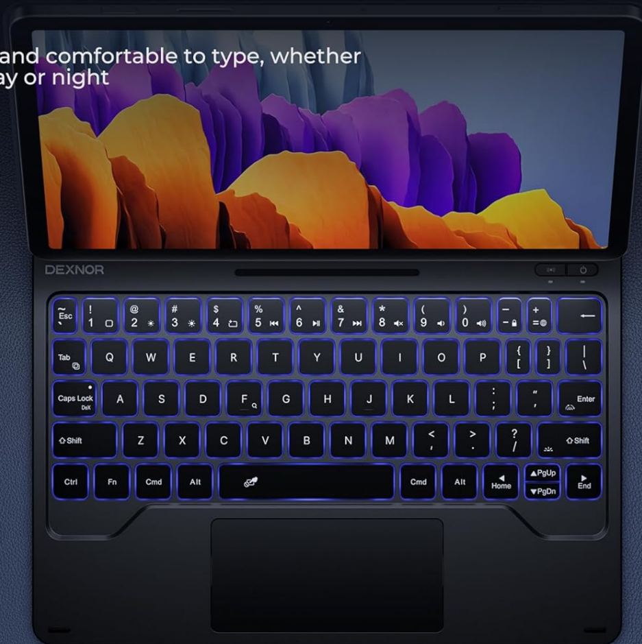
Image: The keyboard illuminated with a blue backlight, demonstrating the 7 available color options and adjustable brightness levels.

Easy and comfortable to type, whether it's day or night