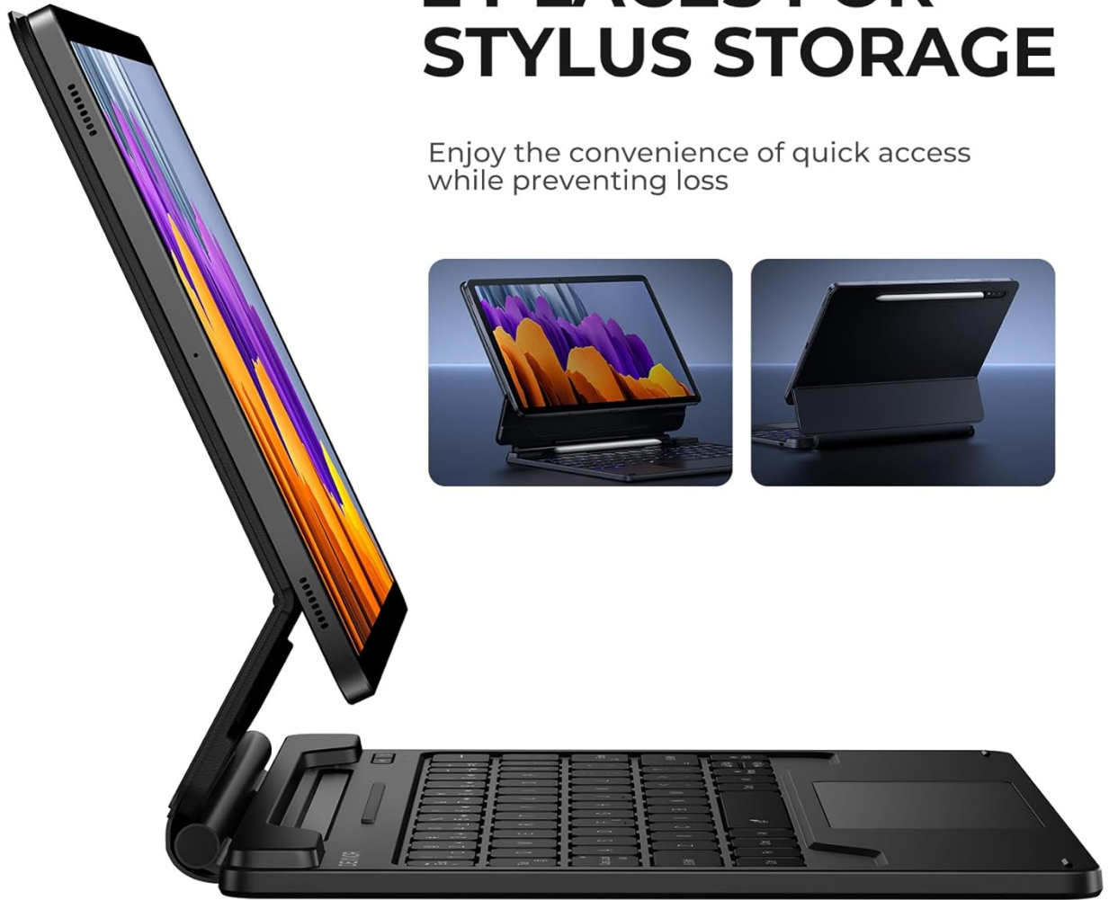
Image: A side view of the keyboard case showing the tablet attached, with an S Pen stored in the integrated holder on the keyboard base, and another view showing the S Pen charging slot on the back of the tablet case.

Enjoy the convenience of quick access while preventing loss