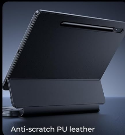
Anti-scratch PU leather