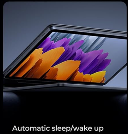
Automatic sleep/wake up

Image: Close-up of the keyboard's multi-touch trackpad, highlighting its responsive surface and illuminated logo.