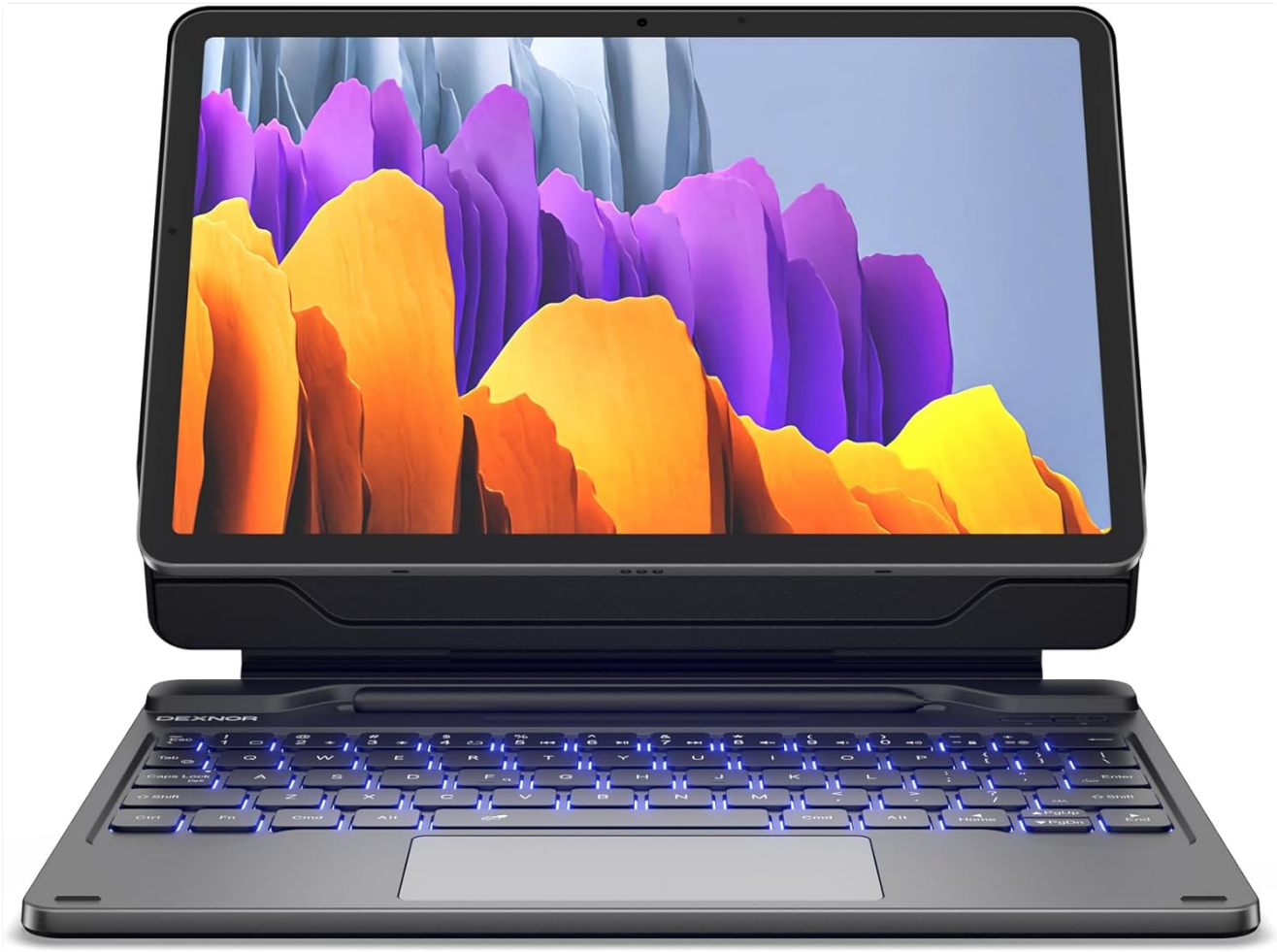
Image: Dexnor Keyboard Case with a Samsung Galaxy Tab, showcasing the keyboard and tablet in an open, laptop-like configuration.

This manual provides detailed instructions for the setup, operation, maintenance, and troubleshooting of your Dexnor Keyboard Case. Designed for enhanced productivity and protection, this keyboard case transforms your Samsung Galaxy tablet into a versatile laptop-like device.