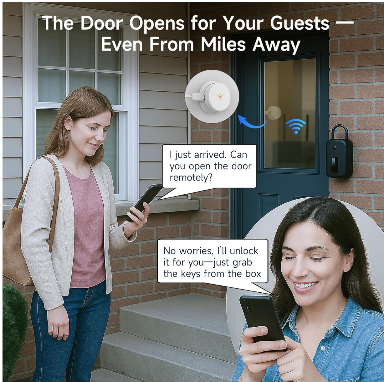
Image: The WeHere system enables remote door unlocking for guests, allowing access from miles away via the app.