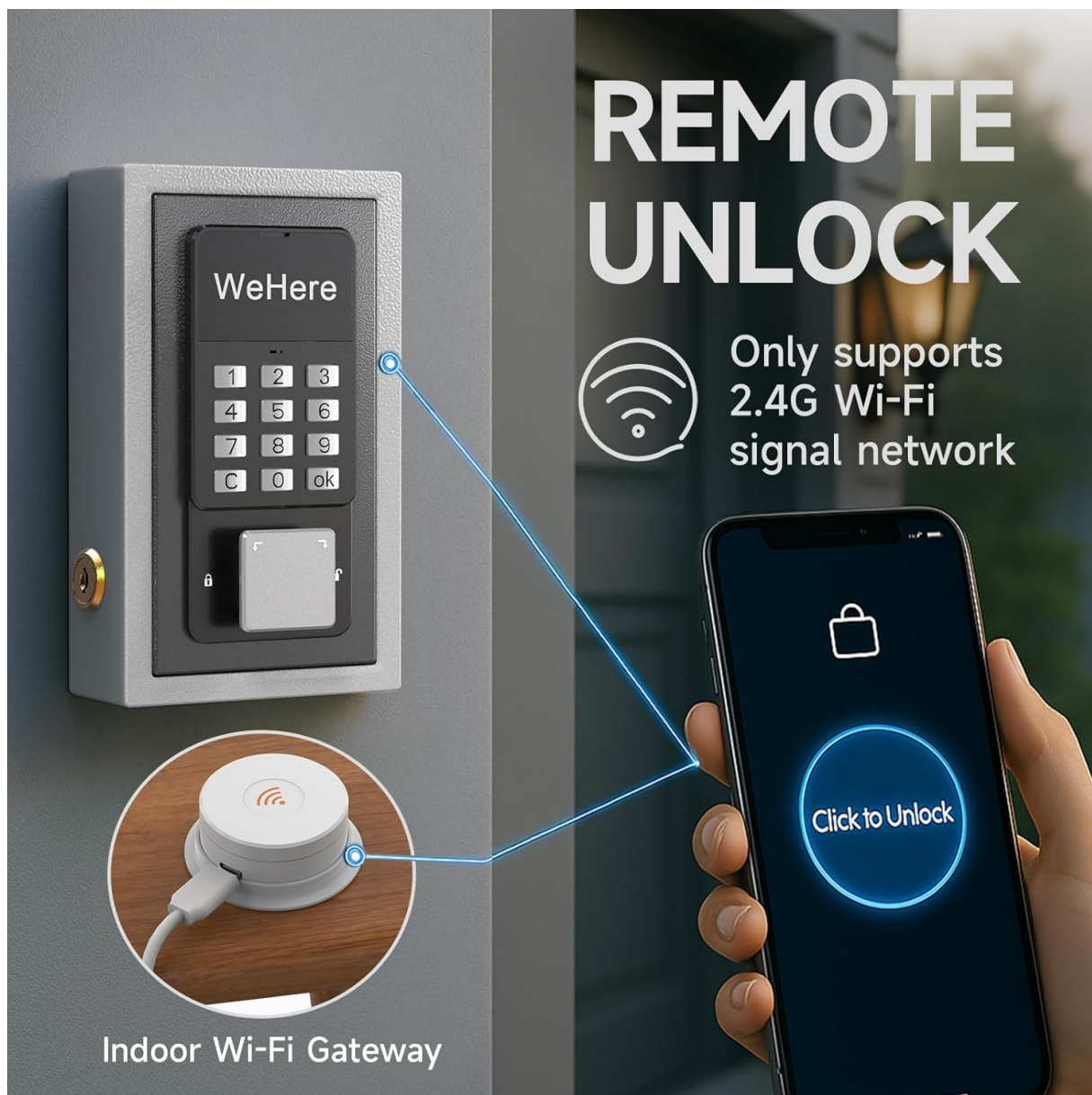
Image: The WeHere W100 Wi-Fi Bridge facilitates remote unlocking of smart lockboxes via the WeHere app, requiring a 2.4G Wi-Fi signal.