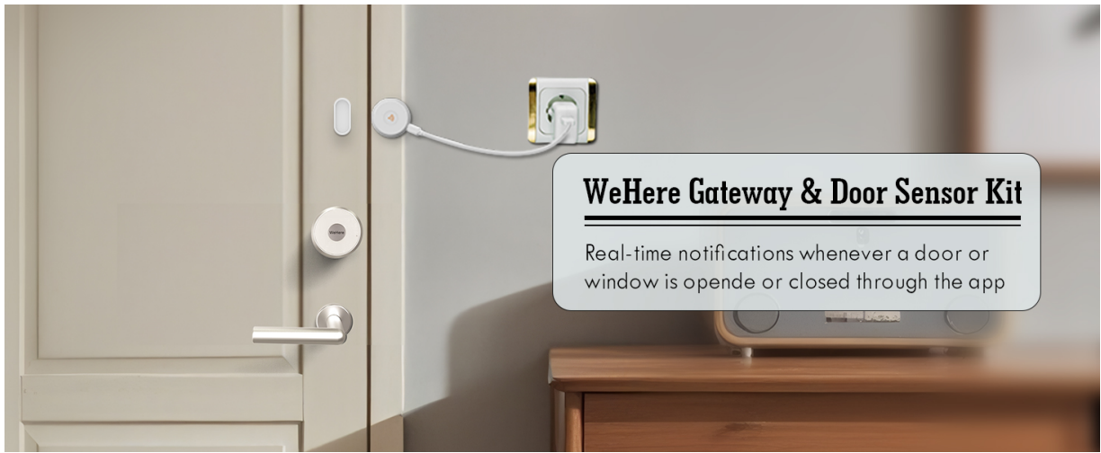
Image: The WeHere Gateway and Door Sensor Kit installed on a door, providing real-time notifications when the door is opened or closed.