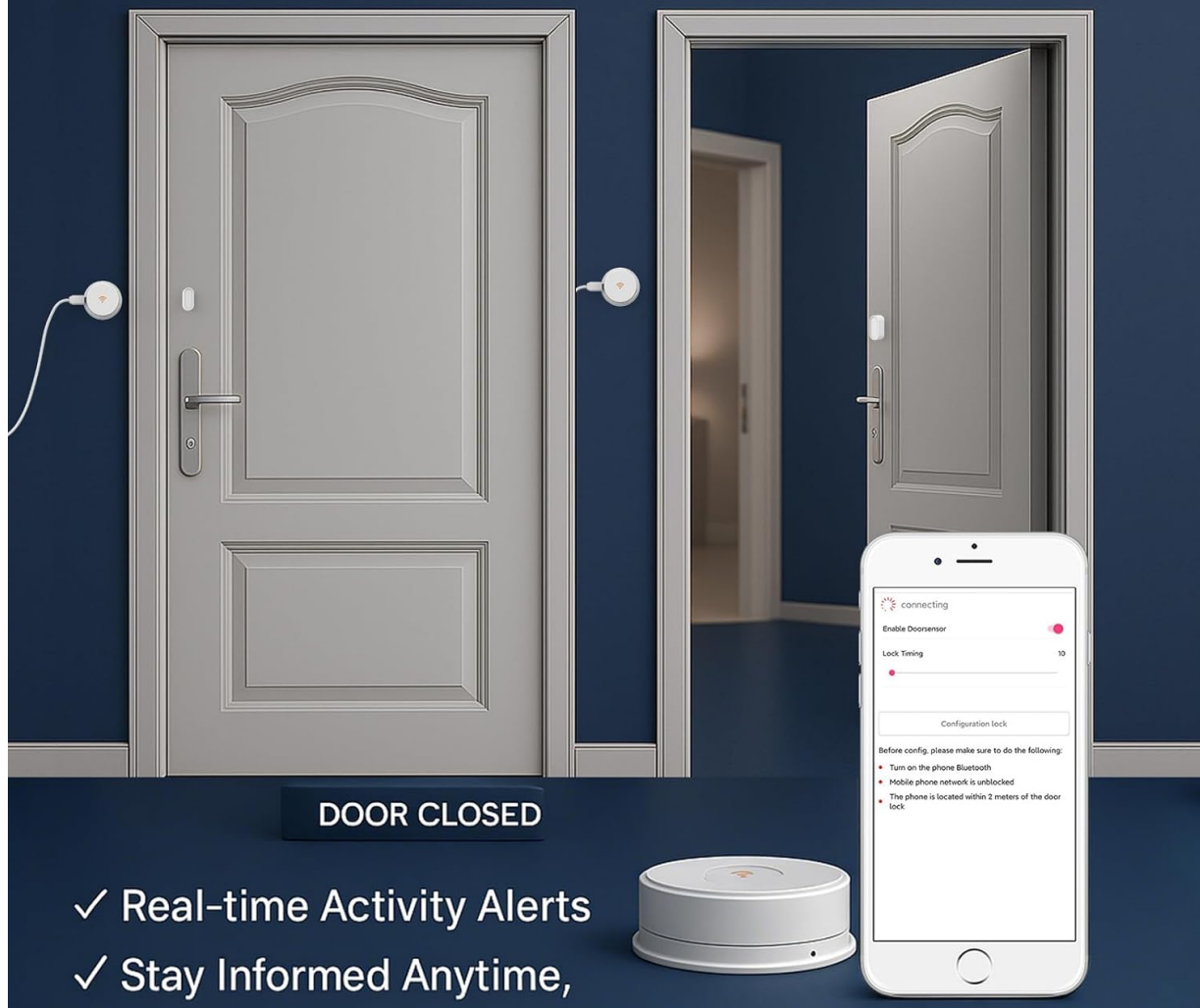
Image: The WeHere system provides auto-lock and app alerts, ensuring total door security with real-time activity notifications.

Receive real-time open/close notifications and let the system lock the door for