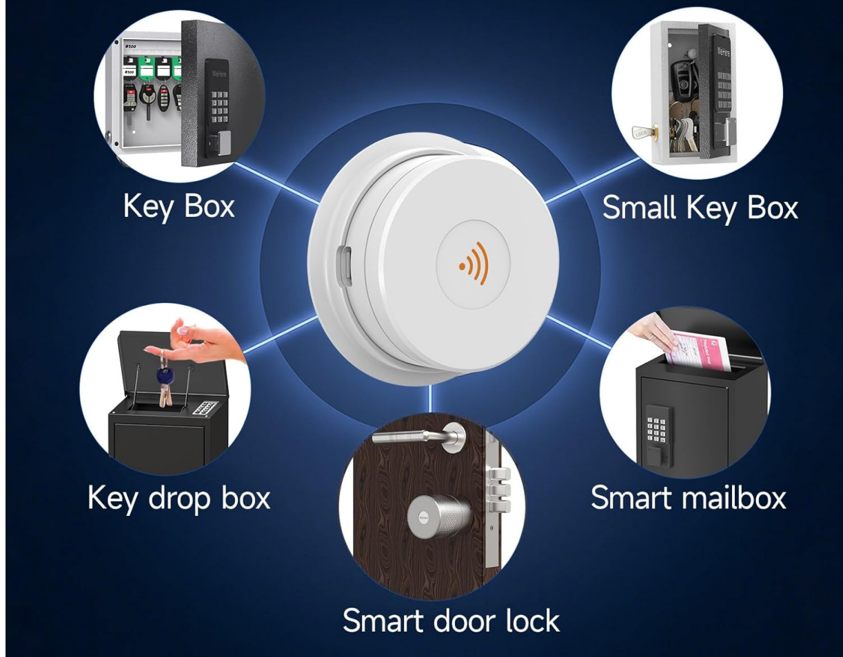
Image: The WeHere W100 Wi-Fi Bridge serves as a central gateway for multiple smart devices, including key boxes, smart mailboxes, and smart door locks, enabling unified control.