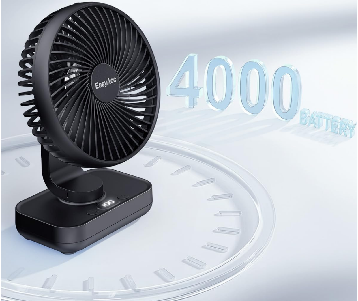
Image: Product dimensions and LED display details.