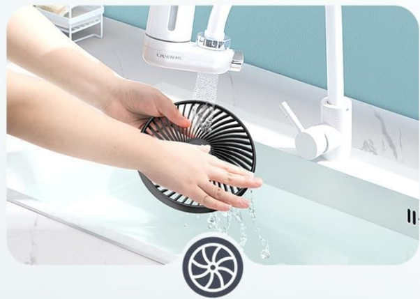
Image: Steps for cleaning the fan's removable front cover and blades.