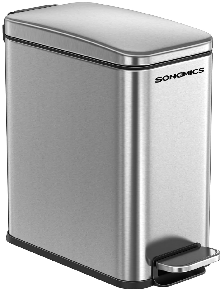
Image: The complete SONGMICS 2.6 Gallon Bathroom Trash Can, showing the stainless steel exterior and pedal mechanism.