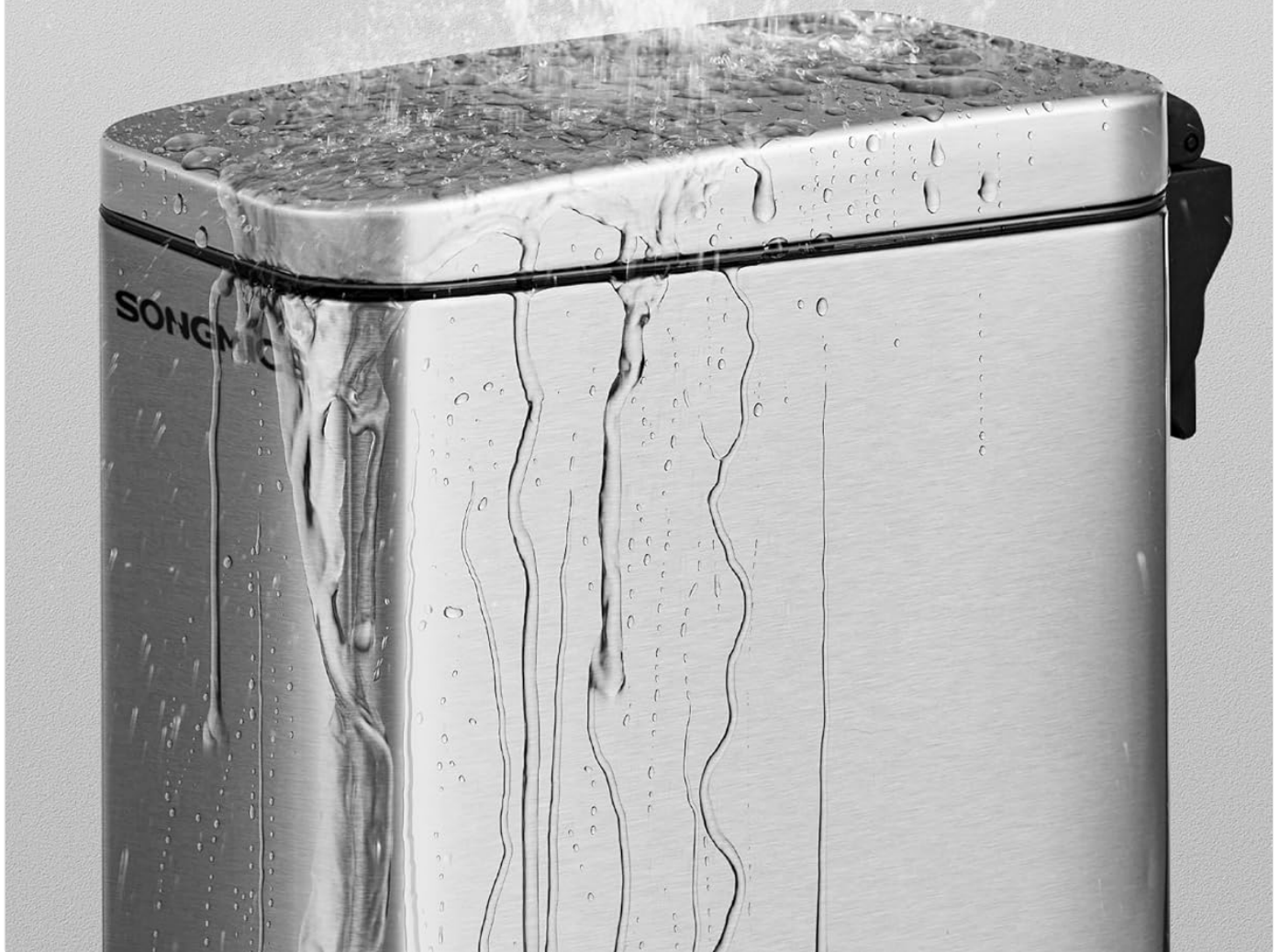
Image: A visual representation of the trash can's resistance to water and rust, highlighting its suitability for damp environments.