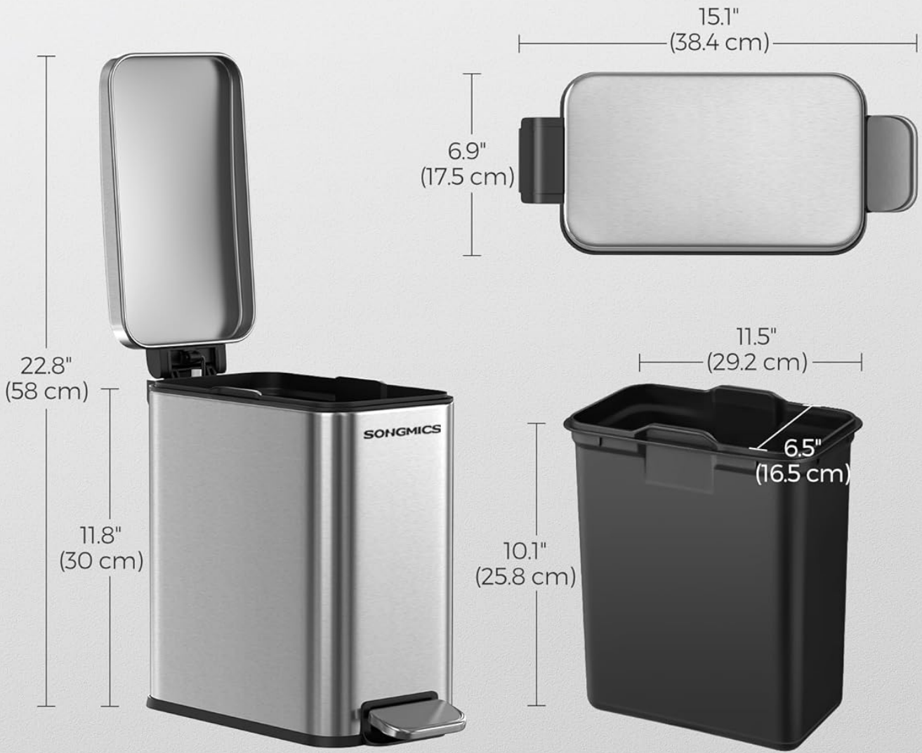
Image: A technical diagram illustrating the precise dimensions of the trash can and its inner bucket, including height, width, and depth measurements.