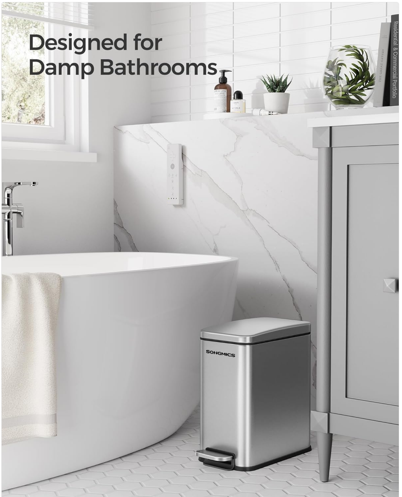
Image: The trash can placed in a bathroom, illustrating its design for use in damp environments.