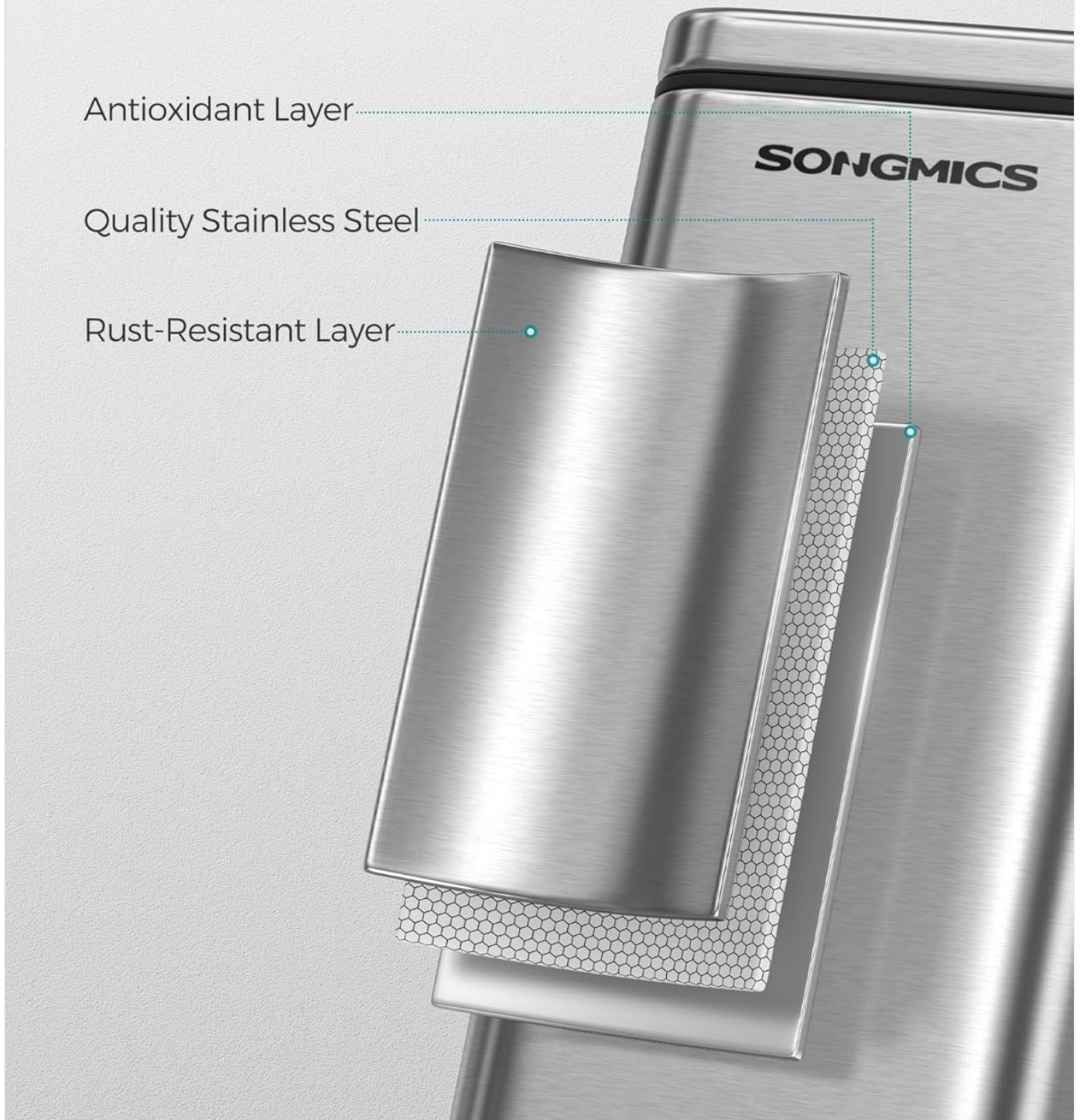
Image: A cutaway view highlighting the multi-layered construction of the stainless steel, including antioxidant and rust-resistant layers, ensuring durability.