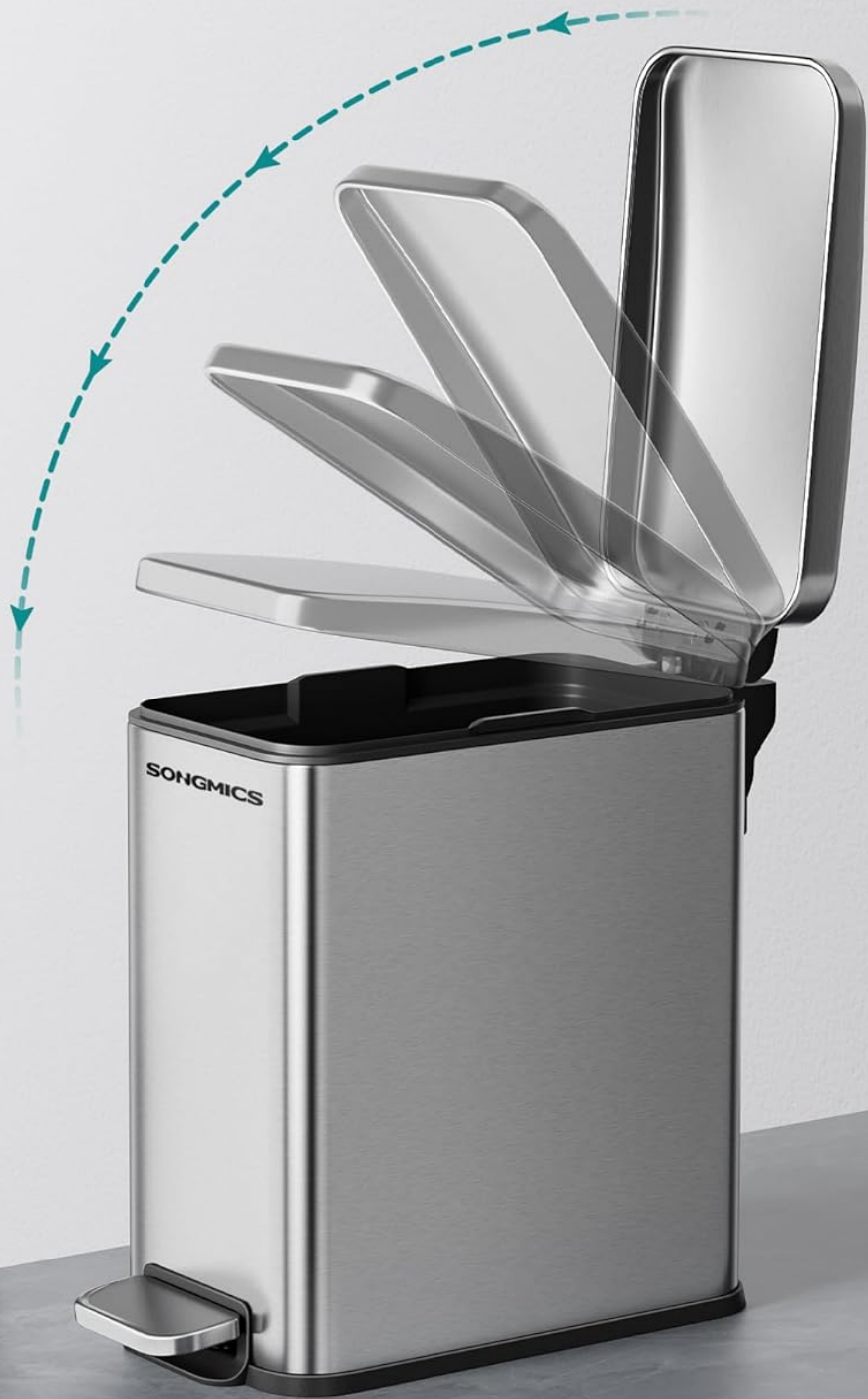
Image: An illustration demonstrating the soft-close mechanism and how to engage the 90-degree stay-open feature of the lid.