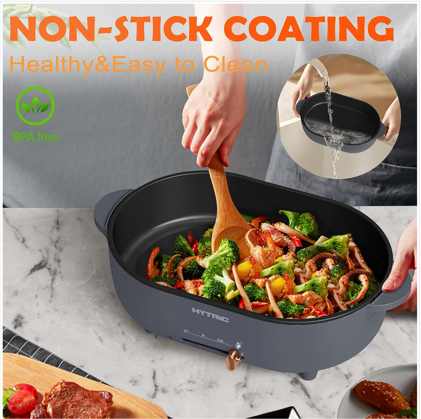
Figure 2.3: The 3.5L (110 oz) capacity is suitable for 1-5 people.