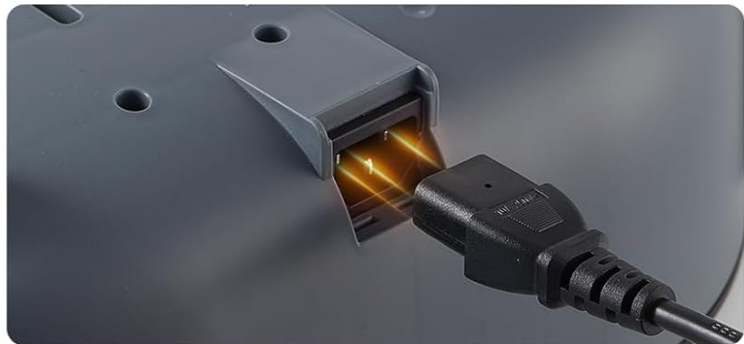
Figure 2.6: Integrated safety features include overheating and dry-burn protection.