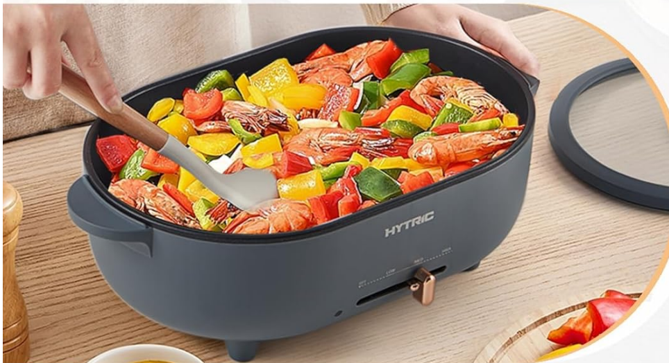
Figure 2.4: The non-stick coating ensures healthy cooking and easy cleanup.