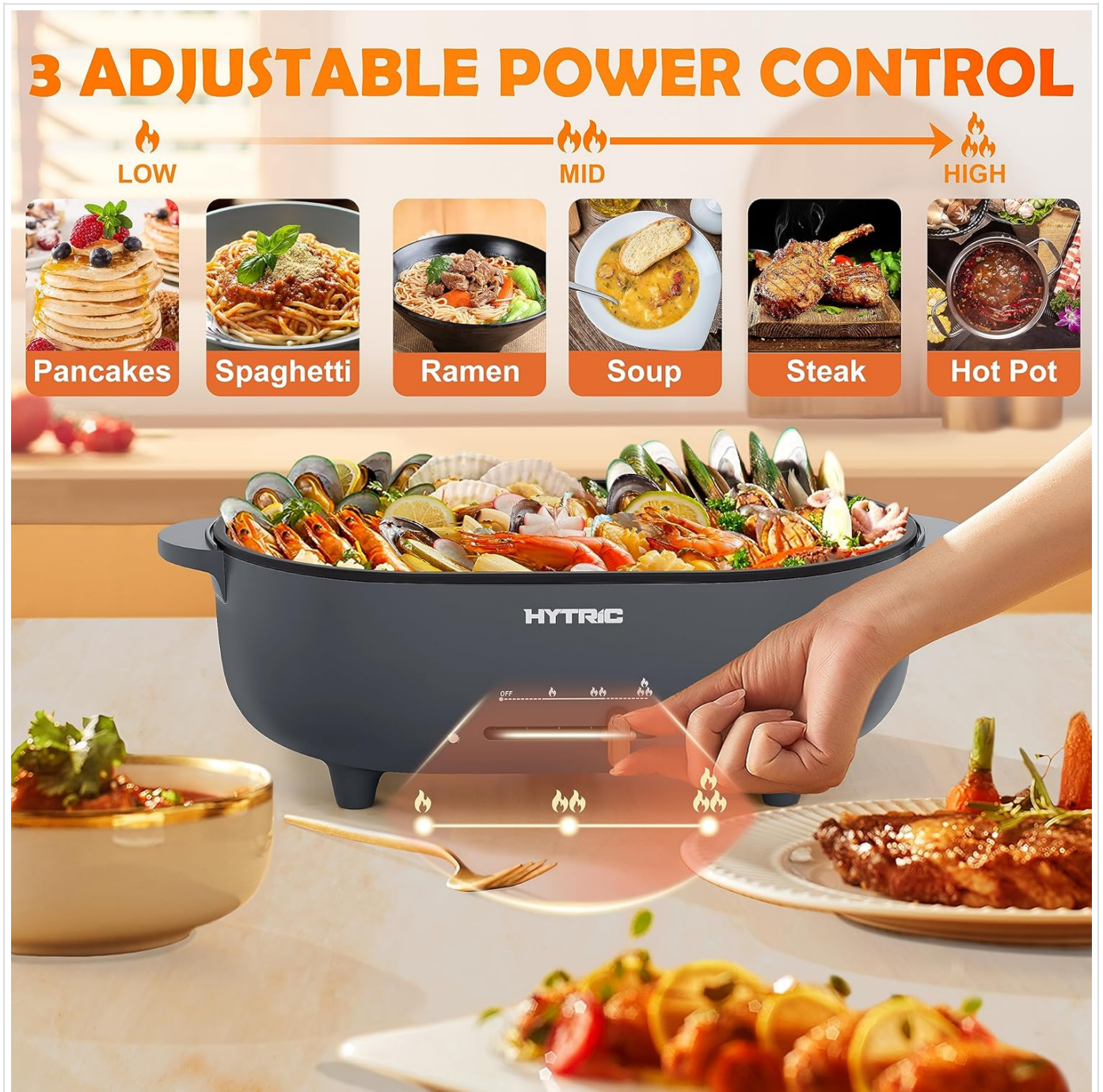
Figure 2.1: Overview of the HYTRIC A3503C Electric Hot Pot.