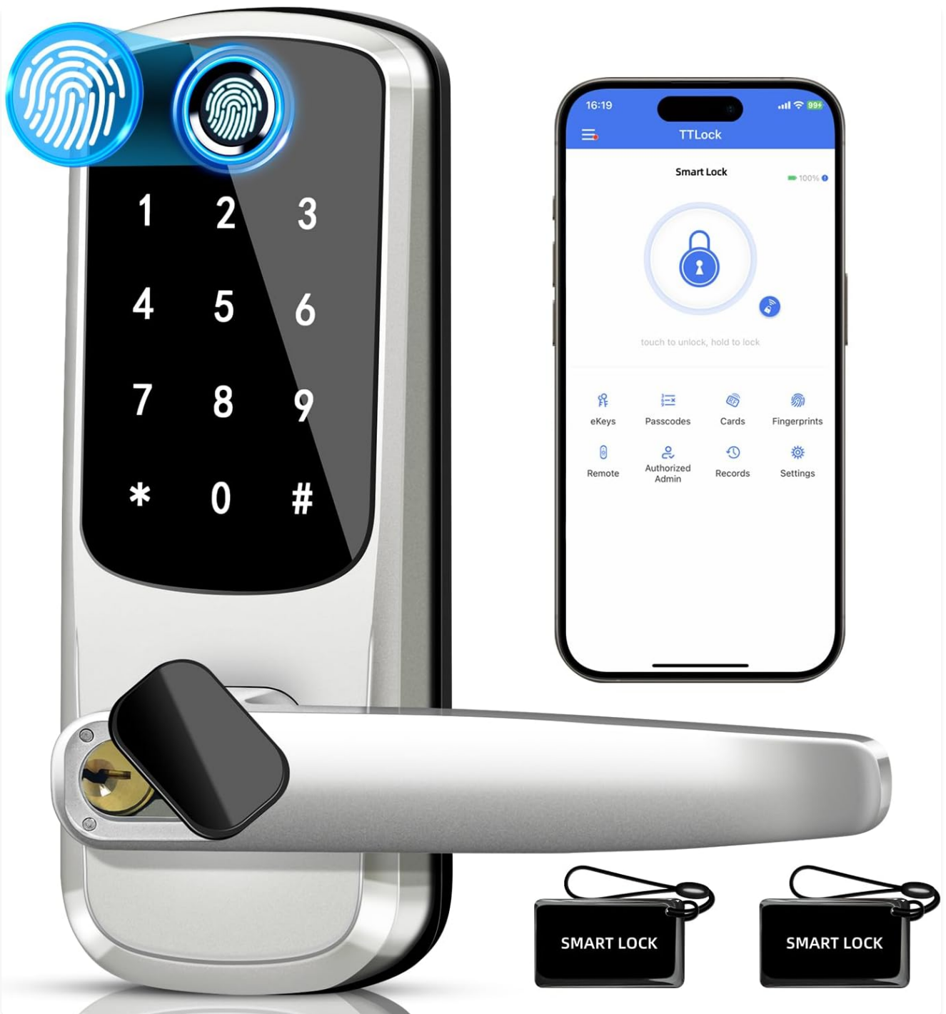
Figure 1: Overview of the MSR X6 Smart Door Lock, showing the keypad, fingerprint sensor, handle, and the associated mobile application interface.