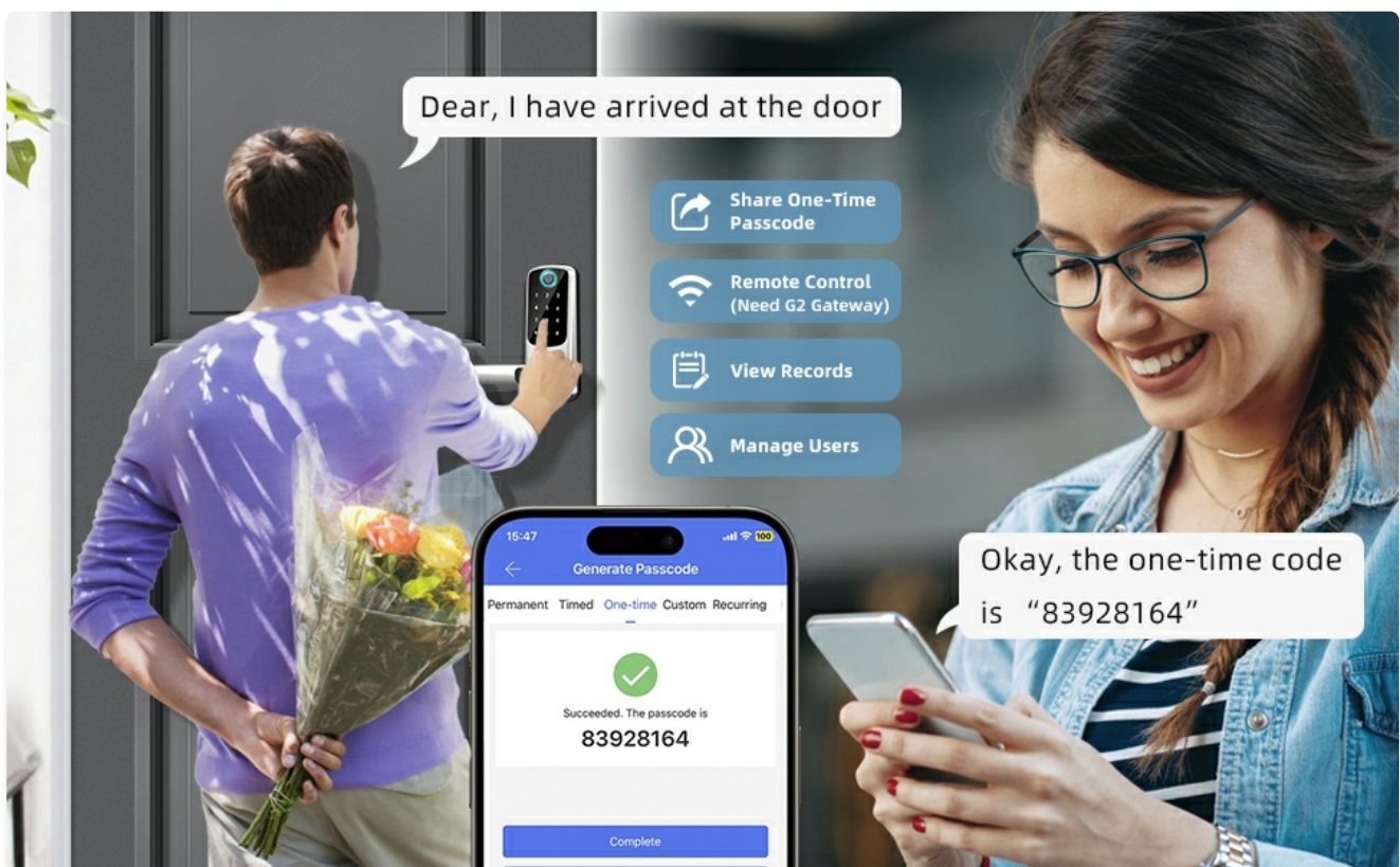
Figure 8: Stay informed with real-time notifications and detailed access logs directly on your smartphone.