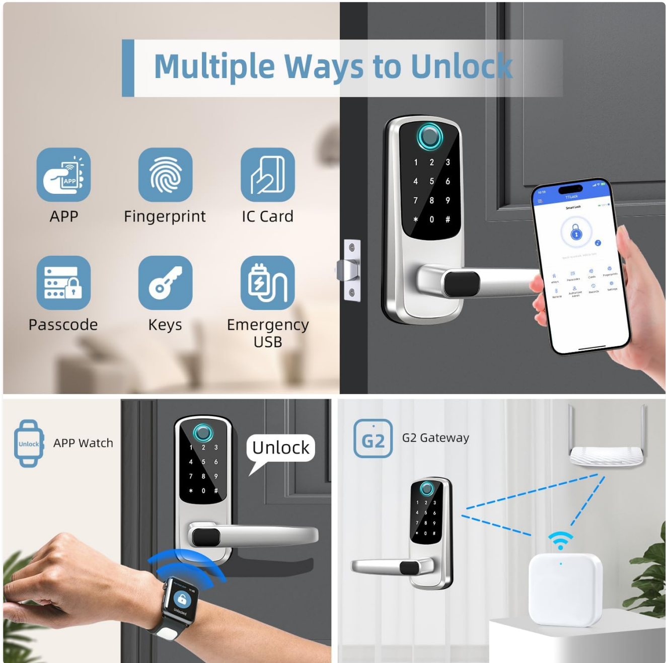
Figure 4: The MSR X6 Smart Lock offers a variety of unlocking methods for convenience and security.