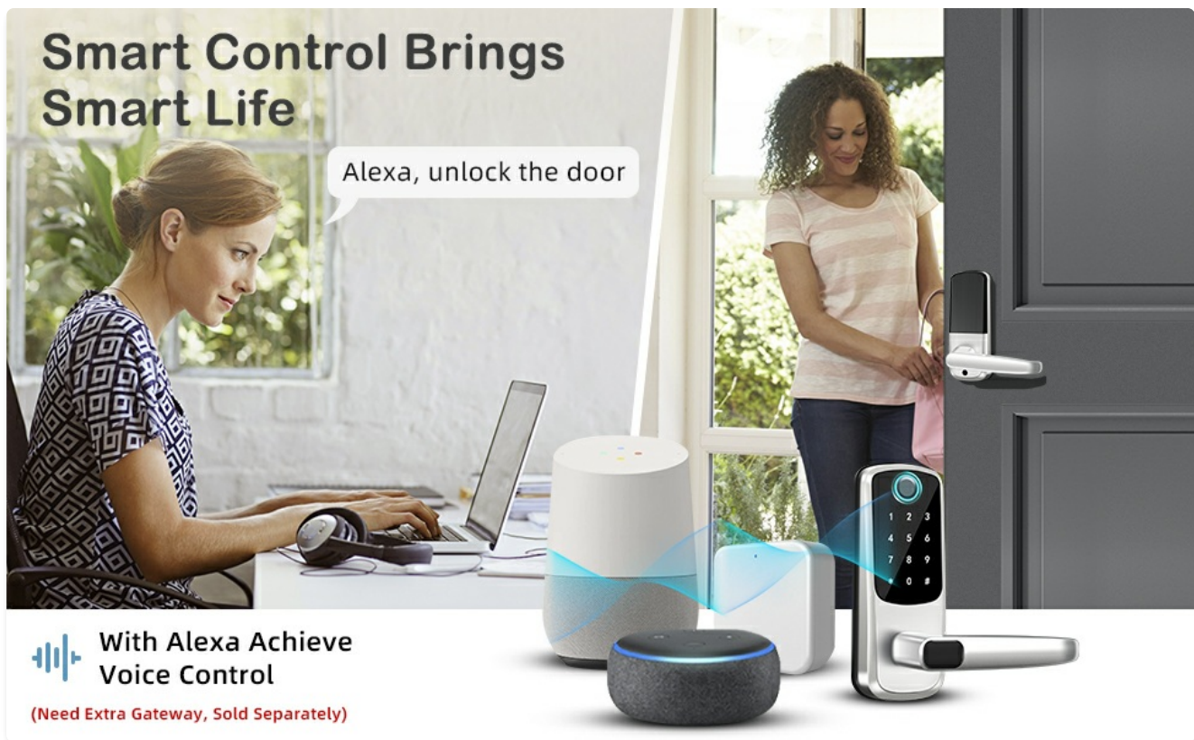
Figure 9: Control your smart lock with voice commands through Amazon Alexa or Google Assistant when paired with the G2 WiFi Gateway.