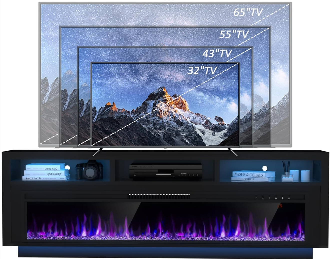
The TV stand is suitable for TVs up to 65 inches.

////// Suitable for TVs of 65" and below \\\