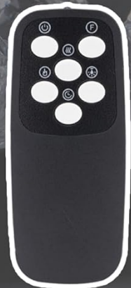
Overview of 12 flame colors and remote control functions.

Color: Changes the 12 color flame effect.