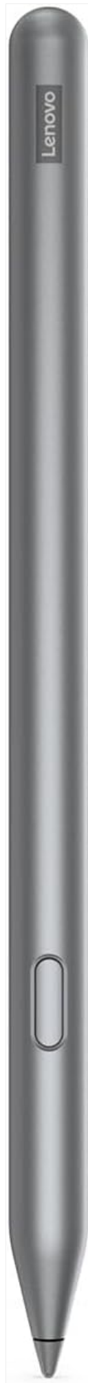
Figure 3.1: Front view of the Lenovo Tab Pen Plus, showcasing its sleek design and the Lenovo logo.