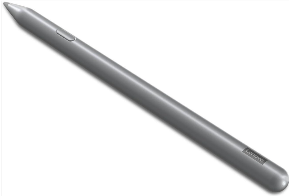
Figure 3.4: Angled view of the Lenovo Tab Pen Plus, illustrating its ergonomic design.