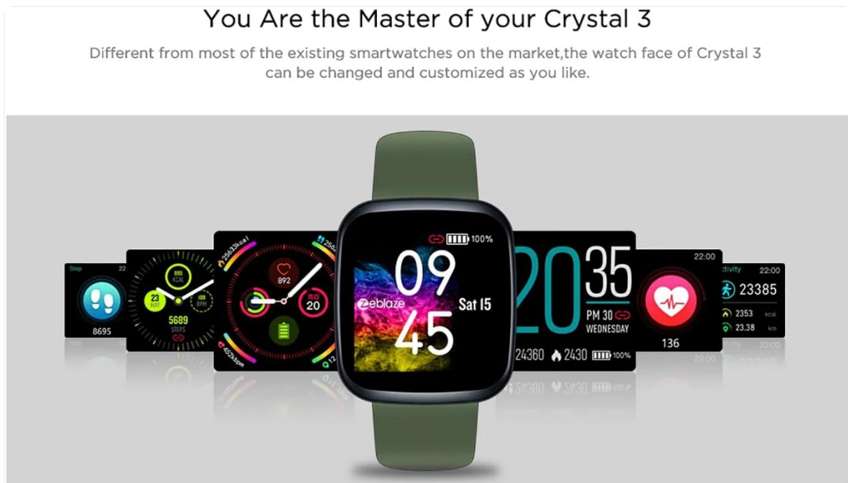
Image: The Zeblaze Crystal 3 displaying different customizable watch faces and data screens.