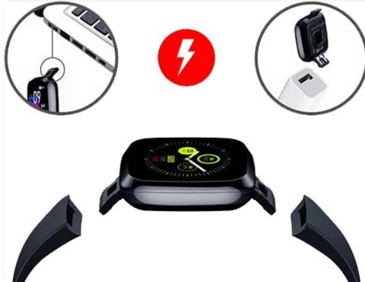
Image: Illustration highlighting the waterproof design of the Zeblaze Crystal 3 Smartwatch.

It is not recommended for swimming, showering with hot water, or diving.