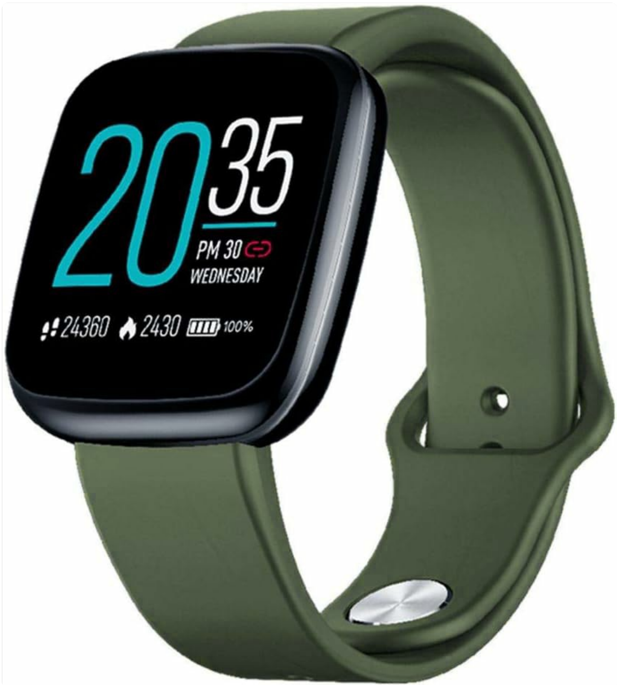
Image: Zeblaze Crystal 3 Smartwatch, showing the main display and green strap.