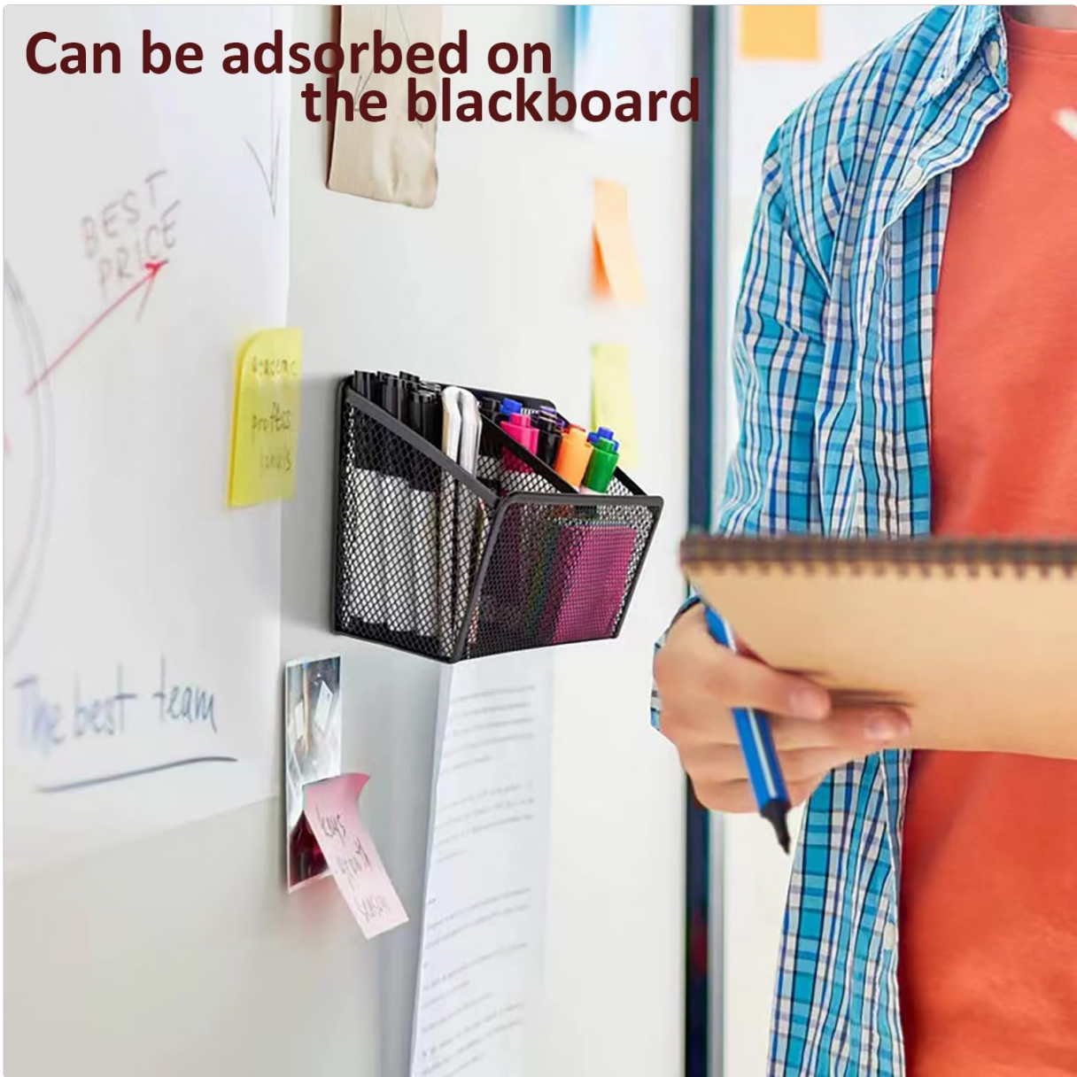
Image 2.2: The magnetic pen holder securely attached to a blackboard, demonstrating its use in an educational or office setting.