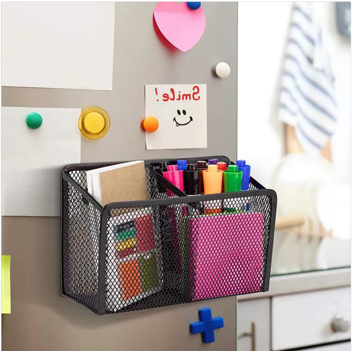
Image 3.1: The magnetic pen holder on a refrigerator, demonstrating its capacity to hold various items for easy access.