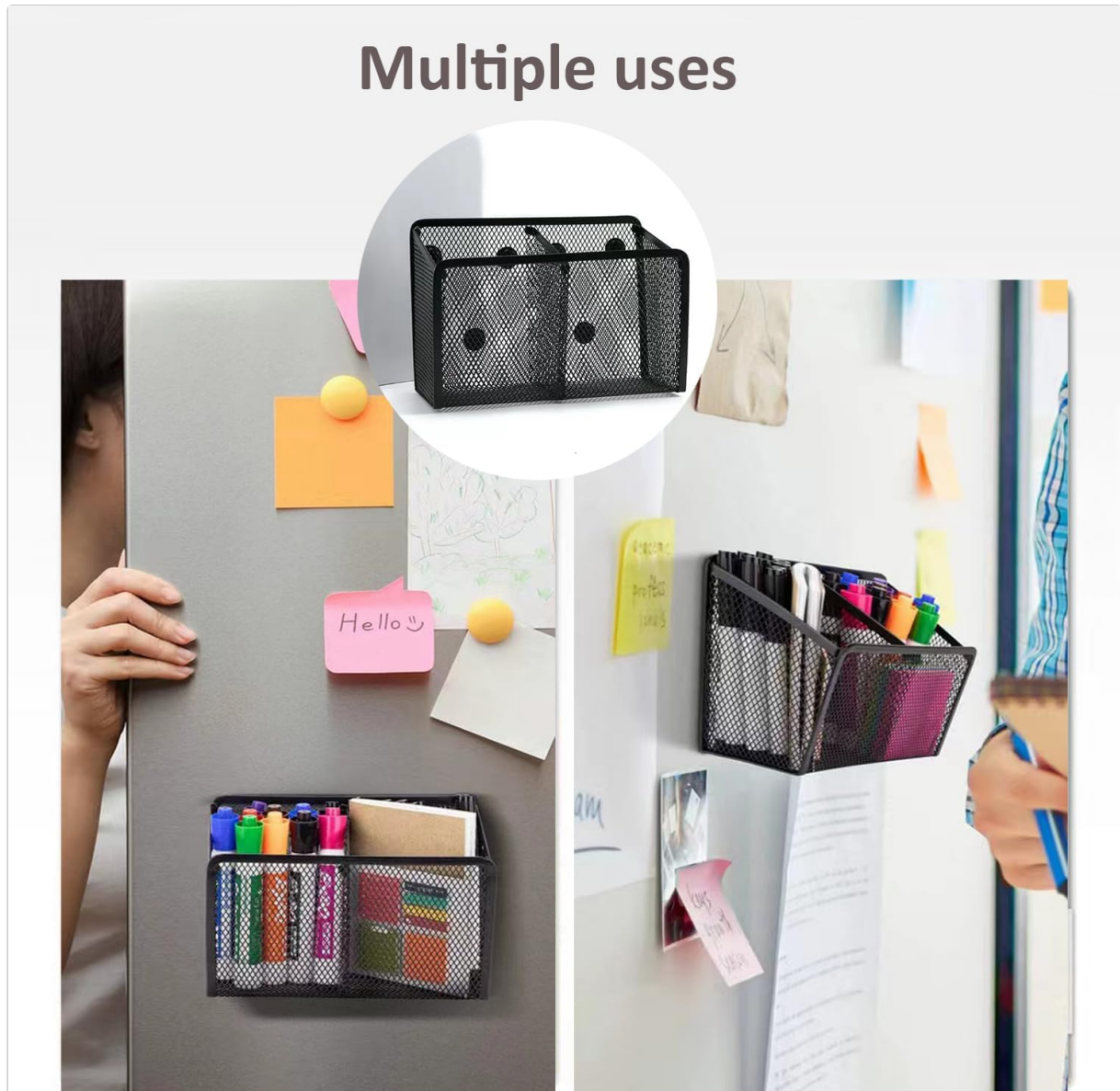
Image 2.1: The magnetic pen holder displayed on both a refrigerator and a whiteboard, illustrating its versatile application.