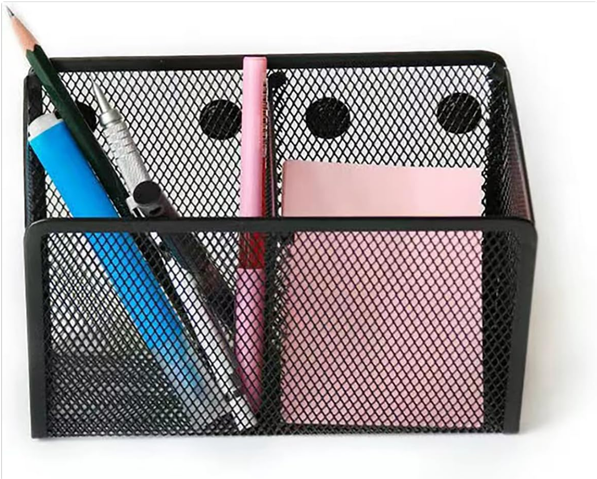
Image 3.2: A detailed view of the pen holder's contents, including writing instruments and small paper pads.