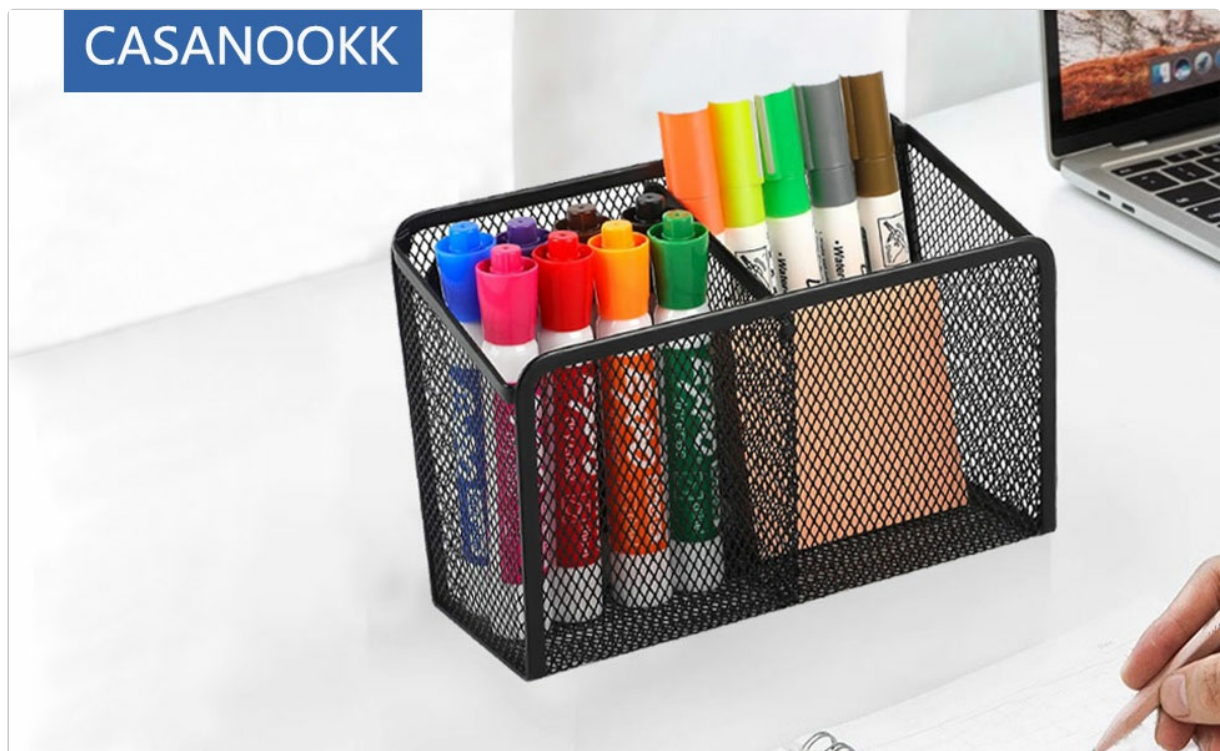
Image 1.1: The CASANOOKK Magnetic Mesh Pen Holder shown on a desk, holding various markers and pens.

The CASANOOKK Magnetic Mesh Pen Holder is designed to provide convenient storage for pens, markers, pencils, and other small office or household items. Its strong magnetic backing allows for easy attachment to various magnetic surfaces, such as whiteboards, blackboards, refrigerators, and metal lockers. Constructed from durable metal mesh, it offers visibility of contents and promotes air circulation.