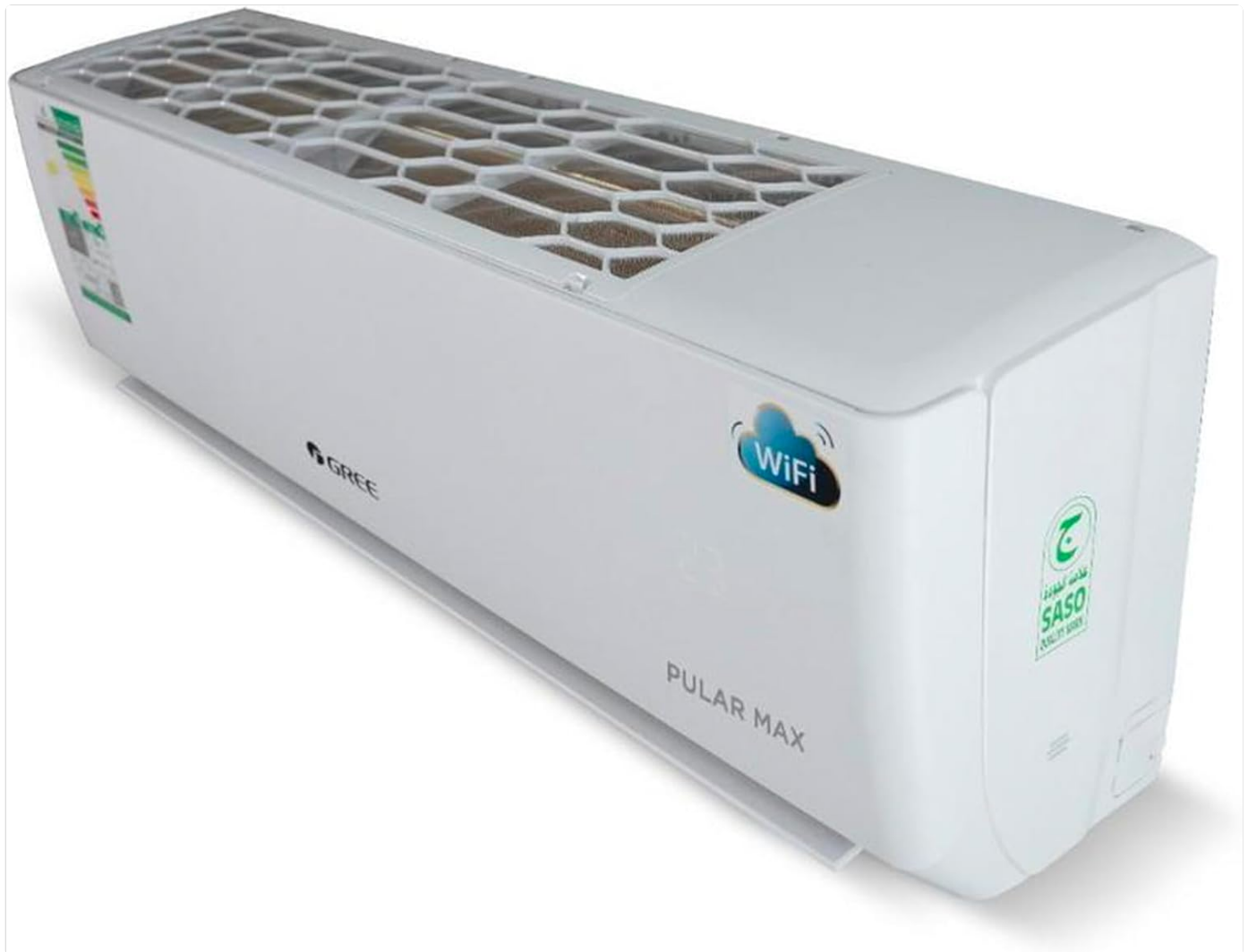
Figure 3.1: Indoor Unit. This image shows the sleek white indoor unit of the Gree Pular Split Air Conditioner, featuring the Gree logo and a 'Wi-Fi' indicator.