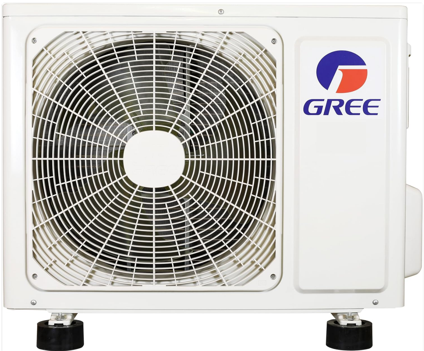
Figure 3.2: Outdoor Unit. This image displays the robust outdoor unit of the Gree Pular Split Air Conditioner, with a large fan grille and the Gree logo.