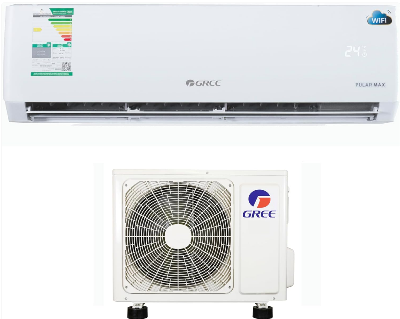
Figure 3.4: Indoor and Outdoor Units. A comprehensive view showing both the indoor and outdoor units of the Gree Pular Split Air Conditioner, highlighting their design and relative sizes.