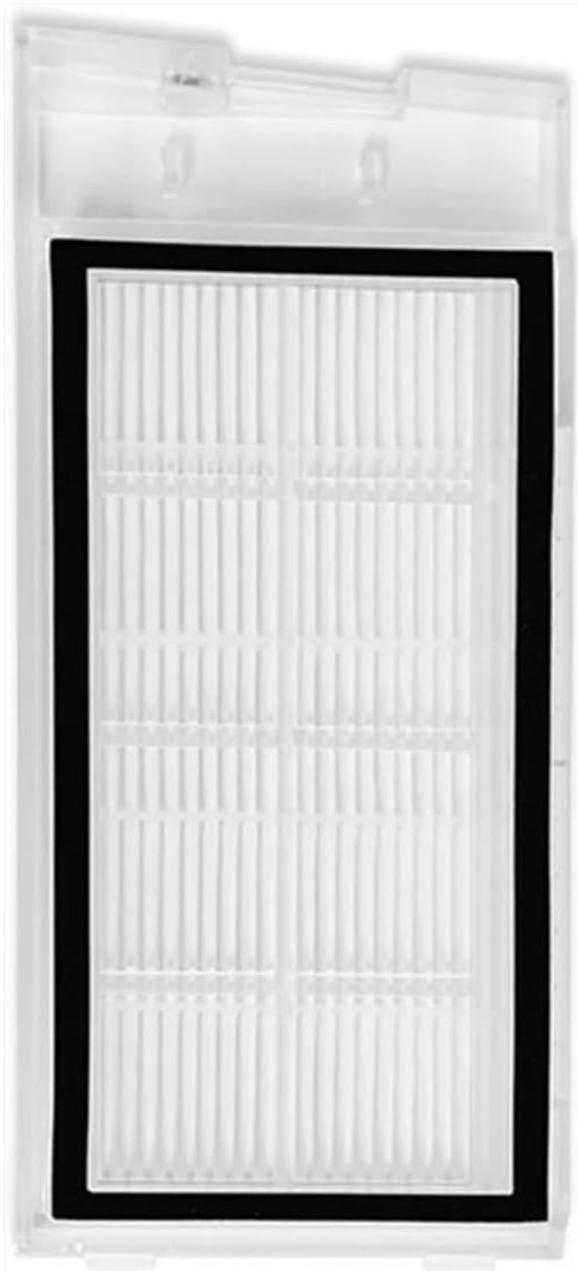
Image: HEPA Filter.