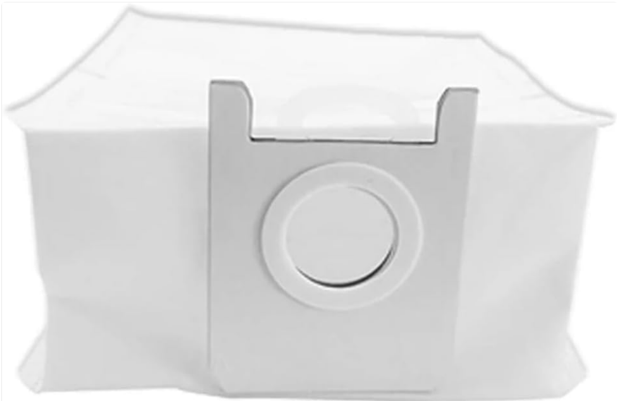
Image: Dust Bag.