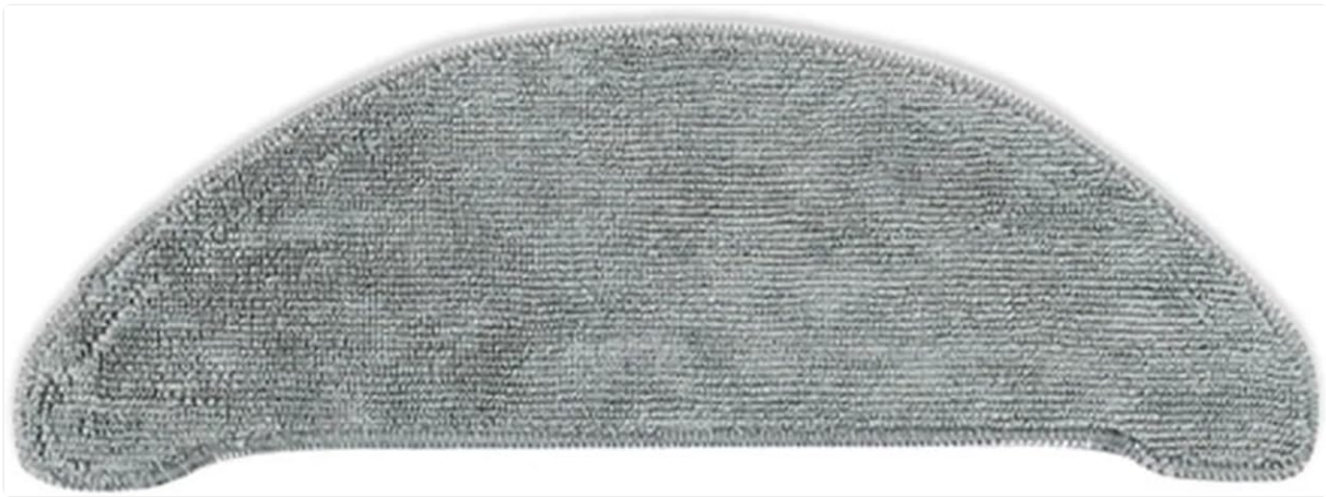
Image: Mop Cloth.