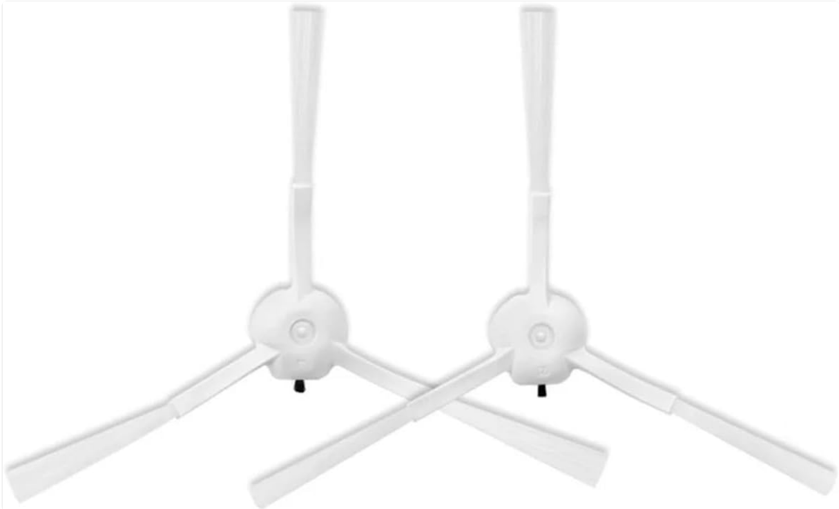
Image: Side Brushes.