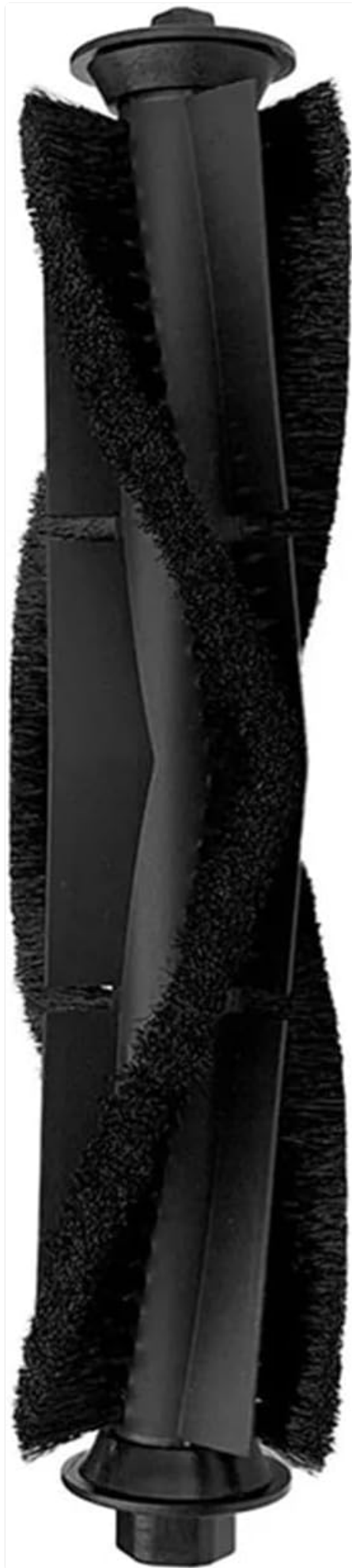
Image: Main Roller Brush.