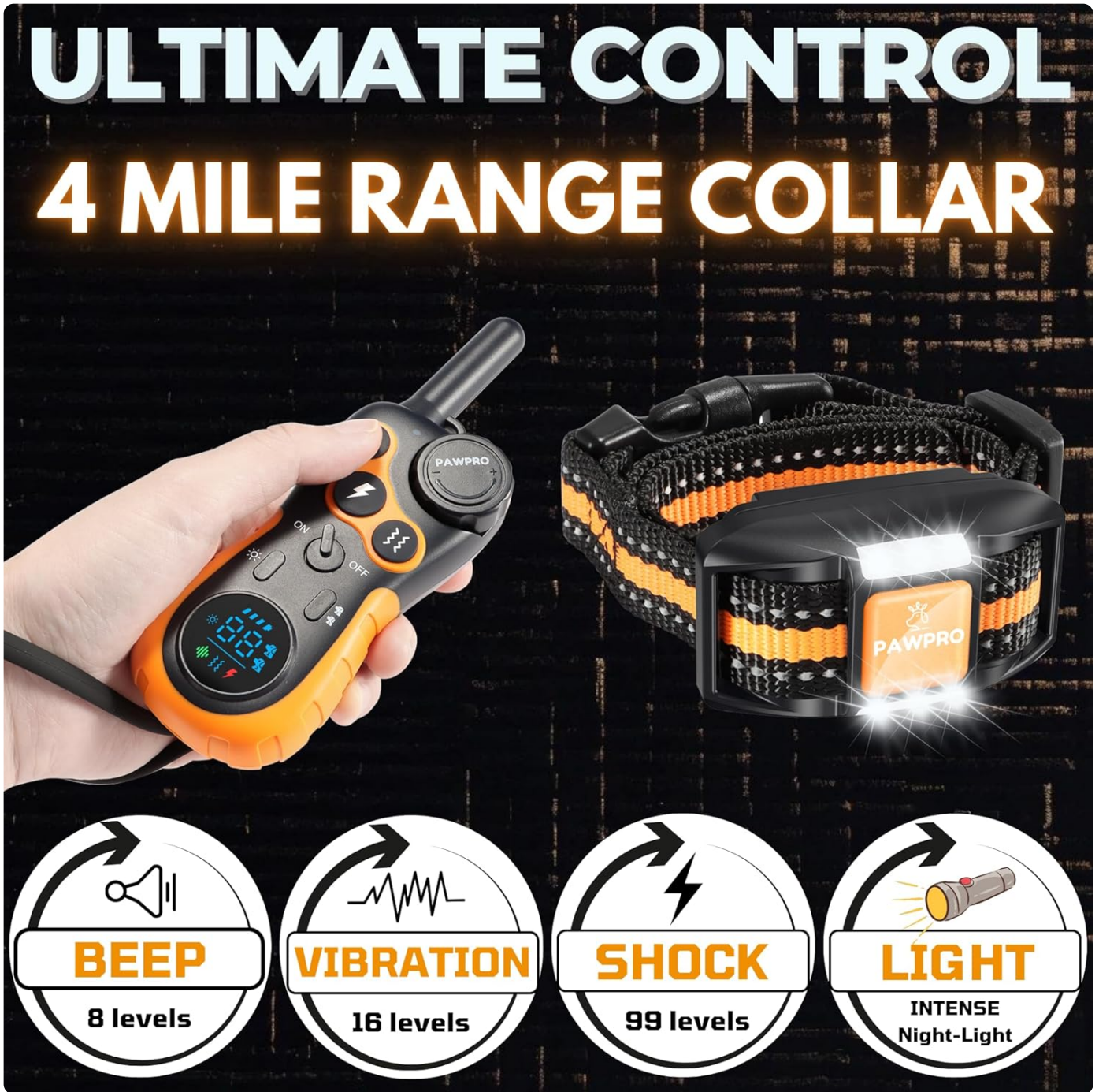
Figure 4: The remote control offers dedicated buttons for Beep, Vibration, Shock, and Light modes.