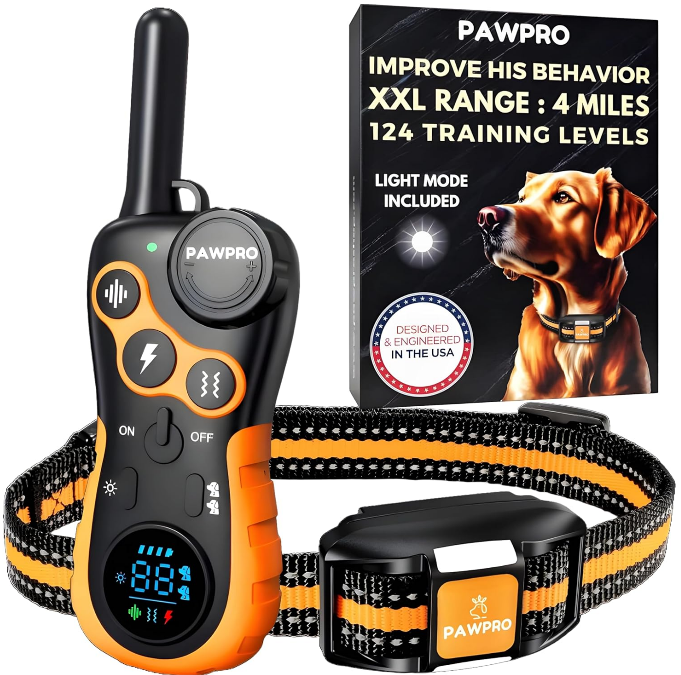
Figure 1: Complete PAWPRO Dog Training Collar package contents.