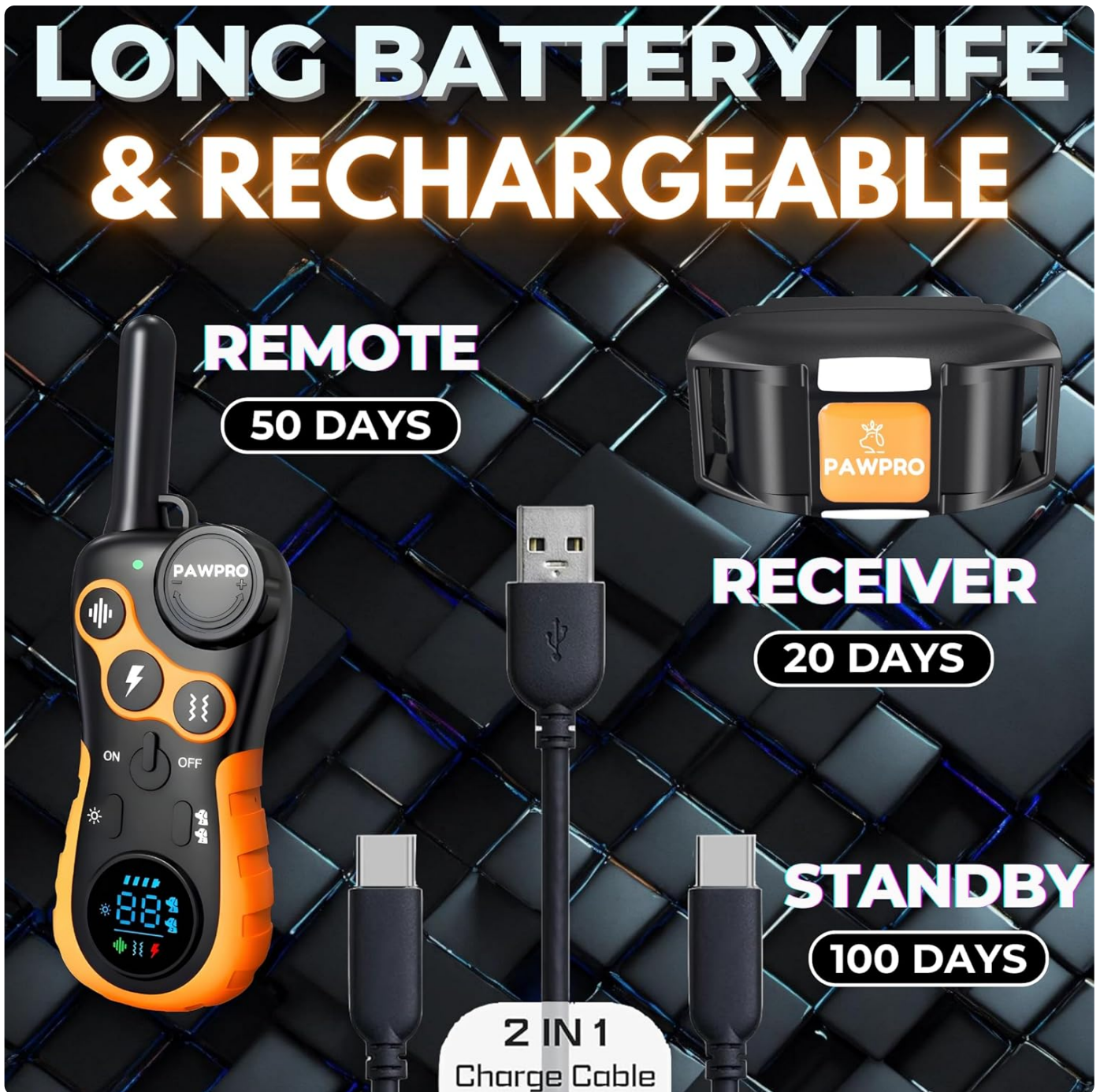
Figure 2: Remote and receiver with charging cable, illustrating long battery life.