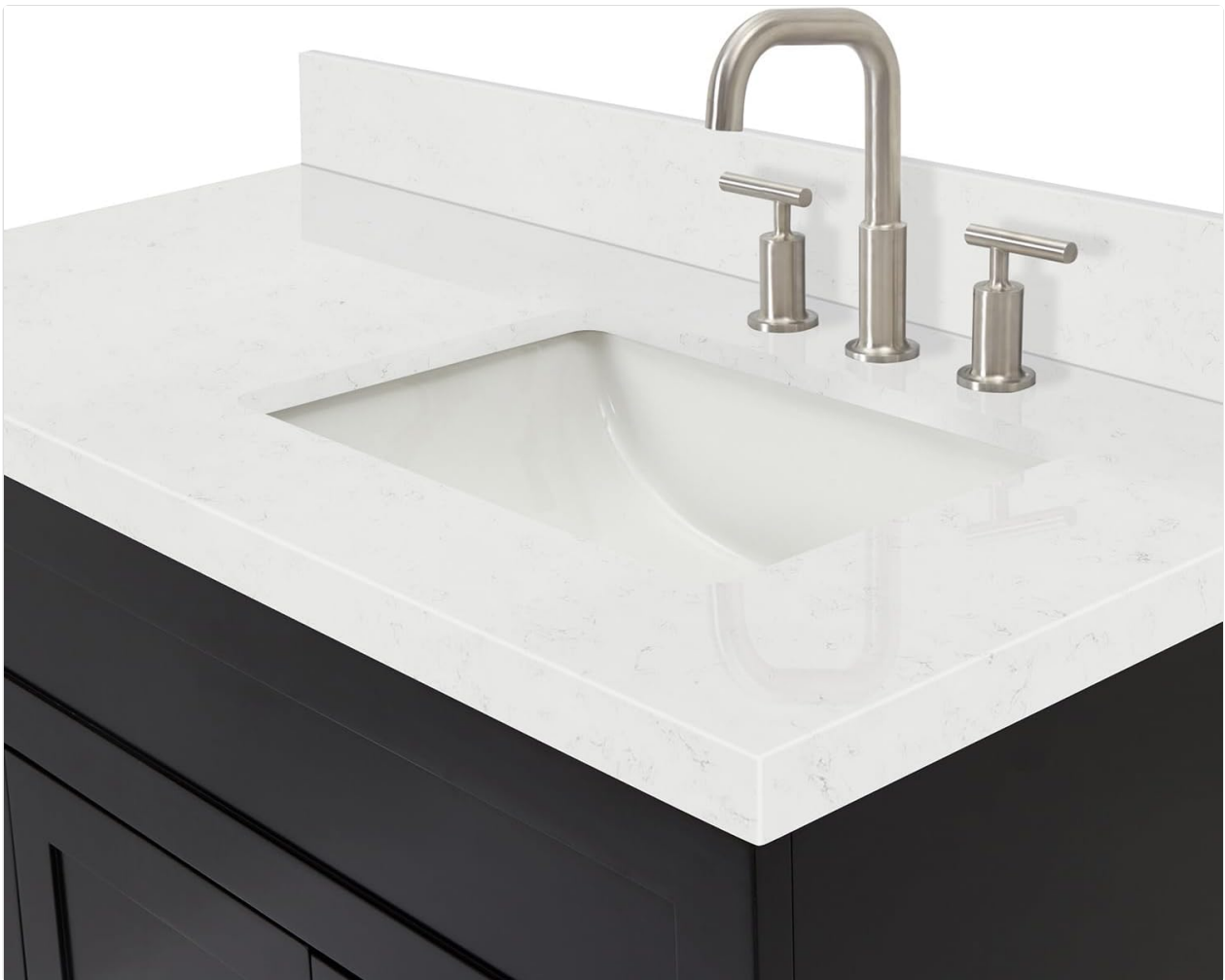
Image 5.1: Detail of the Carrara Quartz countertop with the rectangular under-mount sink.