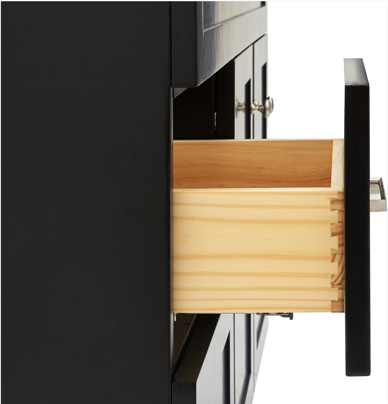
Image 6.2: Close-up view illustrating the robust dovetail joint construction of a drawer.