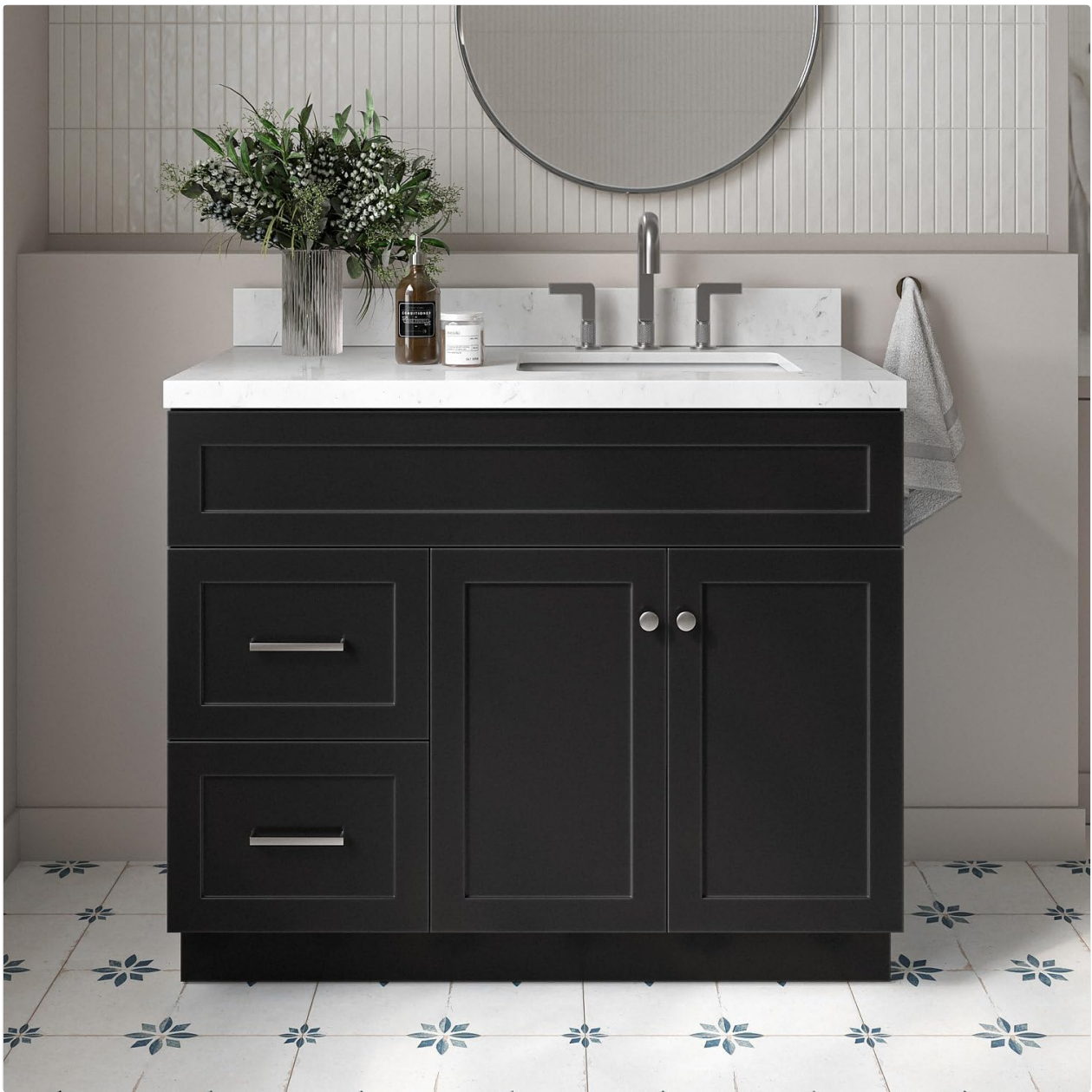
Image 1.1: Front view of the ARIEL Hamlet 42 Inch Single Sink Bathroom Vanity in Black.