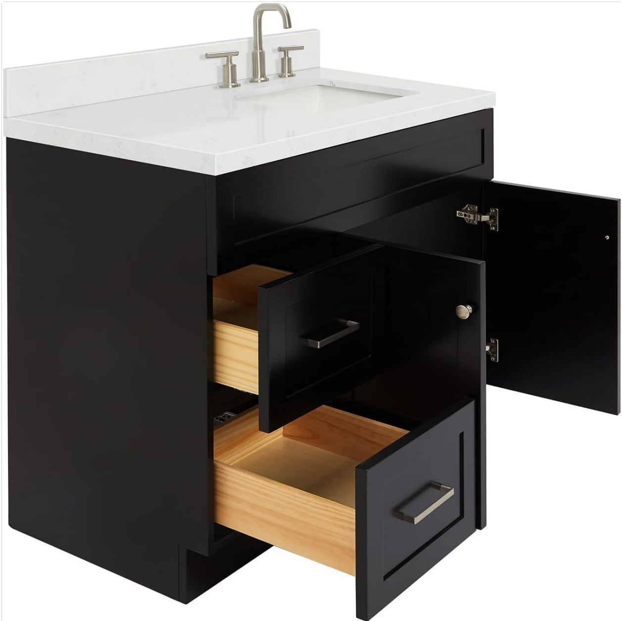
Image 6.1: View of the vanity with its soft-closing doors and full-extension drawers open, showcasing storage space.

components. Simply push the door or drawer gently, and the soft-close mechanism will engage to close it smoothly.