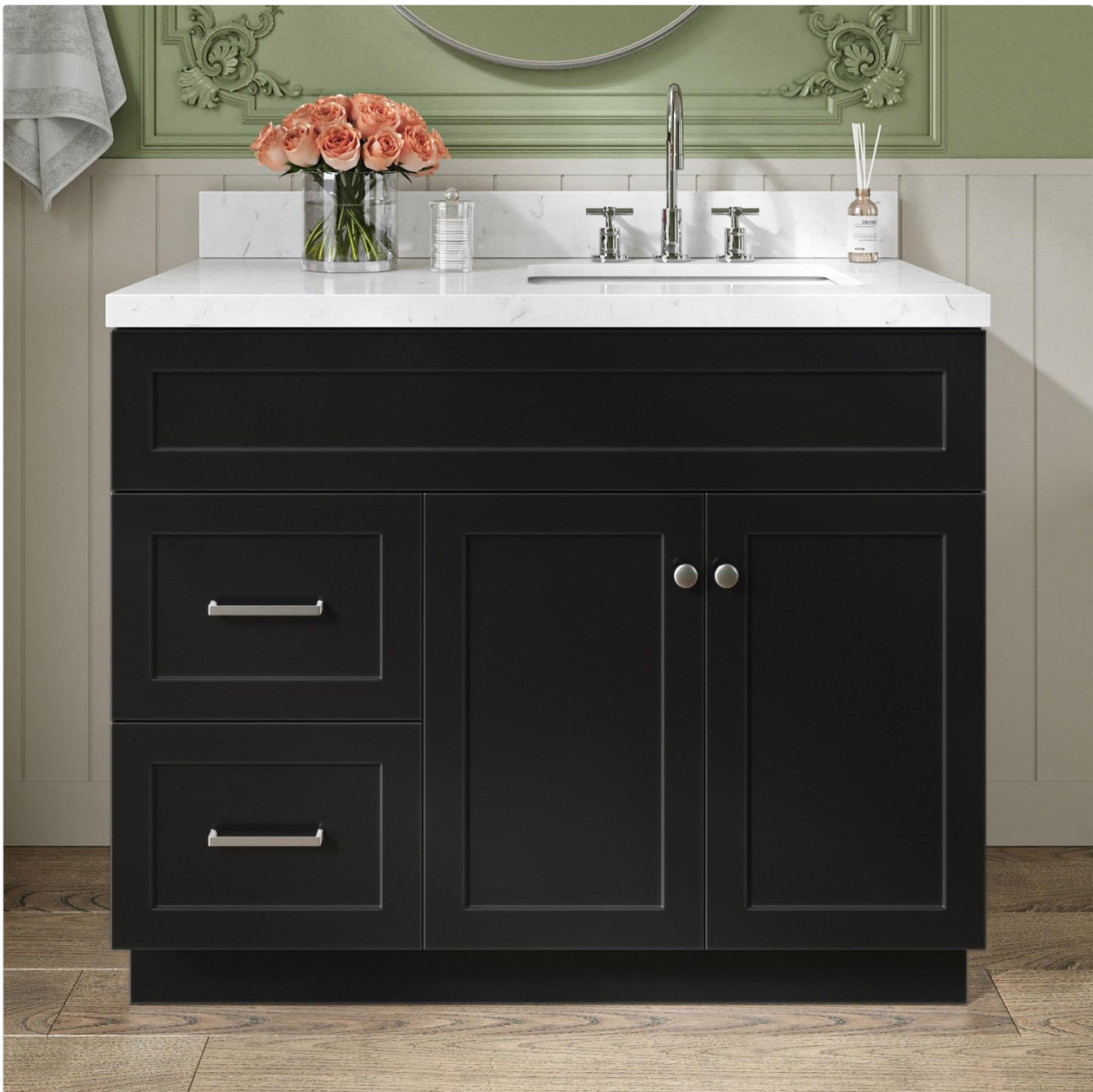
Image 5.2: Front view of the vanity with the countertop and sink installed.