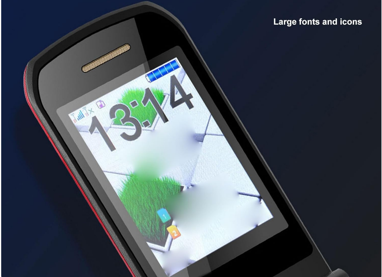
Figure 4.3: Screen dimensions and large font display for improved visibility.