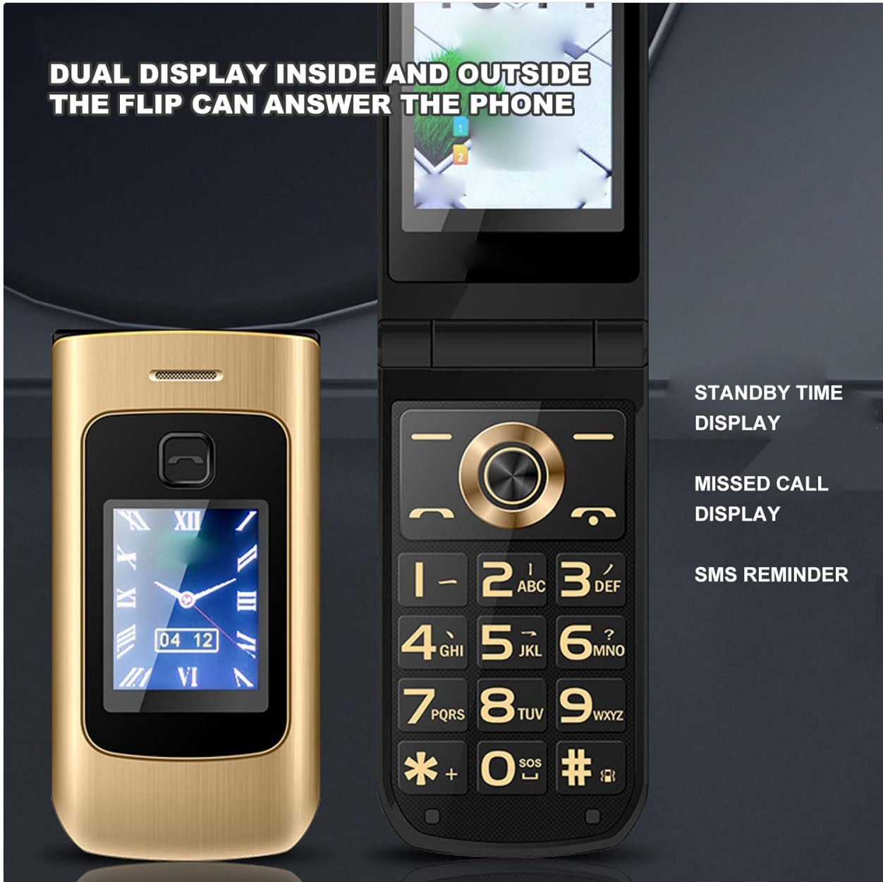
Figure 4.2: Dual display functionality, showing external screen information and internal screen upon opening.