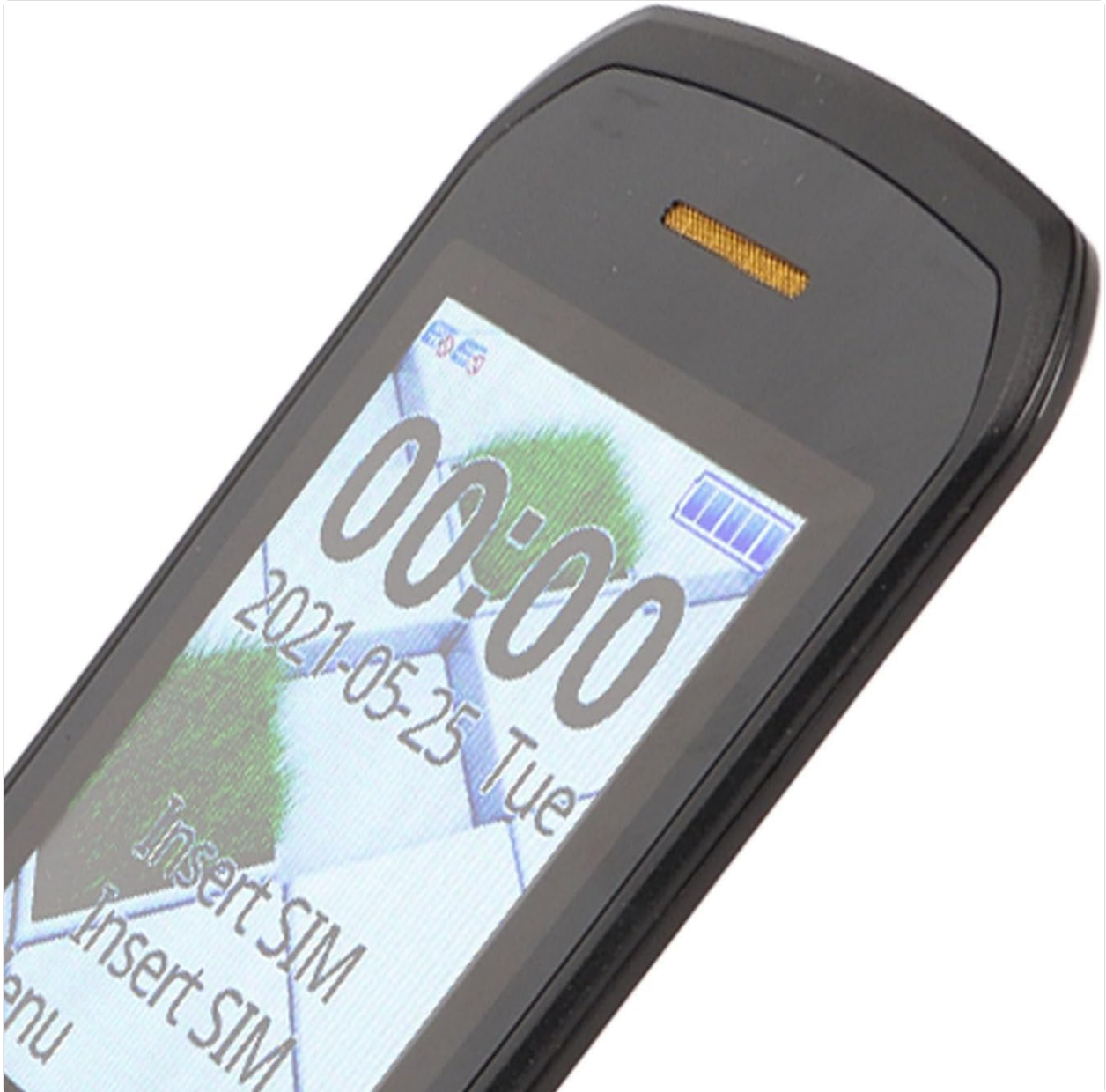
Figure 3.1: Phone screen prompting for SIM card insertion.