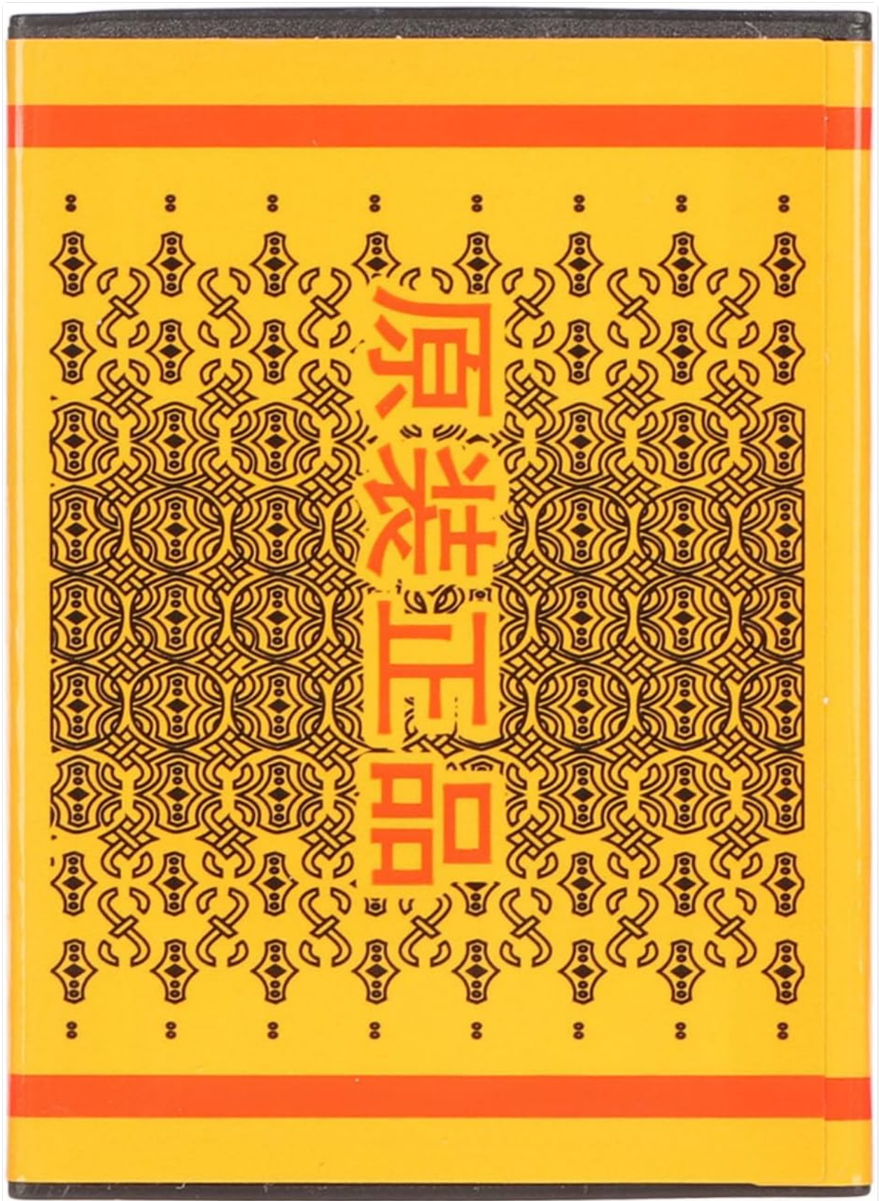
Figure 2.1: Package contents: phone, battery, and USB cable.