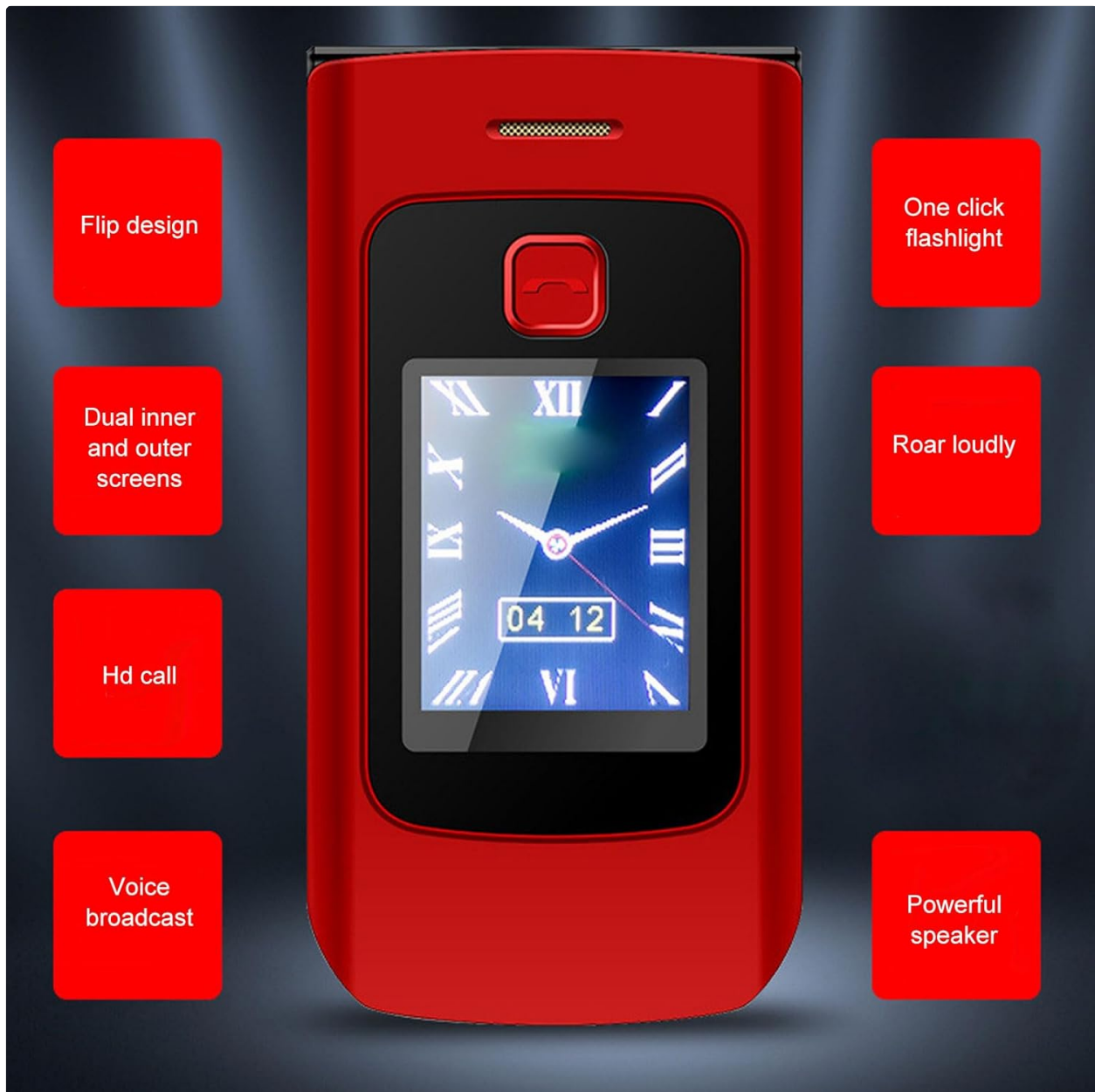
Figure 4.4: Overview of key features including flashlight, HD call, and powerful speaker.