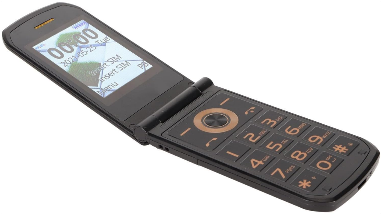
Figure 1.1: The Yunseity flip phone in its open position, showcasing the main display and large keypad.