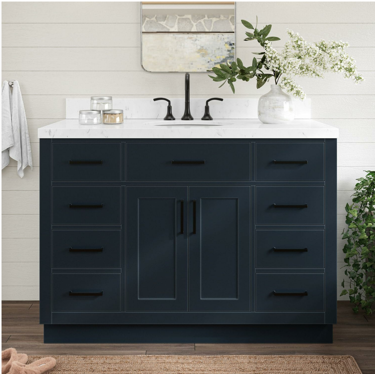
Front view of the ARIEL Hepburn 48-inch Bathroom Vanity in Midnight Blue.