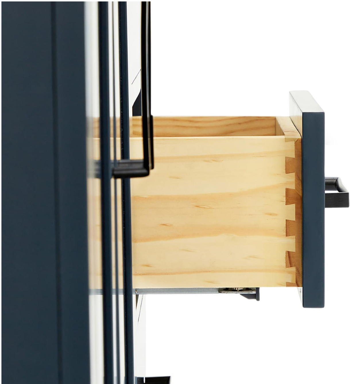
Dovetail joinery craftsmanship on drawers.