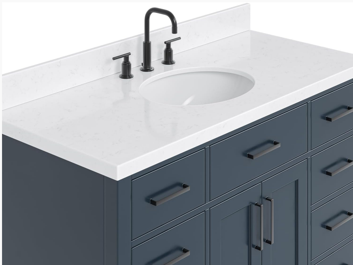
Carrara White Quartz countertop with oval sink.

9. Wipe away any excess silicone immediately with a damp cloth.