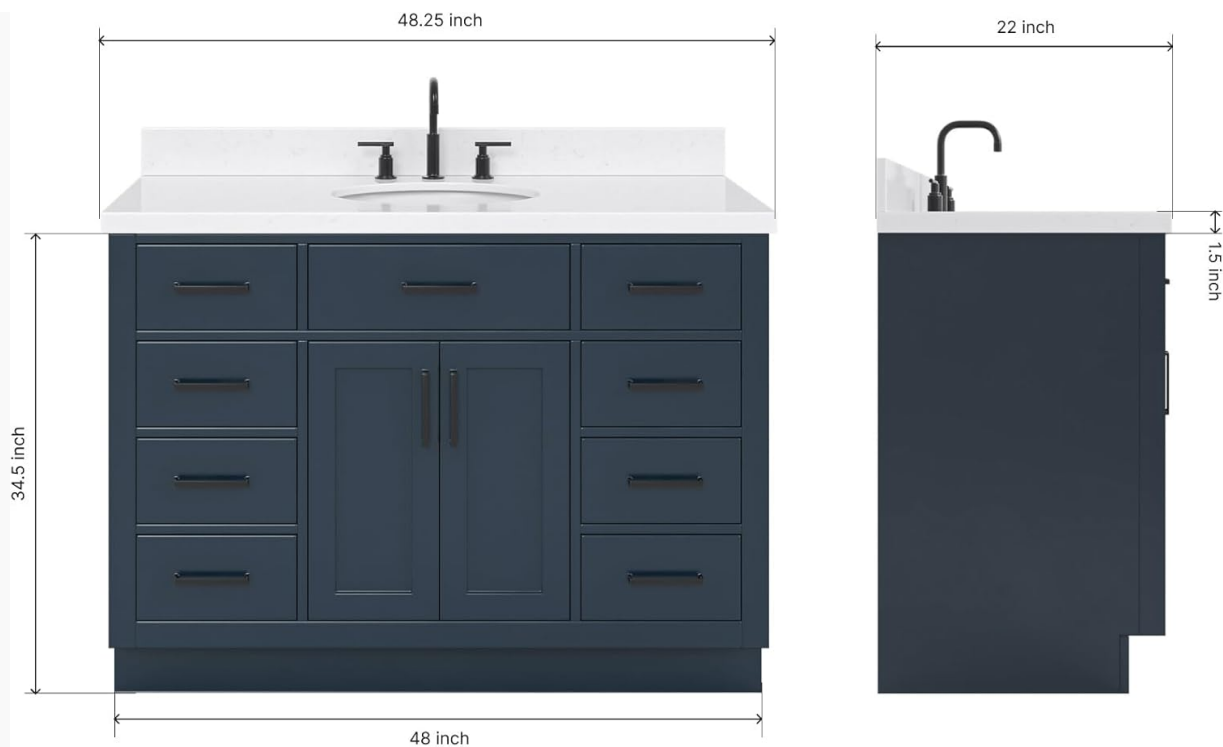
Dimensional drawing of the vanity.