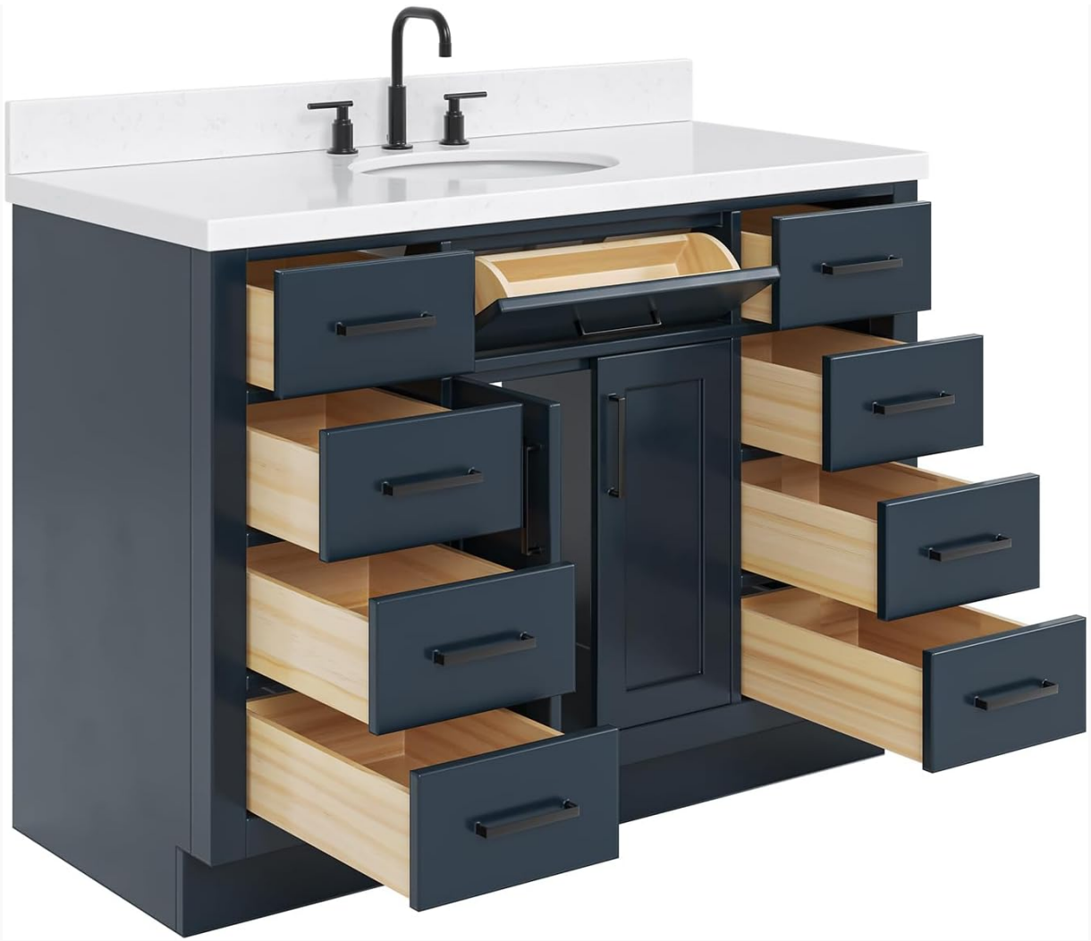
Vanity with all drawers and doors open.