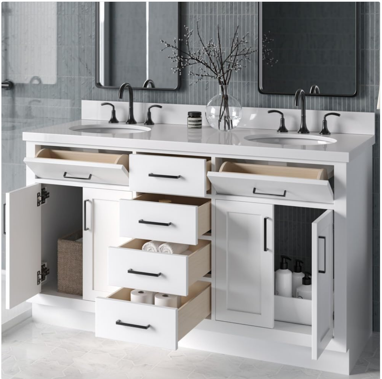
Figure 4: The vanity with its doors and drawers open, illustrating the ample storage space and the construction of the drawers.