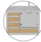
Figure 3: This diagram highlights key installation features such as pre-drilled faucet holes, the pre-assembled cabinet, hidden leveling feet, and the open back for plumbing access.

Easy access in back for plumbing installation