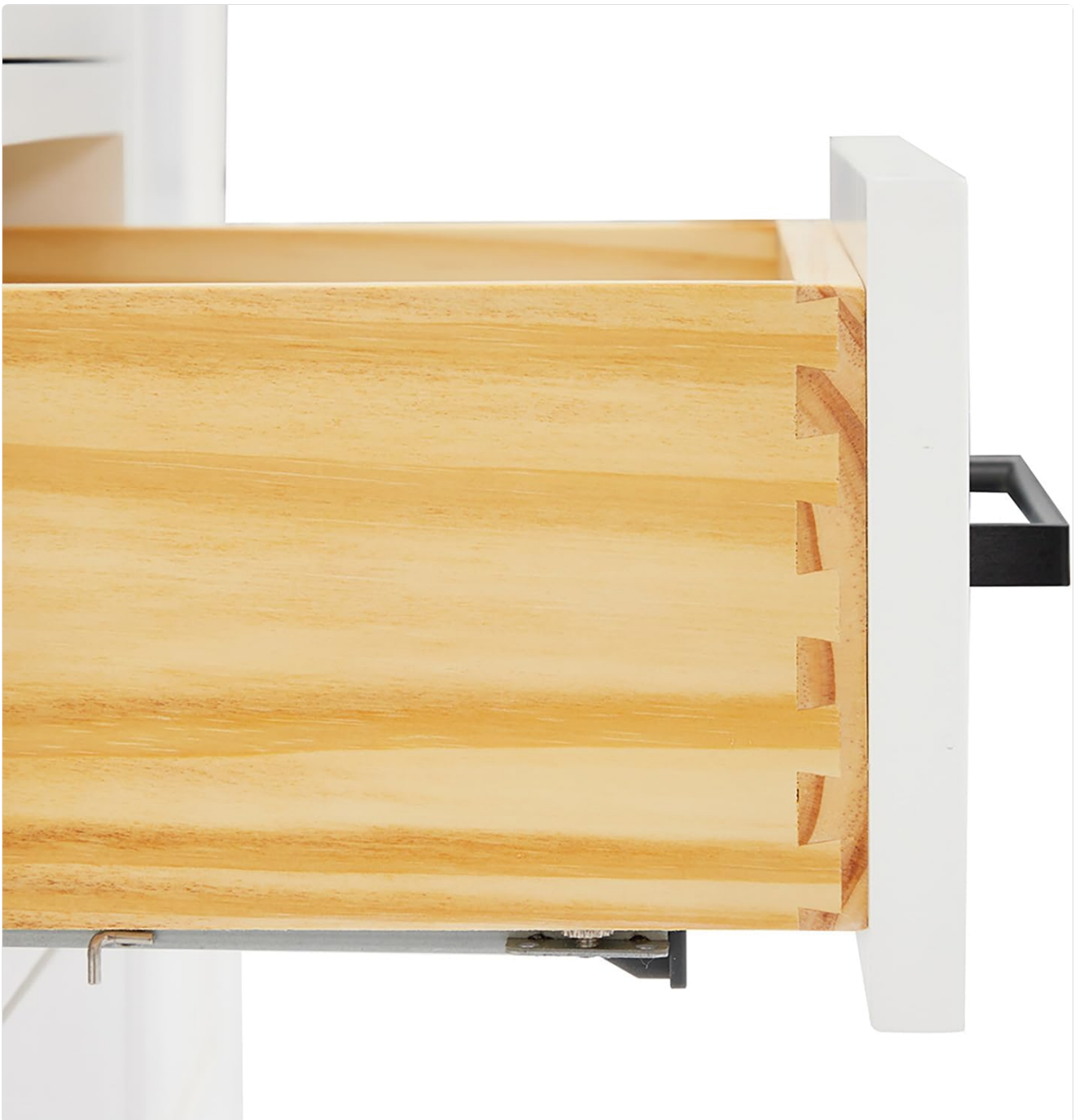
Figure 5: A close-up view of the dovetail joint construction on one of the vanity's drawers, highlighting its robust design.