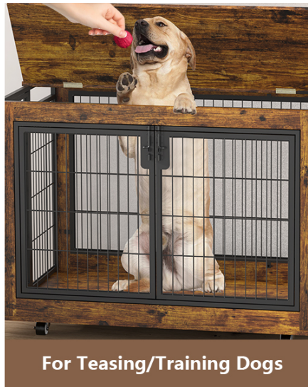
For Teasing/Training Dogs