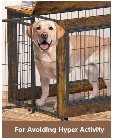
For Avoiding Hyper Activity