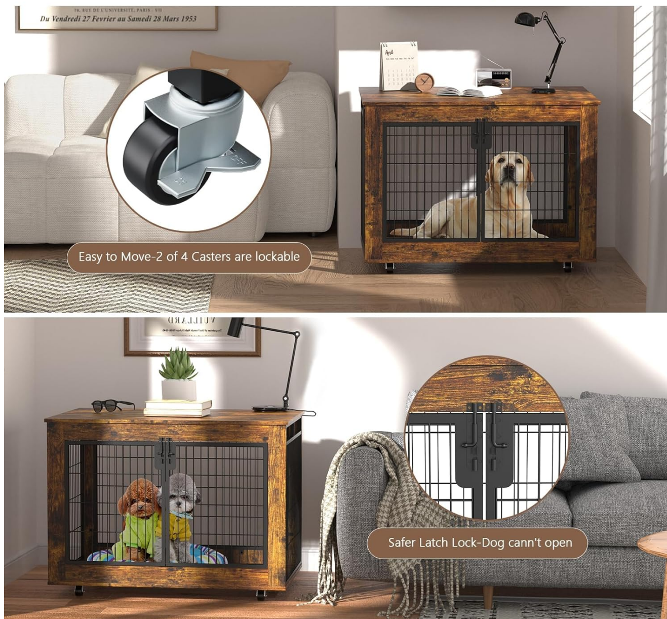
Figure 3: Close-up of the 360° casters and secure door latches.