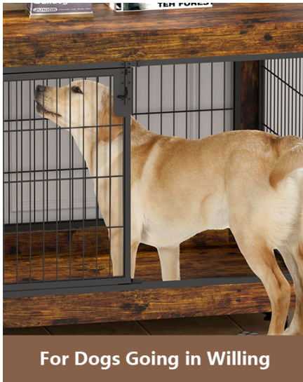
For Dogs Going in Willing