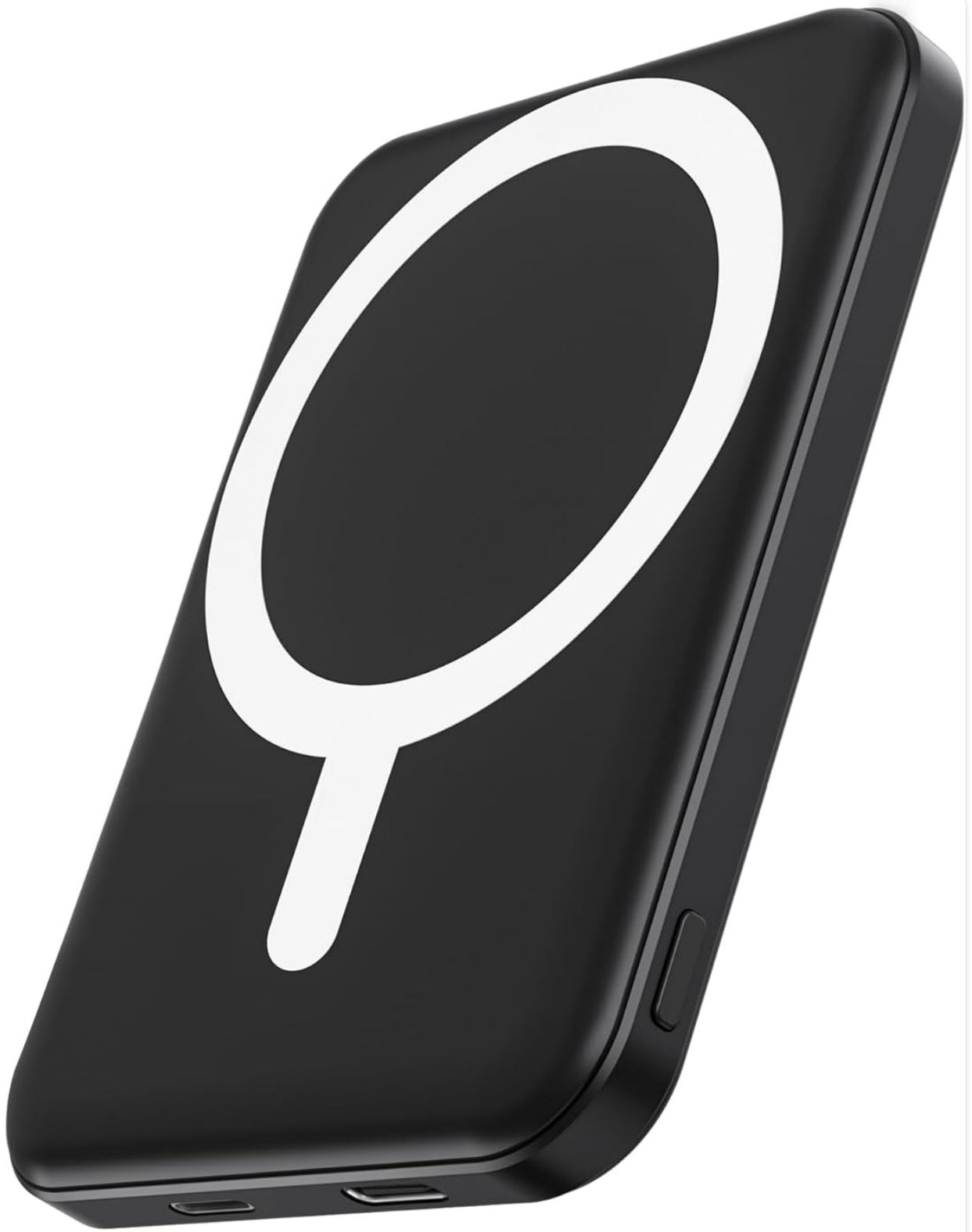
Image: The podoru 5000mAh Magnetic Power Bank, showcasing its sleek design and magnetic charging ring.