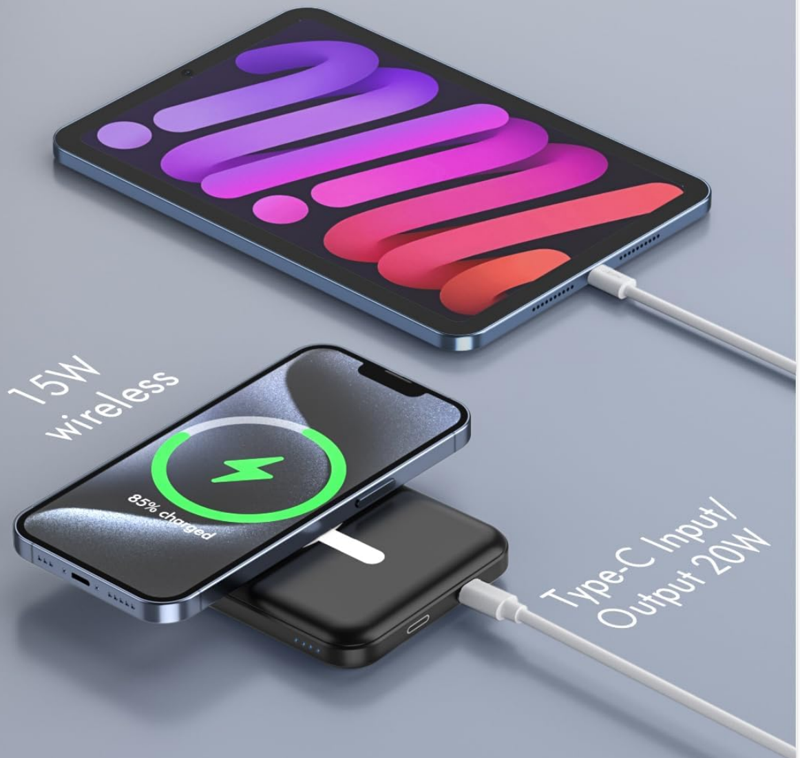
Image: Illustration of the power bank simultaneously charging an iPhone wirelessly and a tablet via its USB-C port.