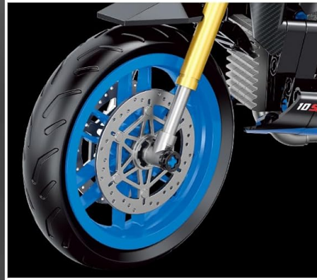
DISC BRAKE TYRE