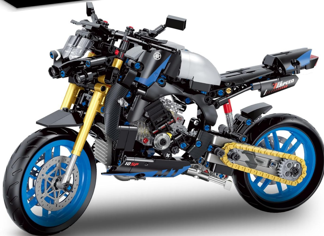
Image: The completed MJDDJA 1:8 scale motorcycle model, ready for display.

Your browser does not support the video tag.