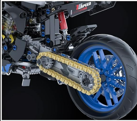
SMOOTH DRIVE CHAIN