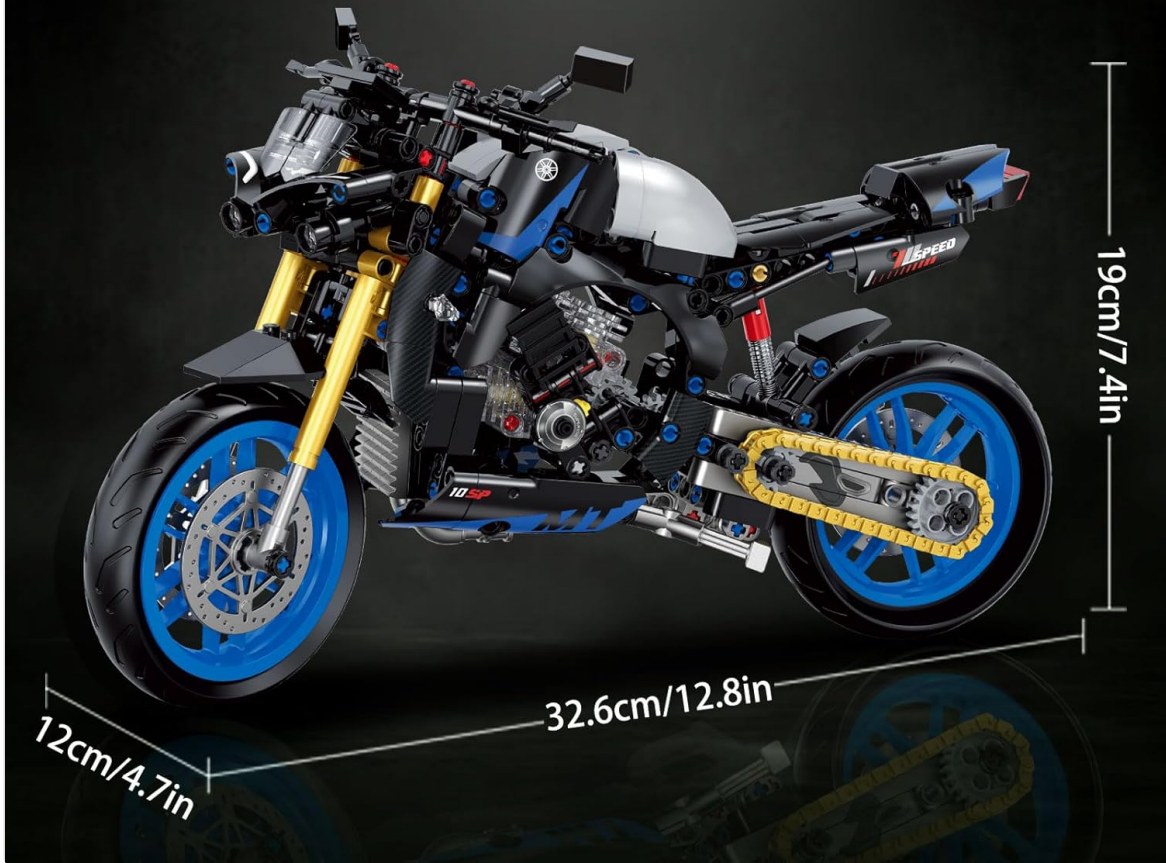
Image: Product dimensions of the assembled motorcycle model.