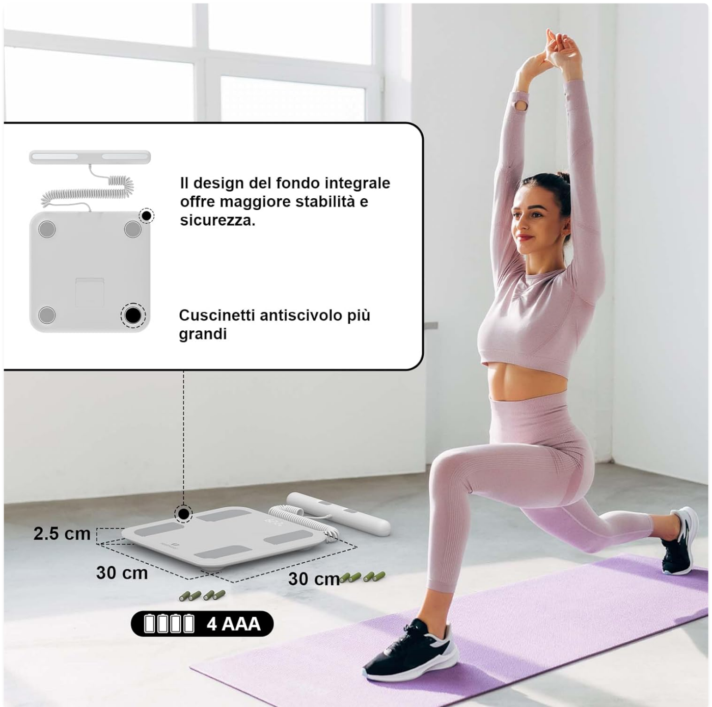
Image: Diagram showing the bottom of the scale with dimensions, battery compartment, and larger anti-slip pads for stability.

Open the battery compartment on the back of the scale. Insert the included 3 AAA batteries, ensuring correct polarity (+/-). Close the battery compartment securely.