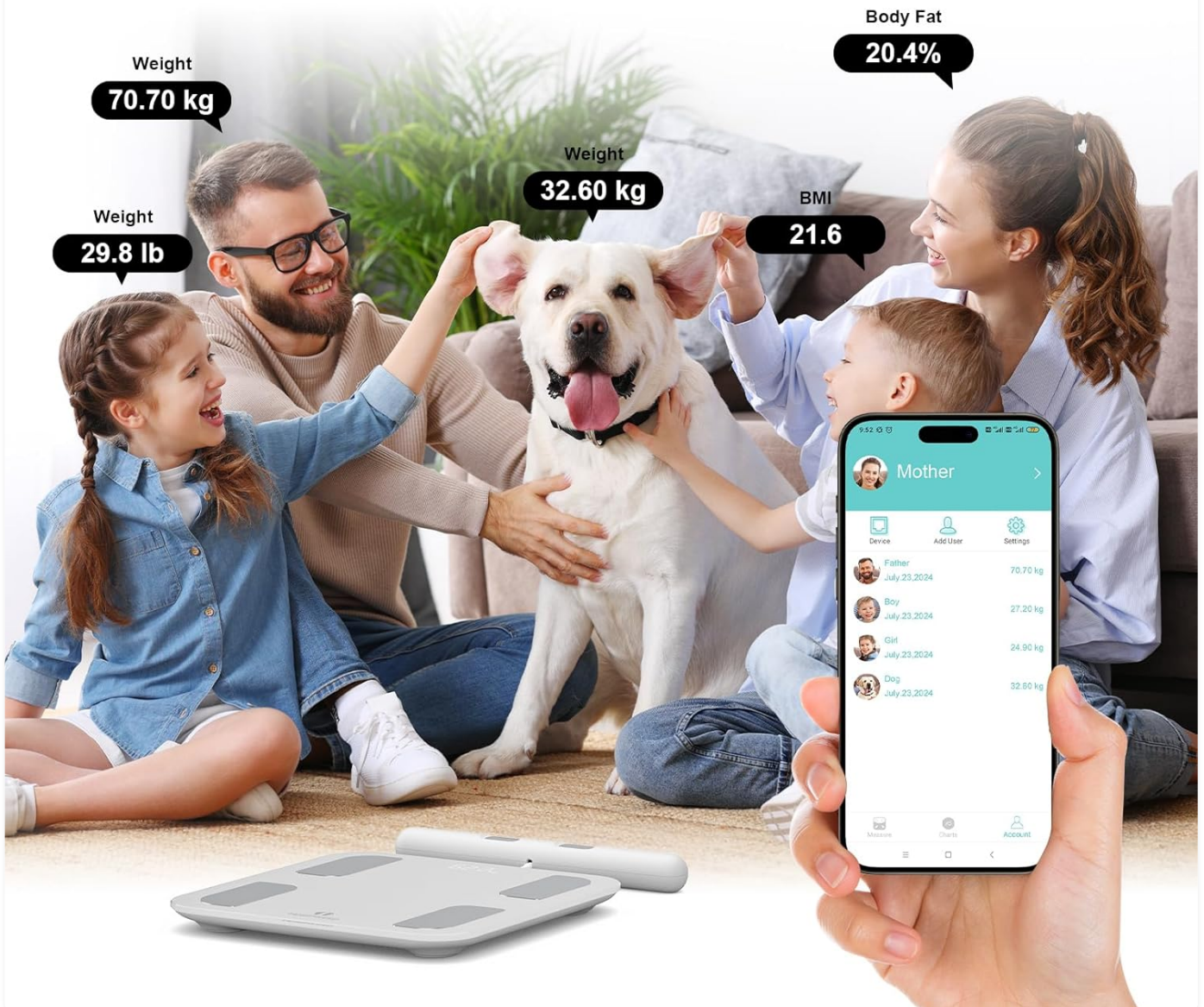
Image: A family, including children and a dog, gathered around the Healthkeep scale, with a smartphone displaying the multi-user management interface of the Fitdays app, demonstrating its ability to support up to 24 users.

Condividi la tua bilancia con amici e familiari