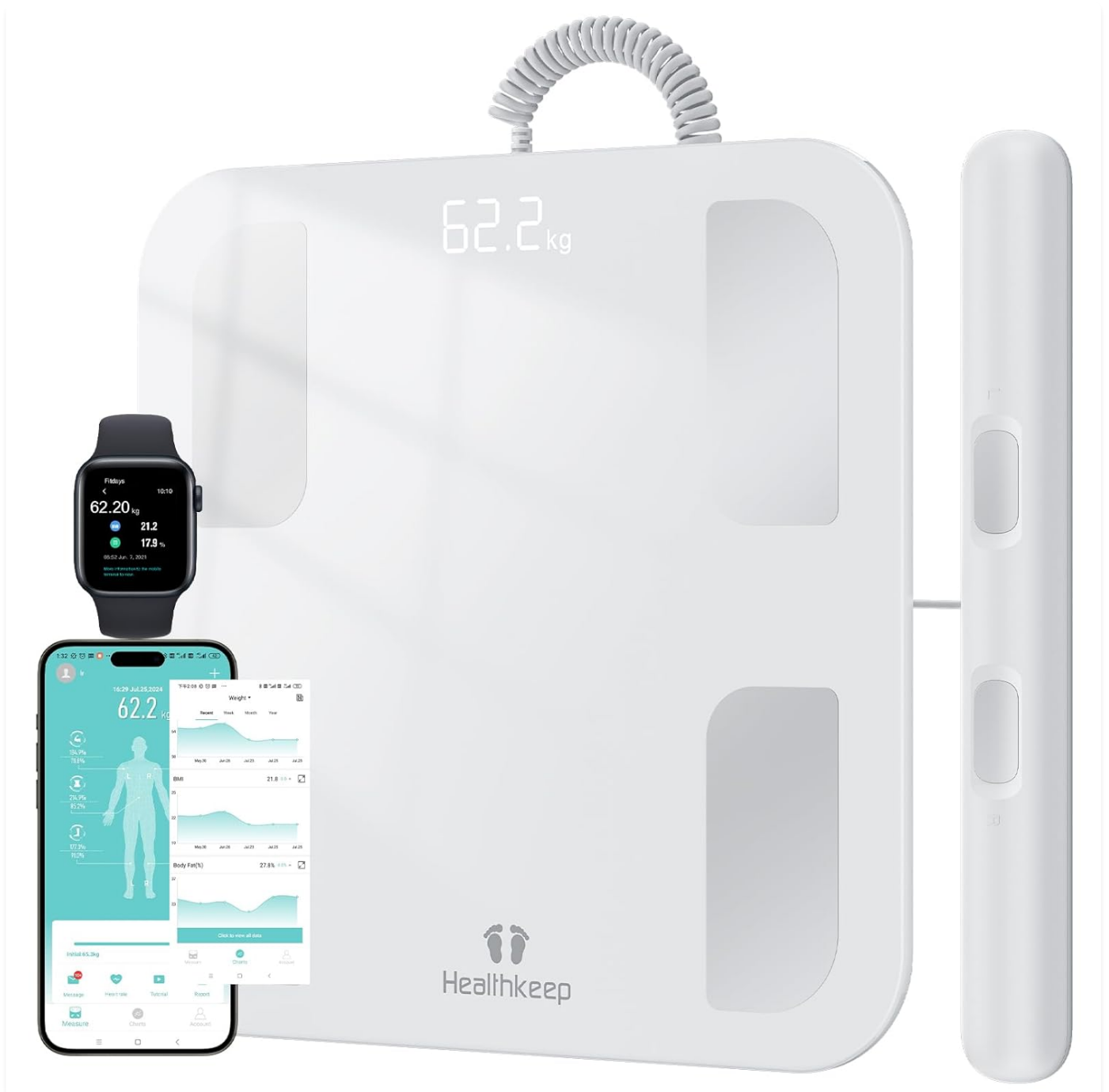
Image: The Healthkeep Digital Smart Bluetooth Body Fat Scale, showing the main unit, a detachable handle for 8-electrode measurement, a smartphone displaying the Fitdays app interface, and a smartwatch showing synchronized data.