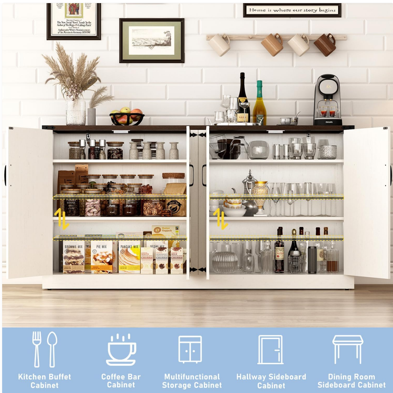
Image 5.1: Interior view of the cabinet demonstrating its storage capacity and organization possibilities for kitchen and dining essentials.