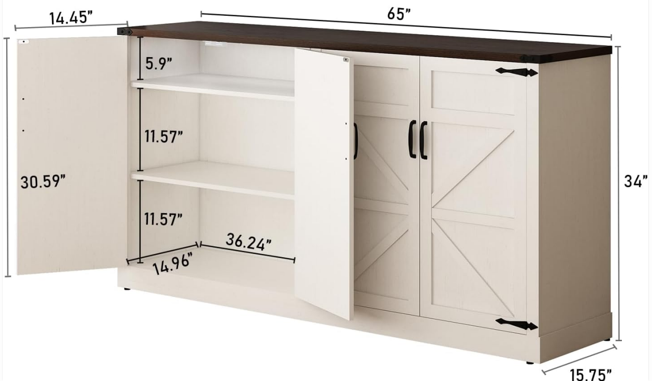
Image 4.1: Dimensional drawing of the cabinet, illustrating overall size and internal shelf spacing for planning and assembly.