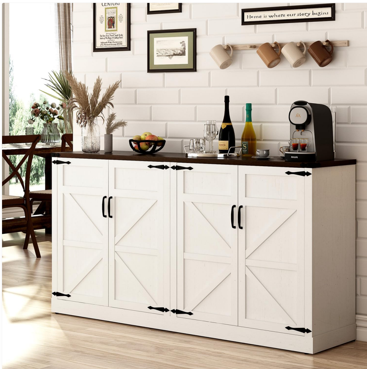
Image 1.1: The chartustriable 65-inch Sideboard Buffet Cabinet in a dining room setting, showcasing its design and potential use as a coffee bar.