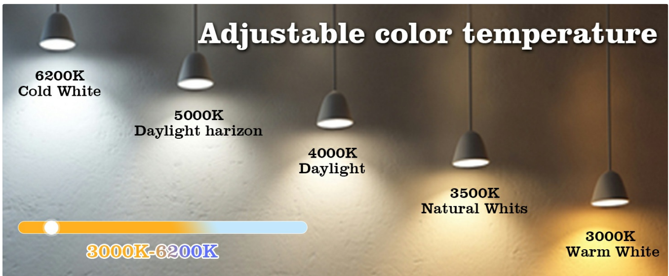
Image: Adjustable color temperature from warm to cool white.