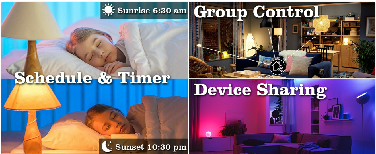
Image: Convenient timer for sleep and wake-up routines.