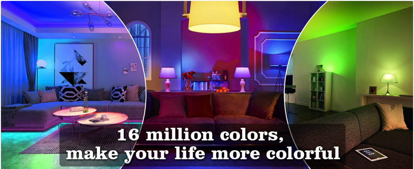
Image: Smart bulb displaying 16 million colors.