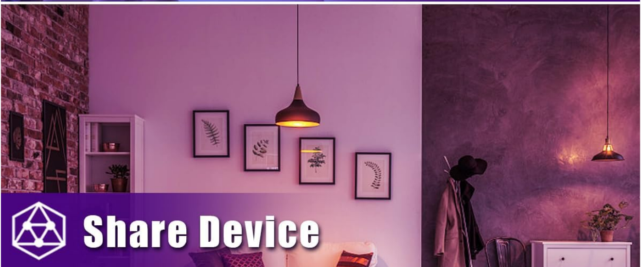
Image: App interface for smart bulb control.