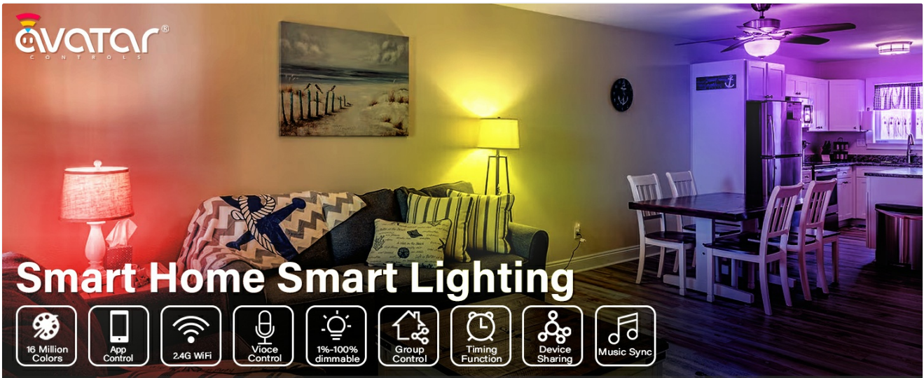
Image: Hands-free voice control with Alexa.