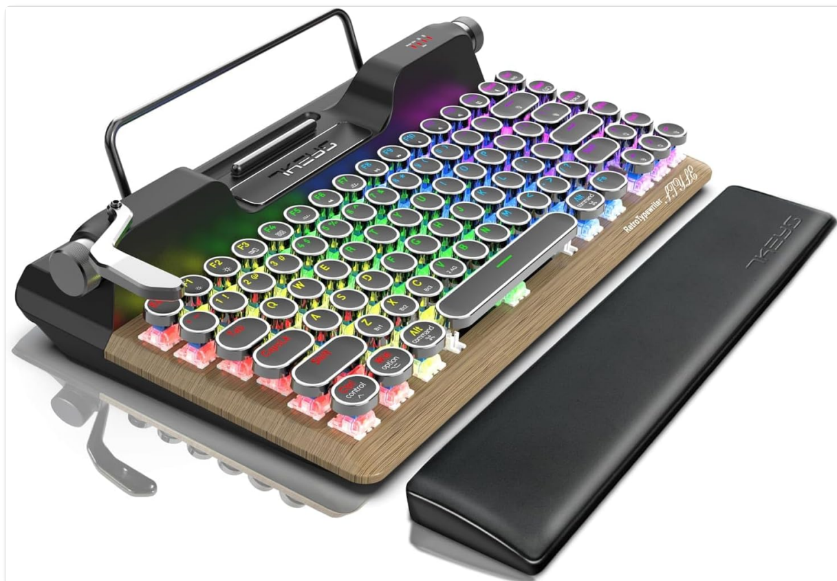
Image: The 7KEYS Retro Typewriter Mechanical Gaming Keyboard, showcasing its unique design with round keycaps, RGB backlighting, and an included wrist rest.

This manual provides comprehensive instructions for the setup, operation, and maintenance of your 7KEYS Retro Typewriter Mechanical Gaming Keyboard (Model TW1868). Designed with a vintage aesthetic and modern functionality, this keyboard offers multiple connection options and customizable RGB backlighting for an enhanced user experience.