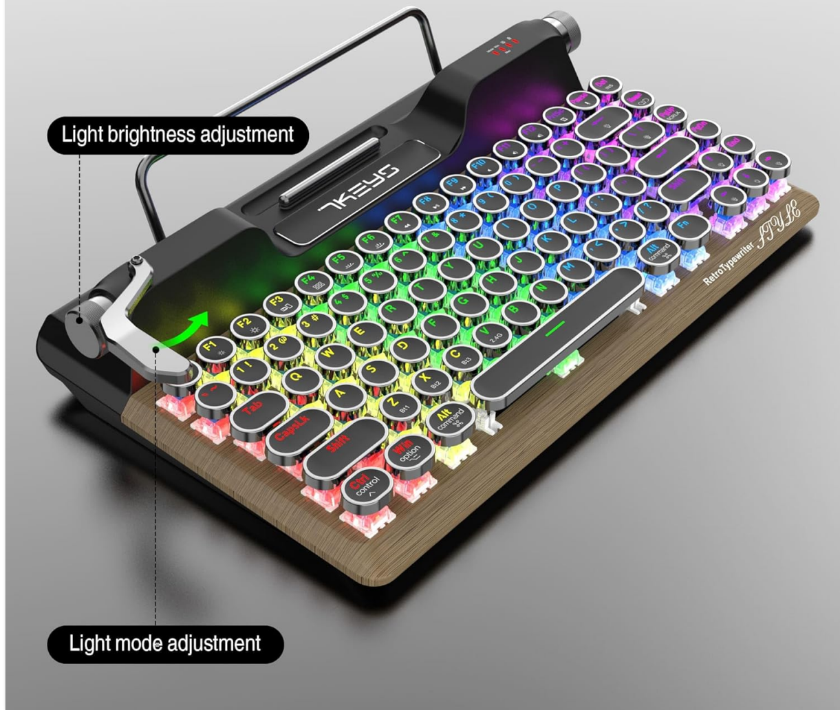
Image: Close-up of the keyboard illustrating the light brightness adjustment knob and the light mode adjustment lever.

Multiple lighting effects, flowing and colorful