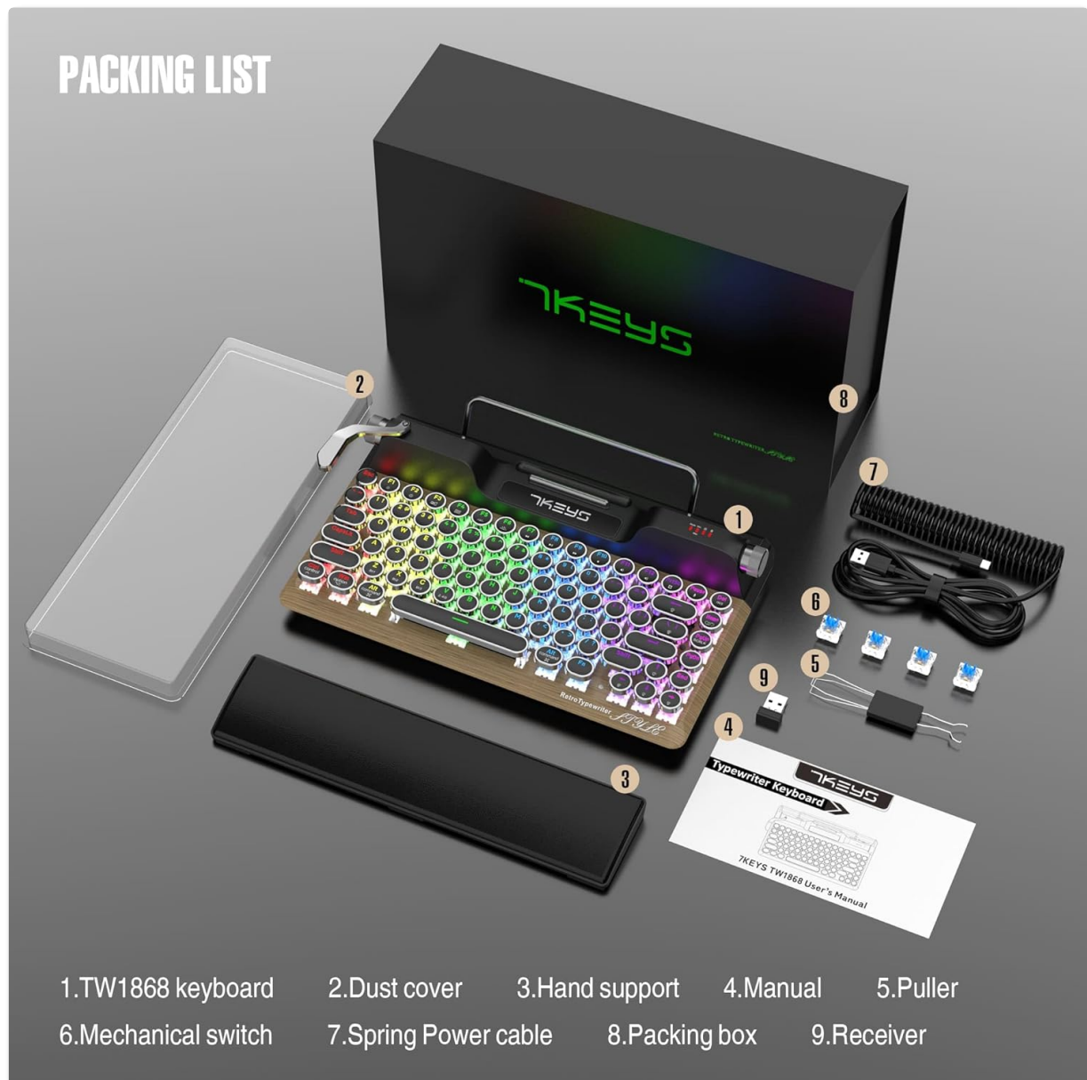
Image: All components included in the 7KEYS keyboard package, neatly arranged.