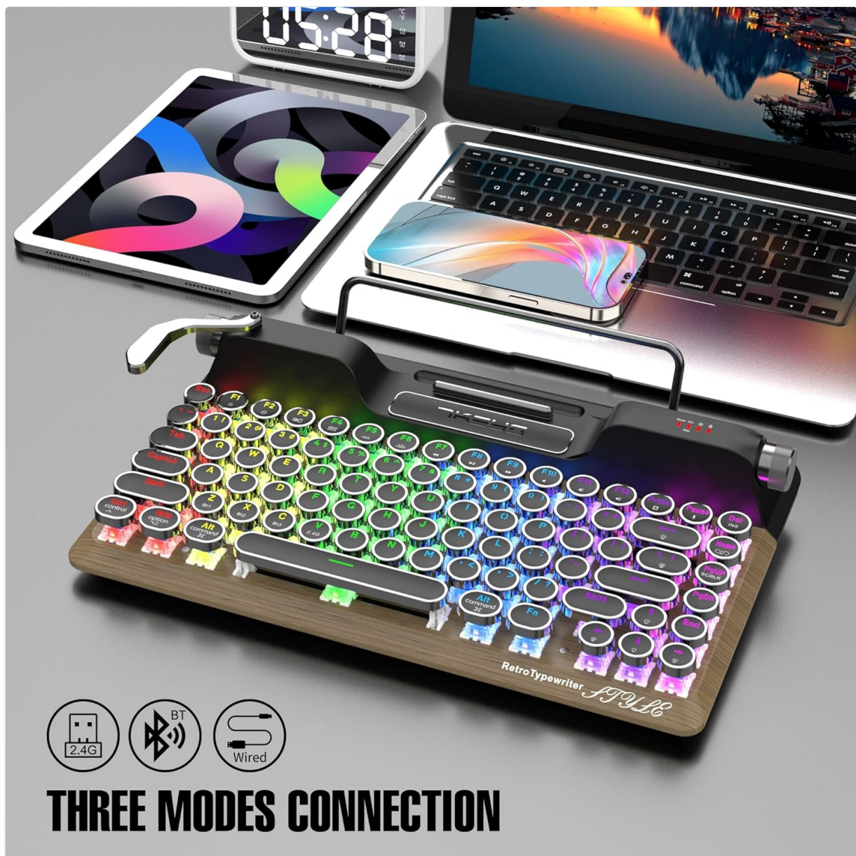
Image: The keyboard highlighting its versatile connectivity options: 2.4G wireless, Bluetooth, and wired USB-C.