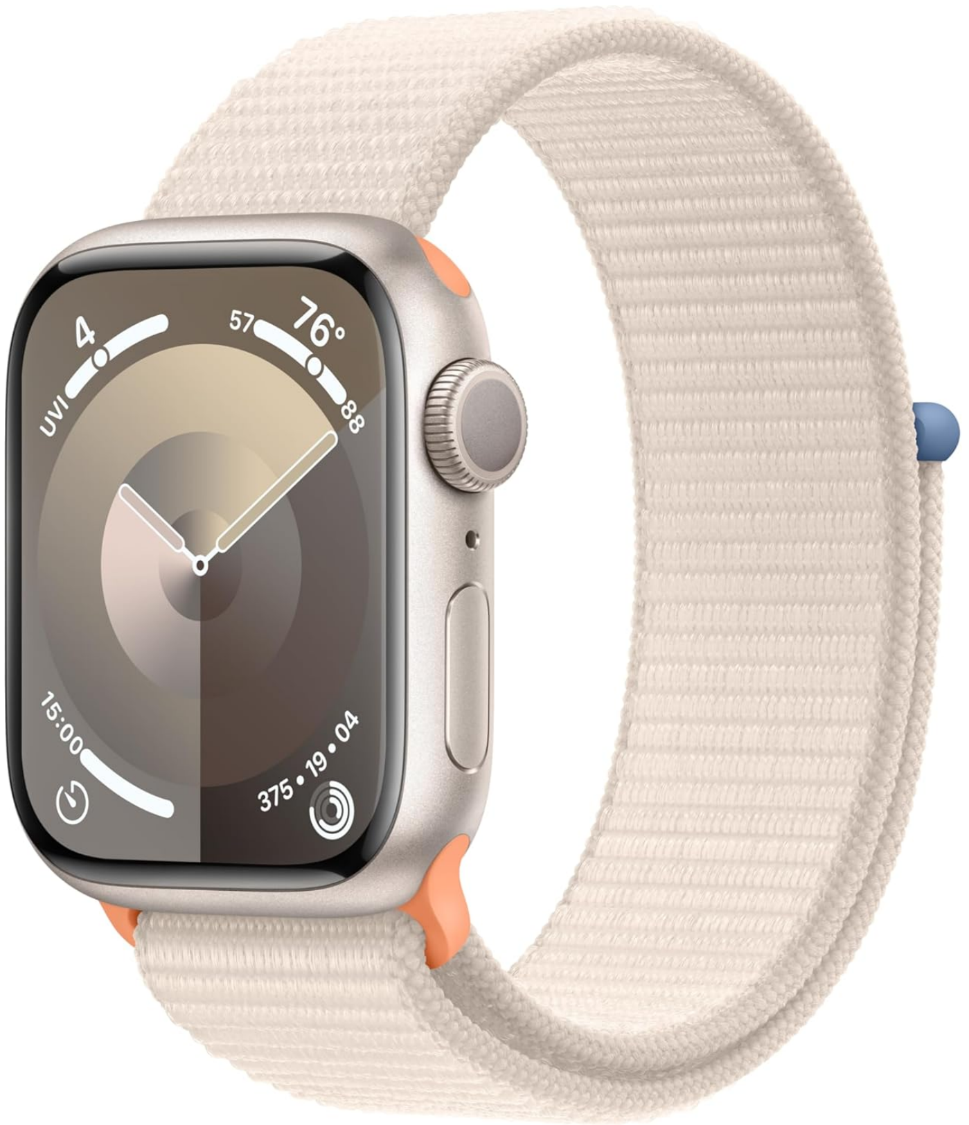
Image: Apple Watch Series 9 with Starlight Aluminum Case and Starlight Sport Loop, showcasing the watch face and band.

This model is carbon neutral when paired with the latest Sport Loop, reflecting Apple's commitment to environmental responsibility. It is built for durability, being crack resistant, IP6X-certified dust resistant, and swimproof with 50m water resistance.