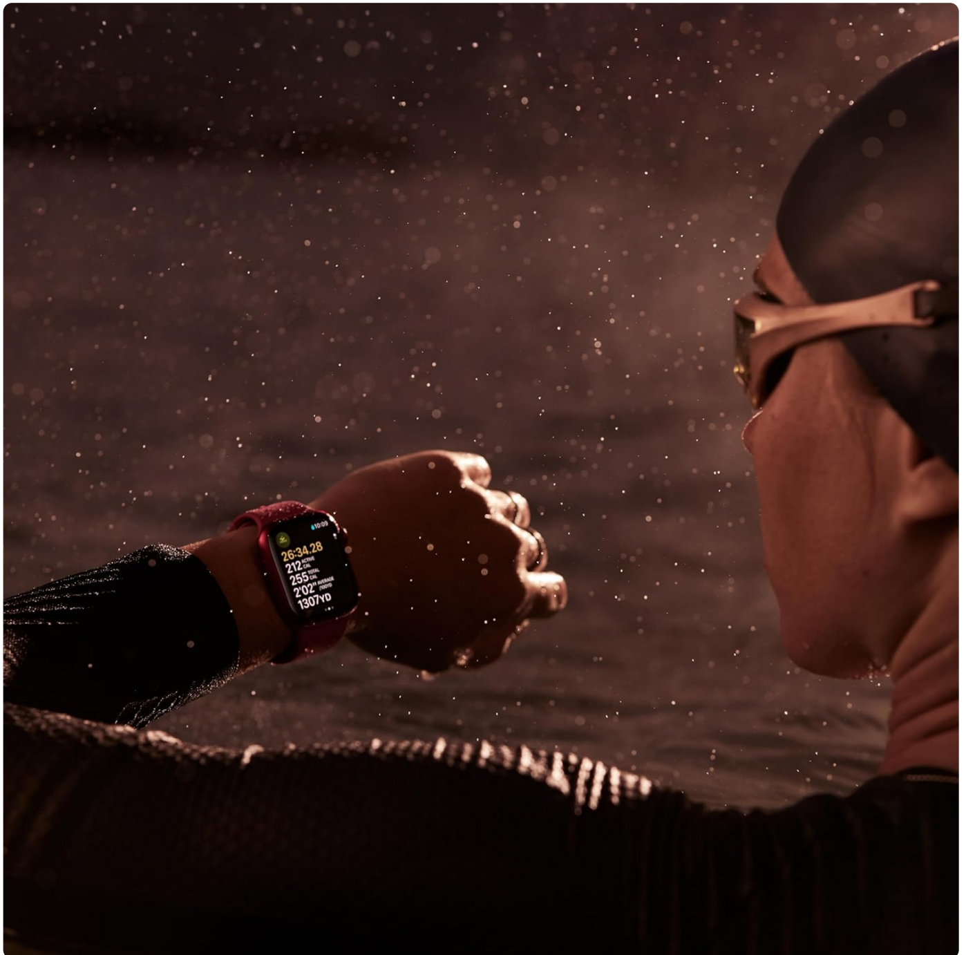
Image: A person wearing an Apple Watch Series 9 during a swim, with the watch face showing real-time workout data.

The Workout app offers a variety of training options and advanced metrics to provide deeper insights into your workout performance. Apple Watch Series 9 includes three months of Apple Fitness+ free, offering guided workouts and meditations.