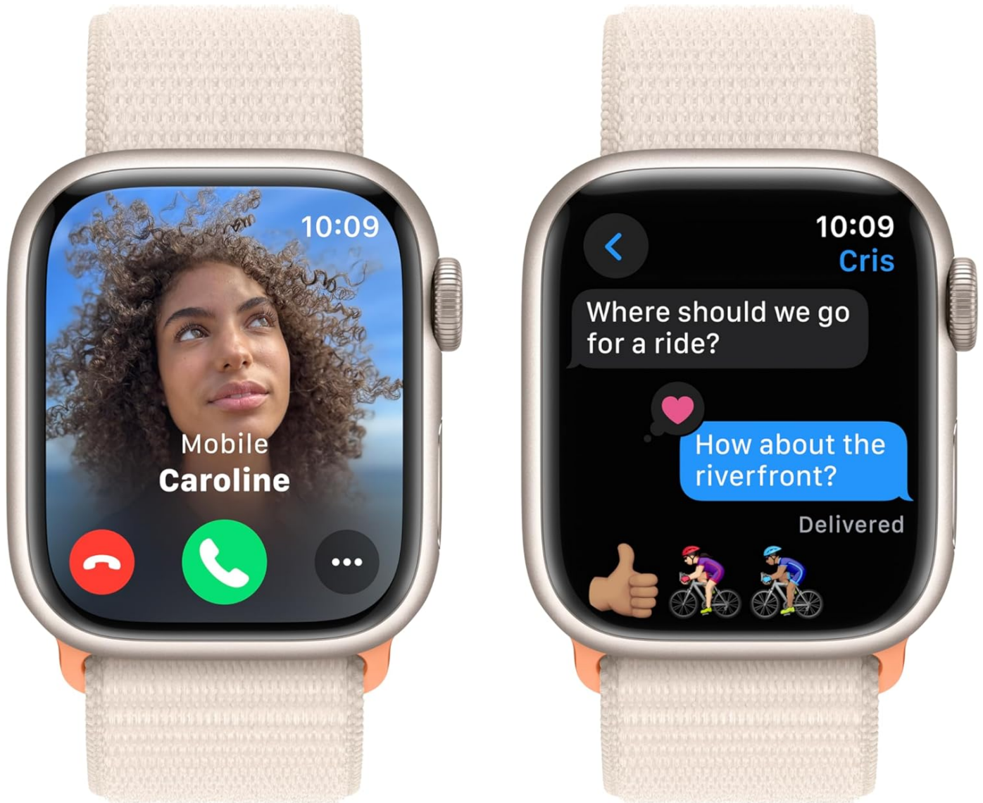
Image: Two views of the Apple Watch Series 9 screen, one showing an incoming call and the other displaying a text message conversation.

Stay connected on the go. You can send and receive texts, take calls, listen to music and podcasts, use Siri, and get notifications directly on your wrist. The GPS model works with your iPhone or Wi-Fi to maintain connectivity.