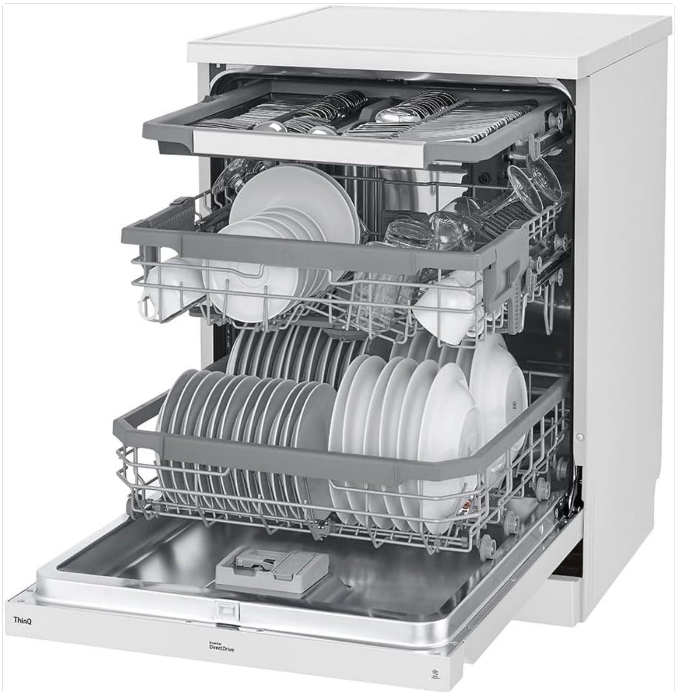
Image: A side view of the LG DF365FWS dishwasher with the door open, showing the racks loaded with various dishes, including plates, glasses, and cutlery in the top tray.