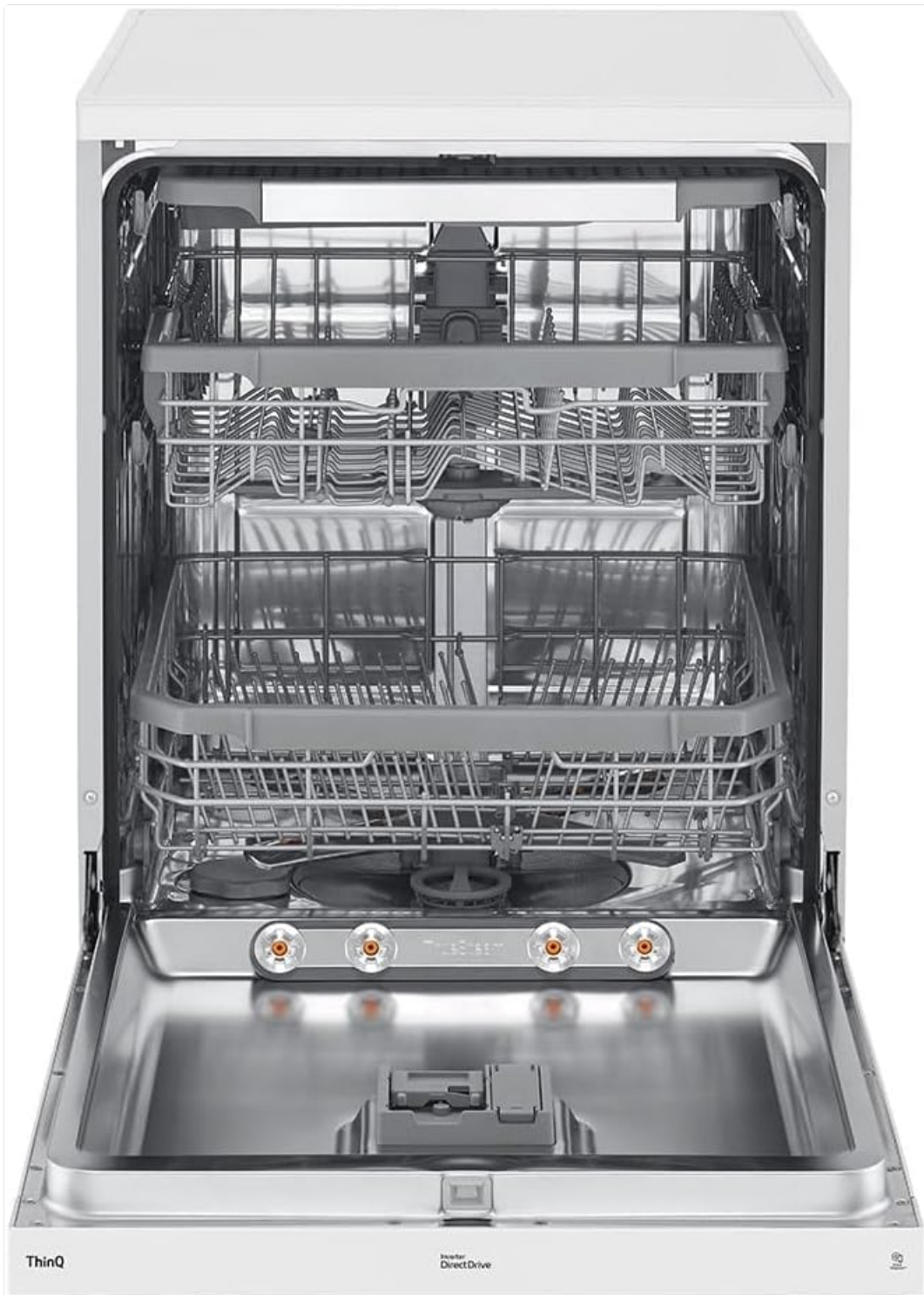
Image: The interior of the LG DF365FWS dishwasher, showing the three racks (upper, middle, and lower) and the spray arms. The door is fully open.