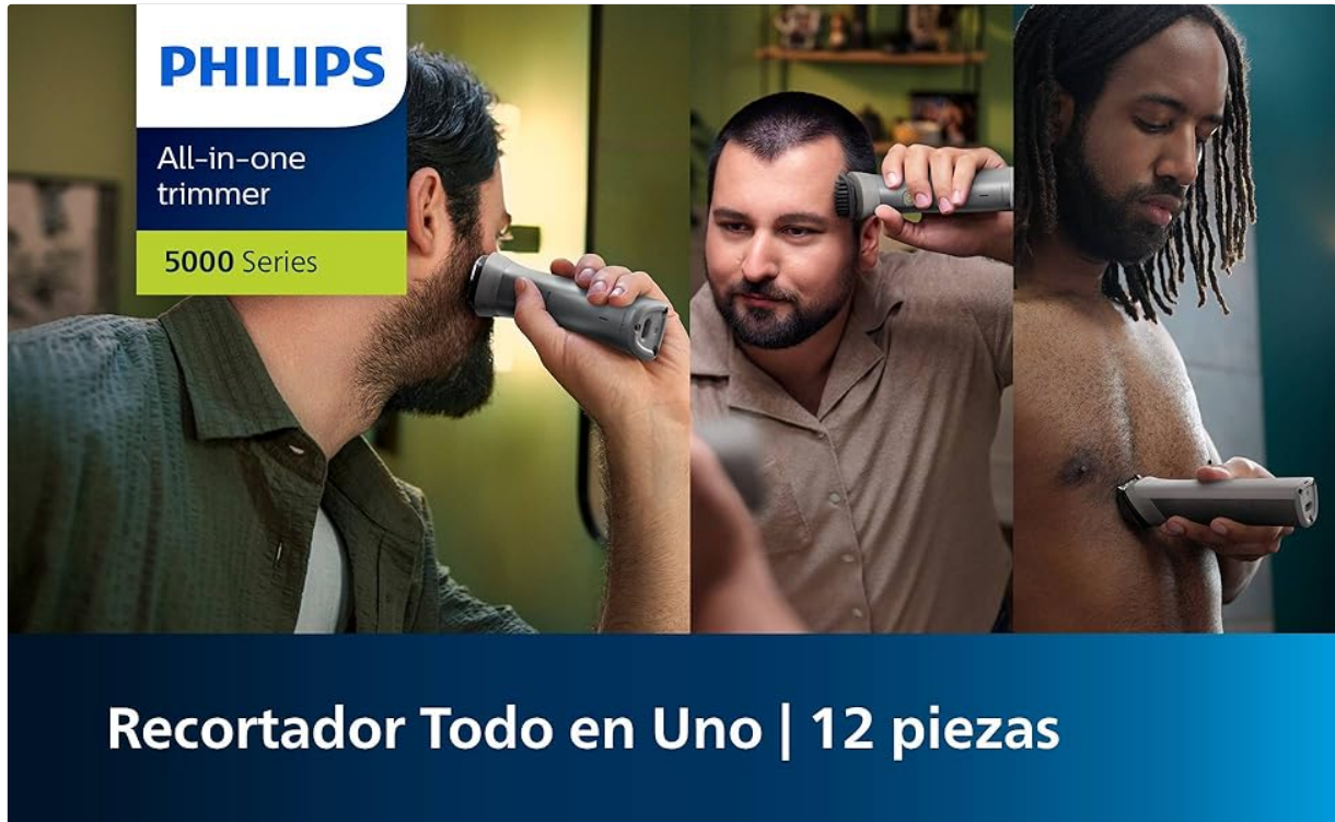
Image: The Philips Multigroom Series 5000 trimmer displayed with its full set of 12 versatile attachments, designed for complete face, head, and body styling.