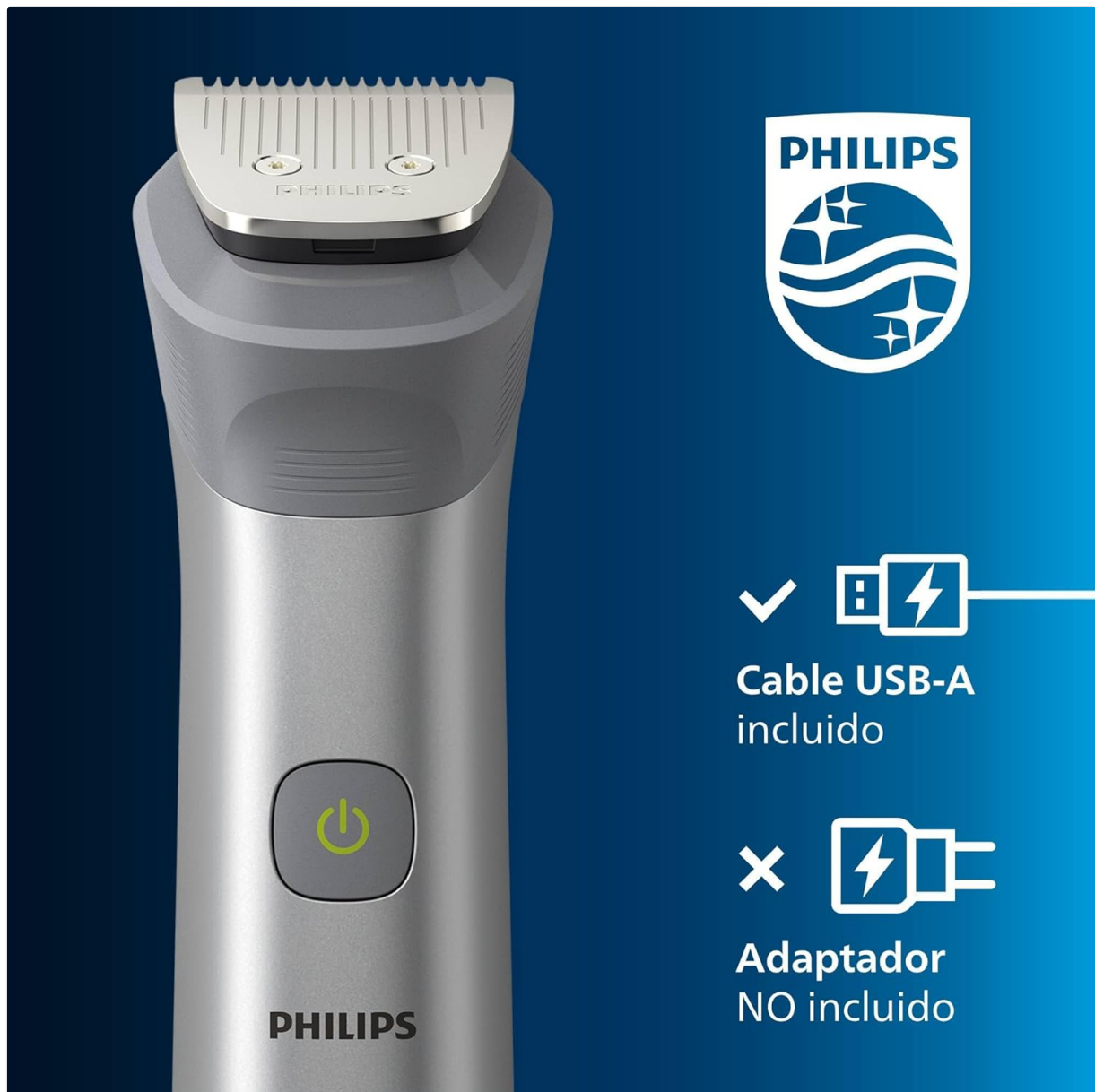
Image: Visual representation of the included USB-A charging cable and a note that the wall adapter is not part of the package.