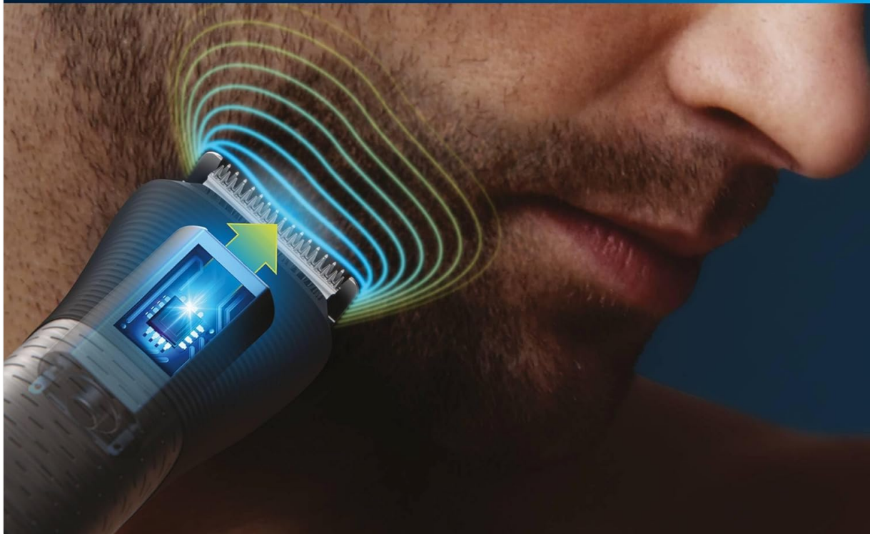
Image: An illustration detailing the BeardSense technology, which intelligently adapts the trimmer's power based on beard density for consistent performance.