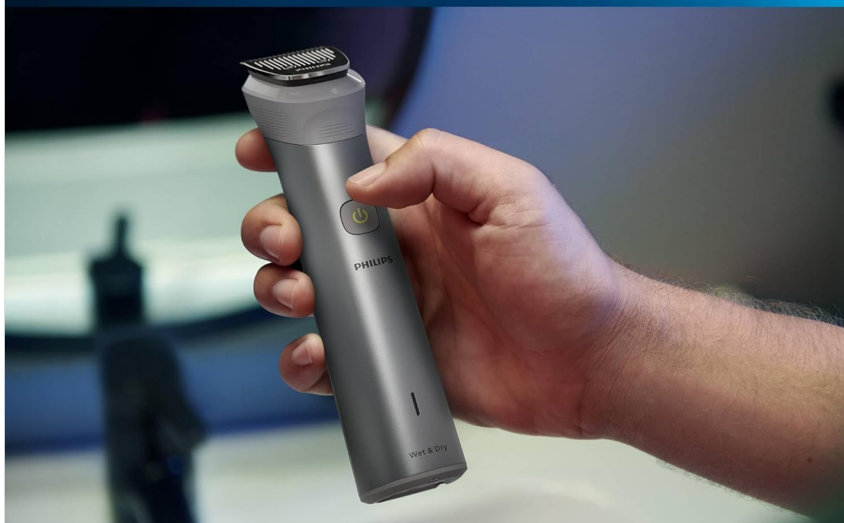
Image: The Philips Multigroom Series 5000, highlighting its Li-ion battery that offers up to 2 hours of continuous use.

Batería de larga duración dura hasta 2 horas