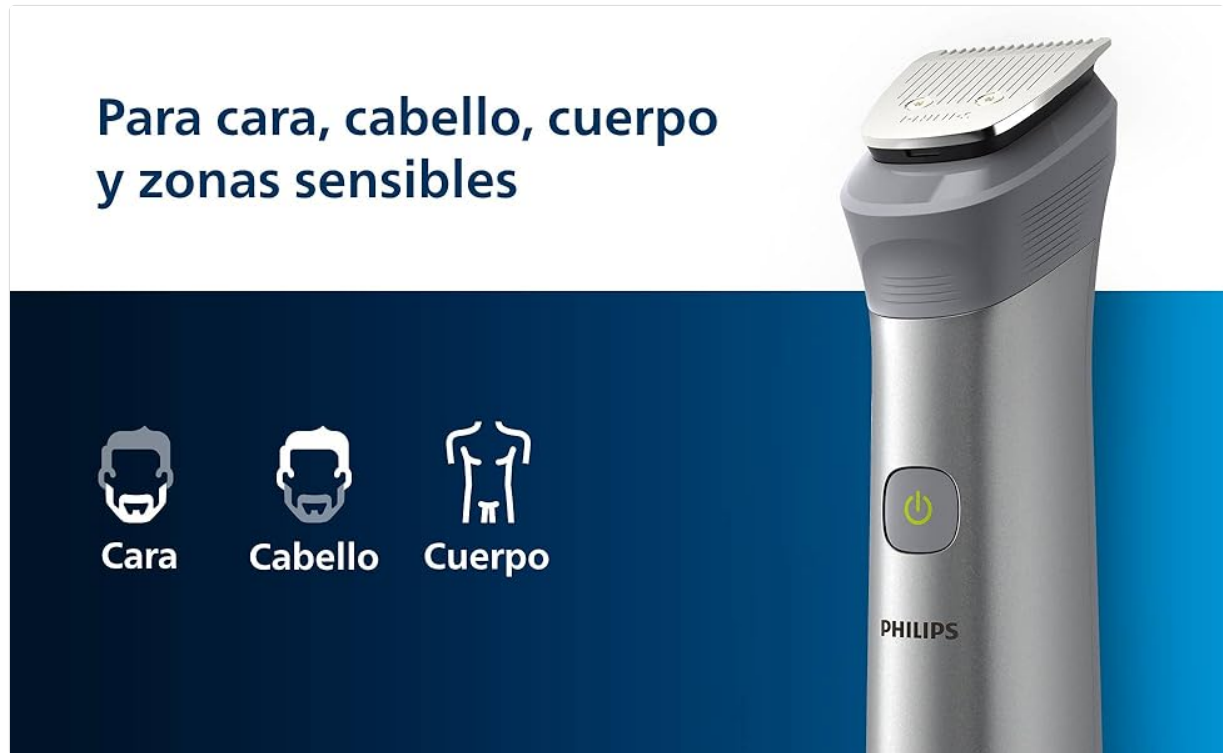
Image: Demonstrations of the Philips Multigroom Series 5000 being used for grooming facial hair, head hair, and body hair.

Attach the nose and ear trimmer for safe and comfortable removal of unwanted hair in these delicate areas.