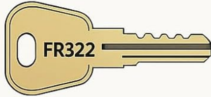
On the Key