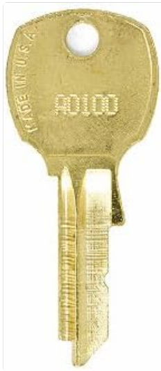
Figure 2: Example of a replacement key with a stamped code.