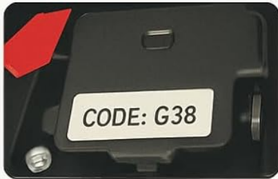
On a Label Inside/ Behind the Lock