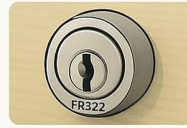
On the Lock Face