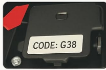
On a Label Inside/ Behind the Lock