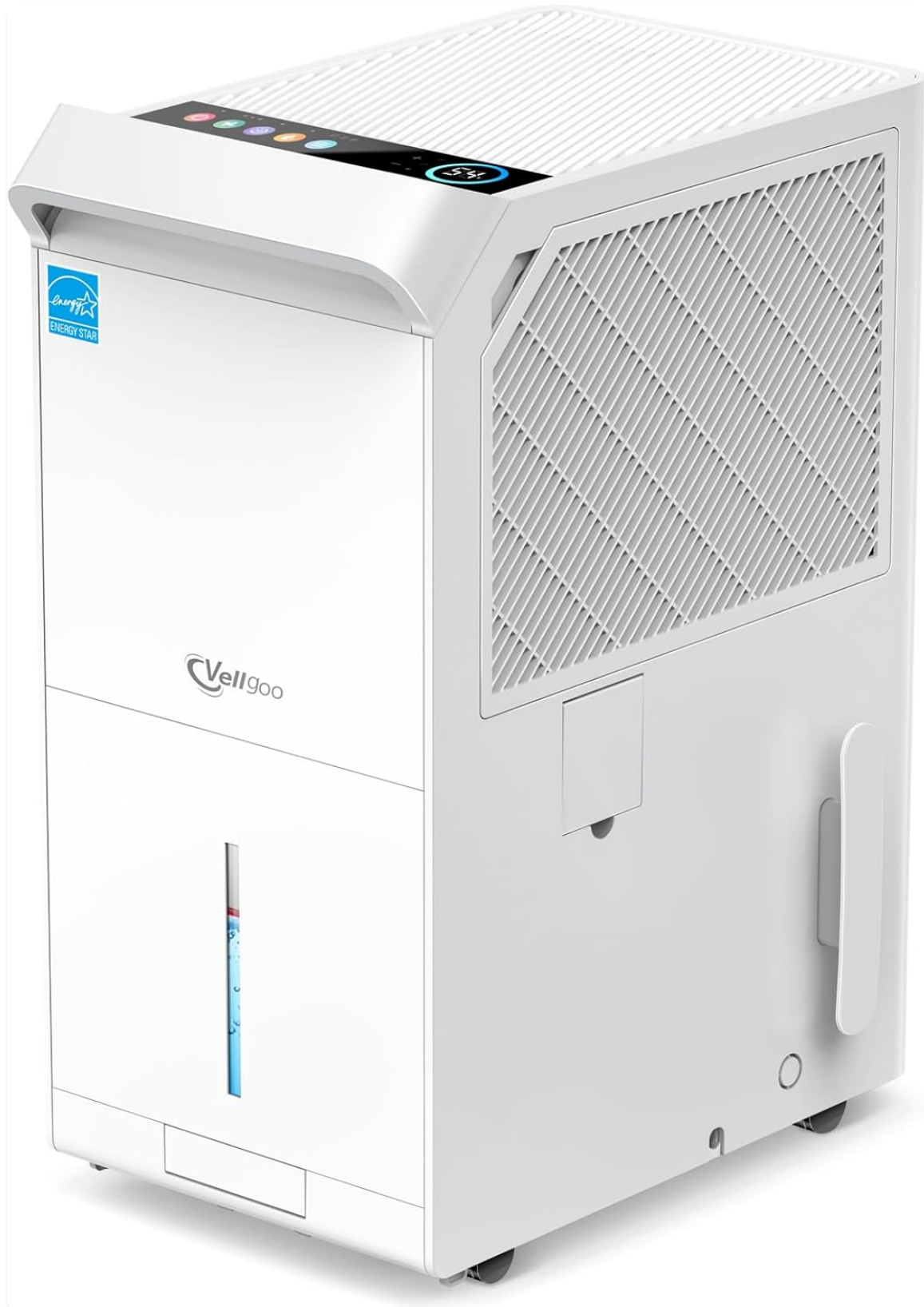
Figure 1: Vellgoo DryTank Pro Dehumidifier. This image displays the front and side view of the white dehumidifier, highlighting its compact design and control panel.