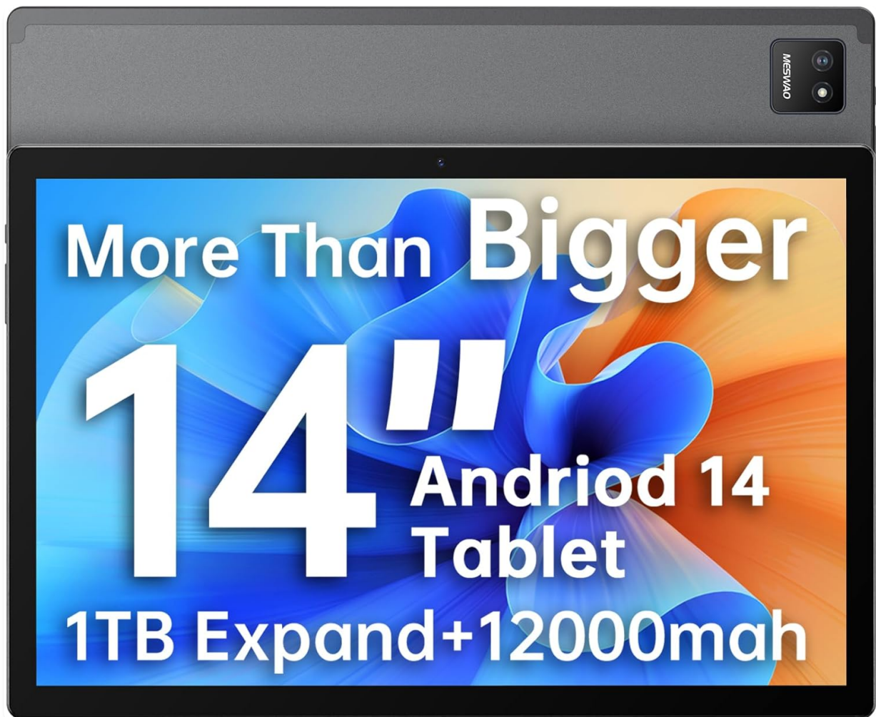
Image: The MESWAO 14-inch Android Tablet, highlighting its large screen, Android 14 OS, 1TB expandable storage, and 12000mAh battery.