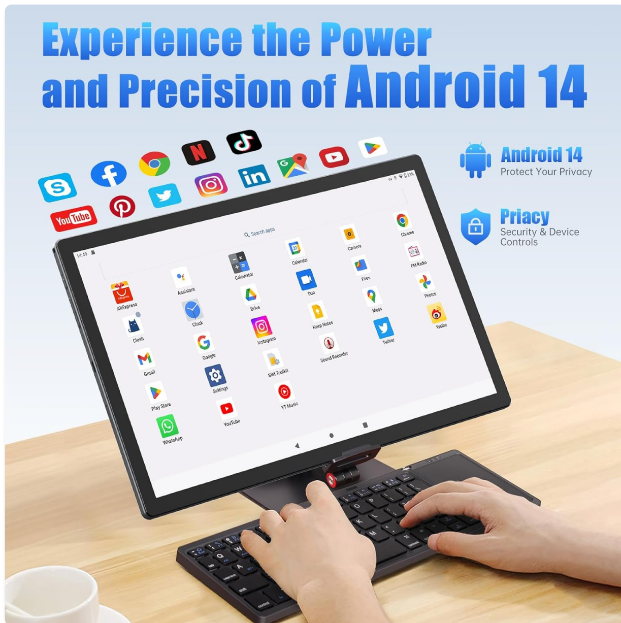
Image: The MESWAO tablet showcasing its Android 14 interface with various pre-installed and downloadable applications, emphasizing privacy and security features.

Your tablet runs on the upgraded Android 14 system, offering a personalized, secure, and user-friendly experience. It supports online system updates (OTA).