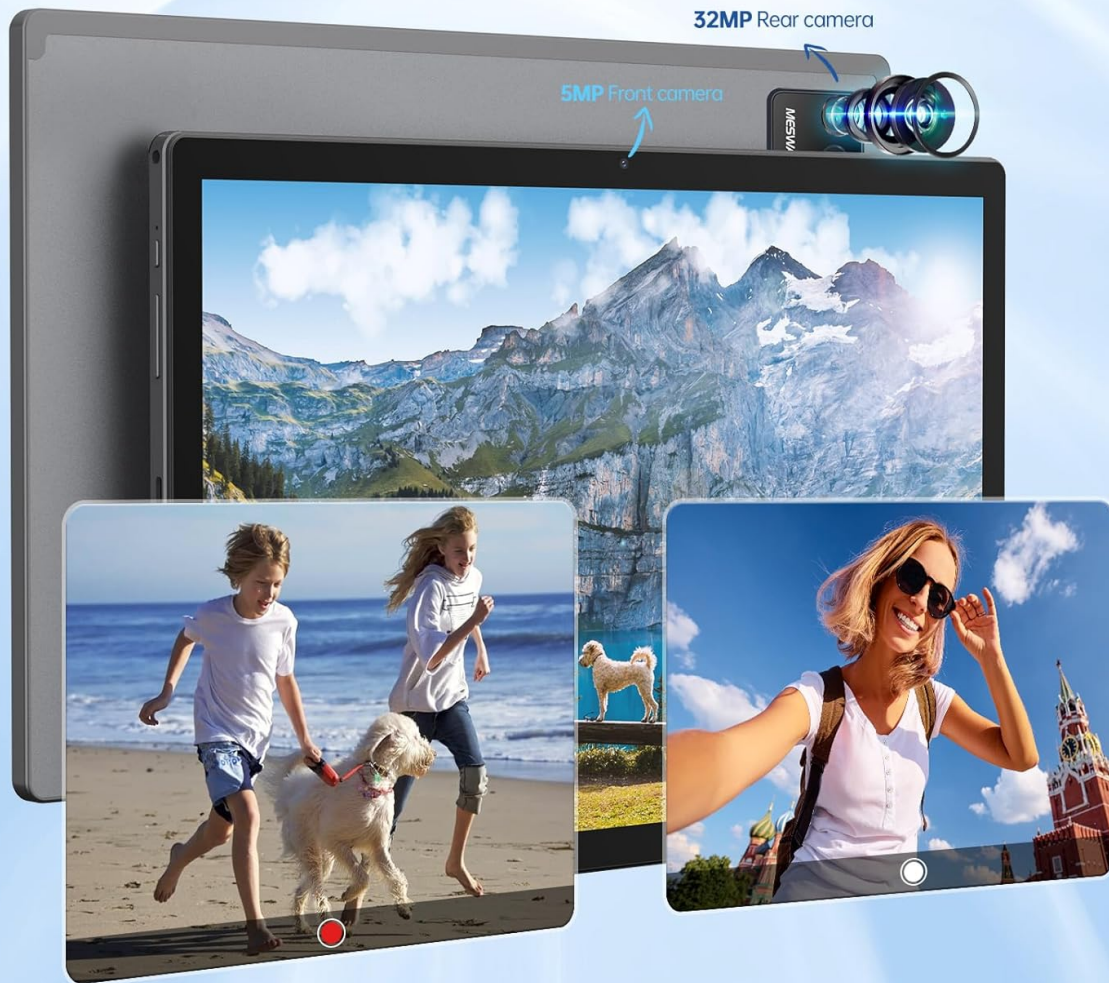
Image: The MESWAO tablet highlighting its 32MP rear camera and 5MP front camera, with example photos demonstrating its photography capabilities.