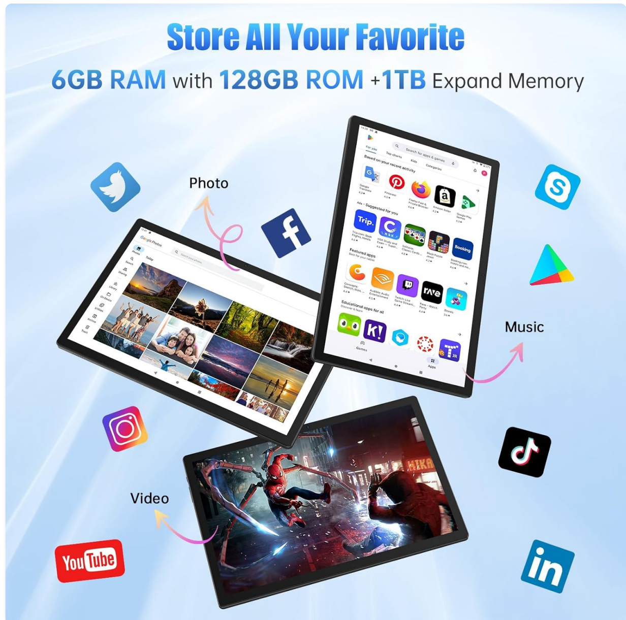
Image: A visual representation of the MESWAO tablet's storage capabilities, highlighting 6GB RAM, 128GB ROM, and 1TB expandable memory, with various app icons suggesting ample space for media and applications.

You can install applications from the Google Play Store. Your tablet comes with 128GB of internal storage and supports expansion up to 1TB via a microSD card (sold separately).