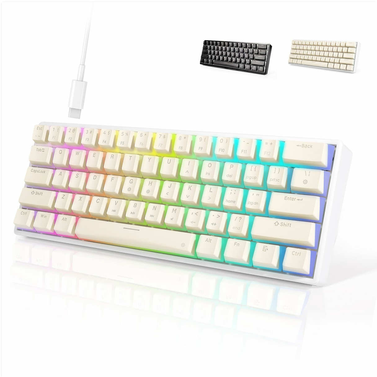
Image 1.1: The OUPARY 61-Key Wired RGB Gaming Mechanical Keyboard in a typical desktop setup.