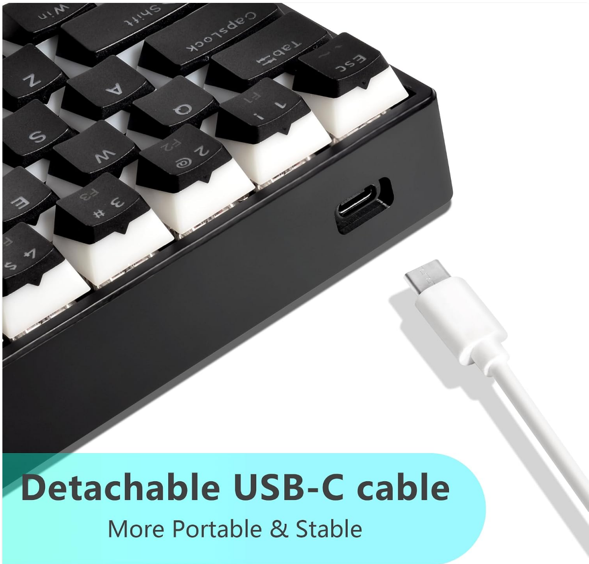
Image 3.1: Detachable USB-C cable connection for enhanced portability and stability.

4. The keyboard will automatically be recognized by your operating system.