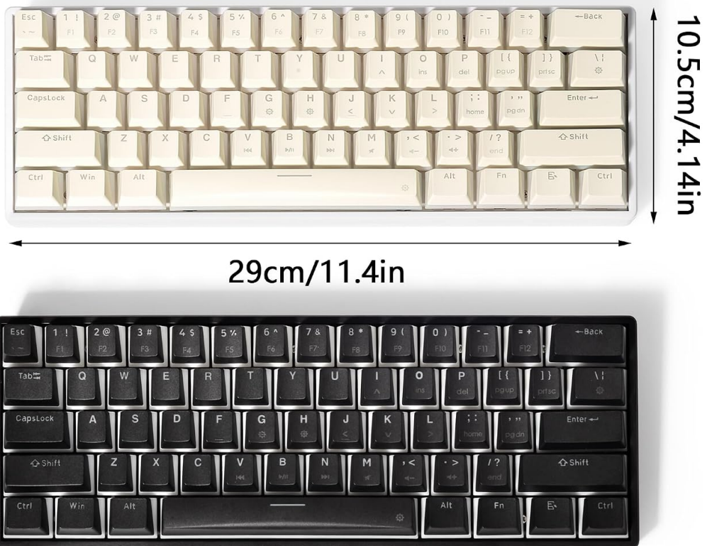
Image 7.1: Product dimensions of the OUPARY 61-Key Mechanical Keyboard.