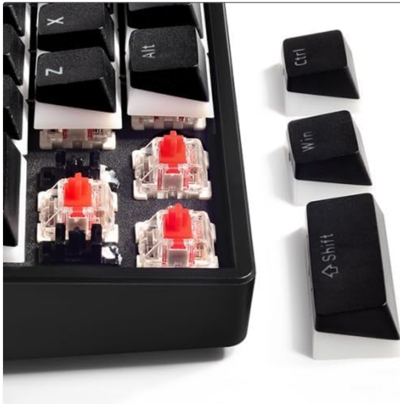
Image 5.1: Close-up view of the mechanical red switches and removable keycaps.

Note: This keyboard supports 3-pin mechanical switches. Ensure any replacement switches are compatible.