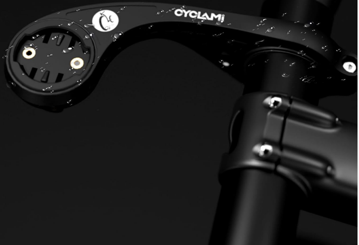
Image 5.2: The mount demonstrating its excellent water resistance, suitable for various weather conditions.

Unaffected by harsh environments longer service life