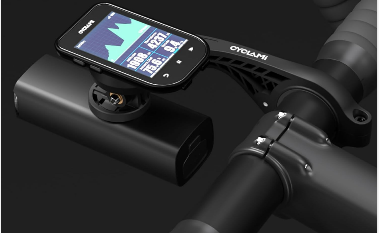
Image 1.1: The CYCLAMI S2 mount showcasing its multifunctionality with a bike computer and a headlight.

Can install gopro/bike computer/headlights /sport camera /flashlight