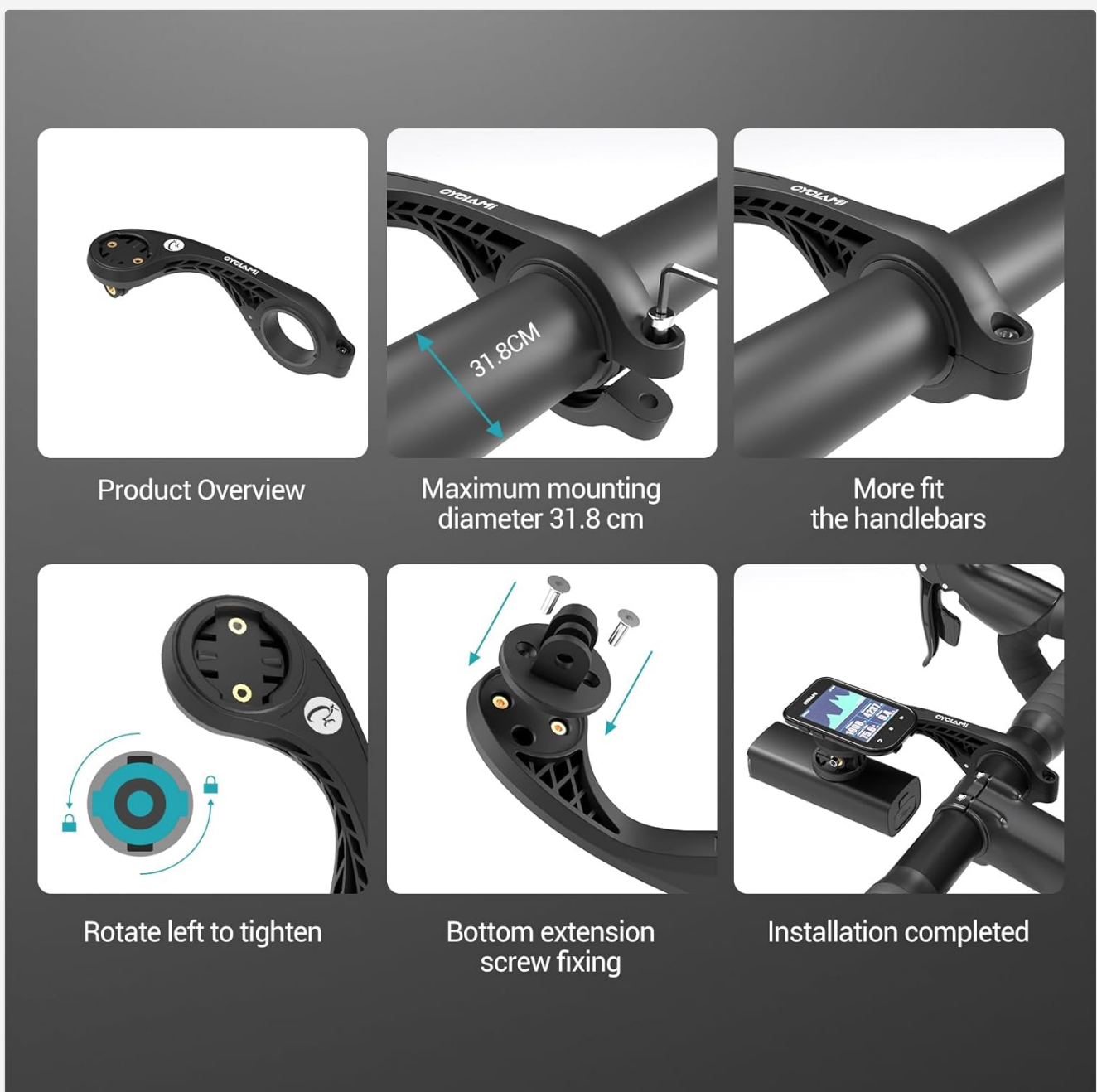
Image 3.1: Visual guide for installing the CYCLAMI S2 mount, detailing each step from overview to completion.